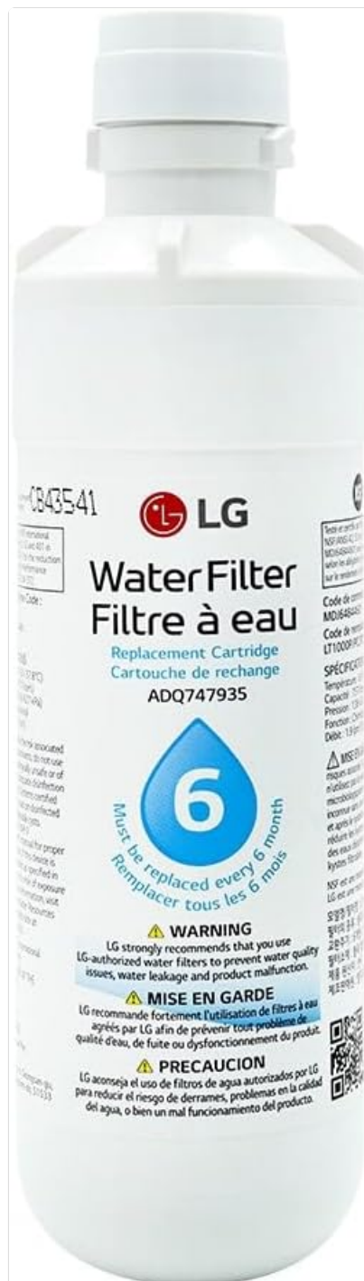
Image: A close-up view of the LG LT1000P2 water filter, showing its design and labeling.