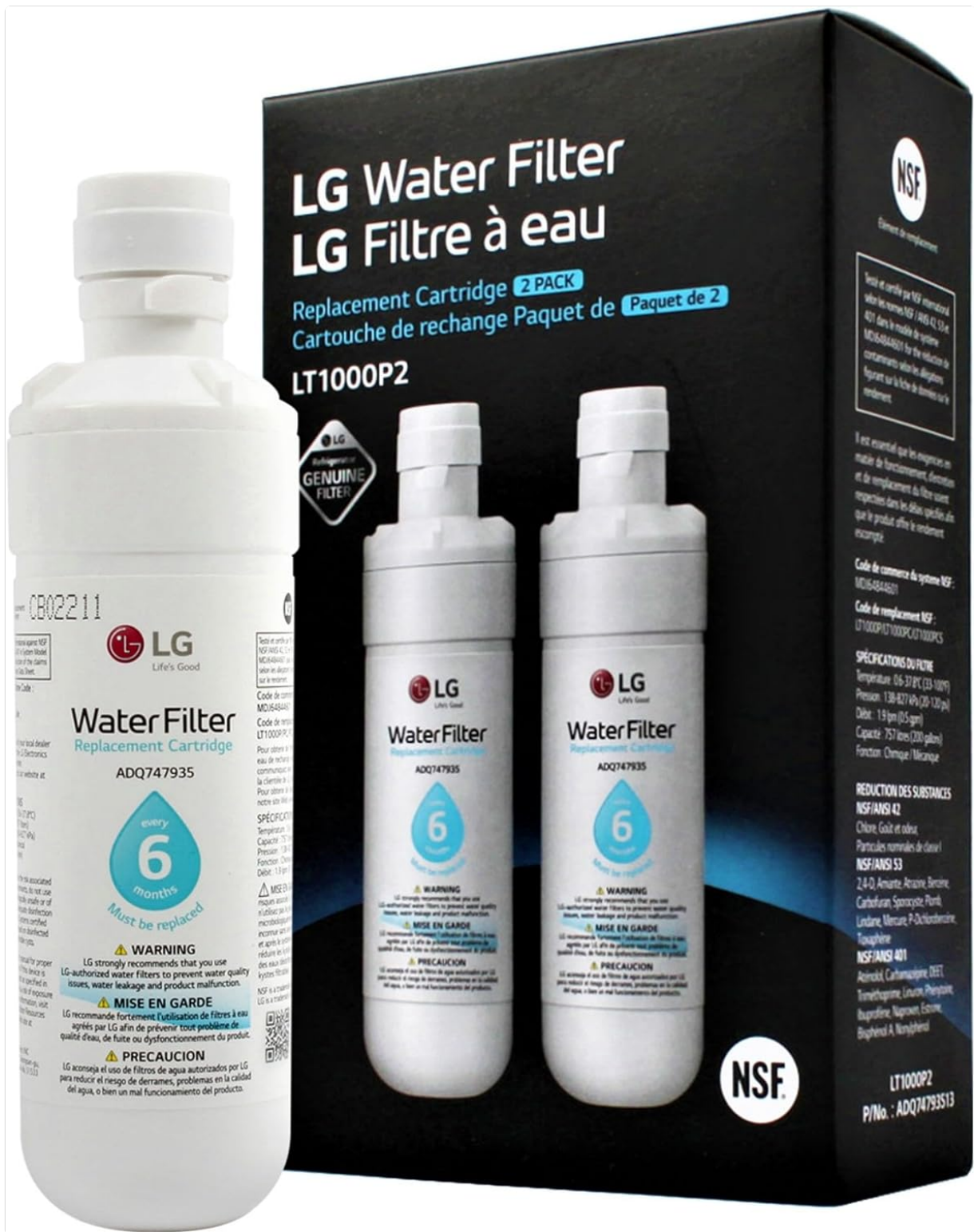
Image: The LG LT1000P2 water filter shown with its retail packaging, highlighting the product's design and branding.