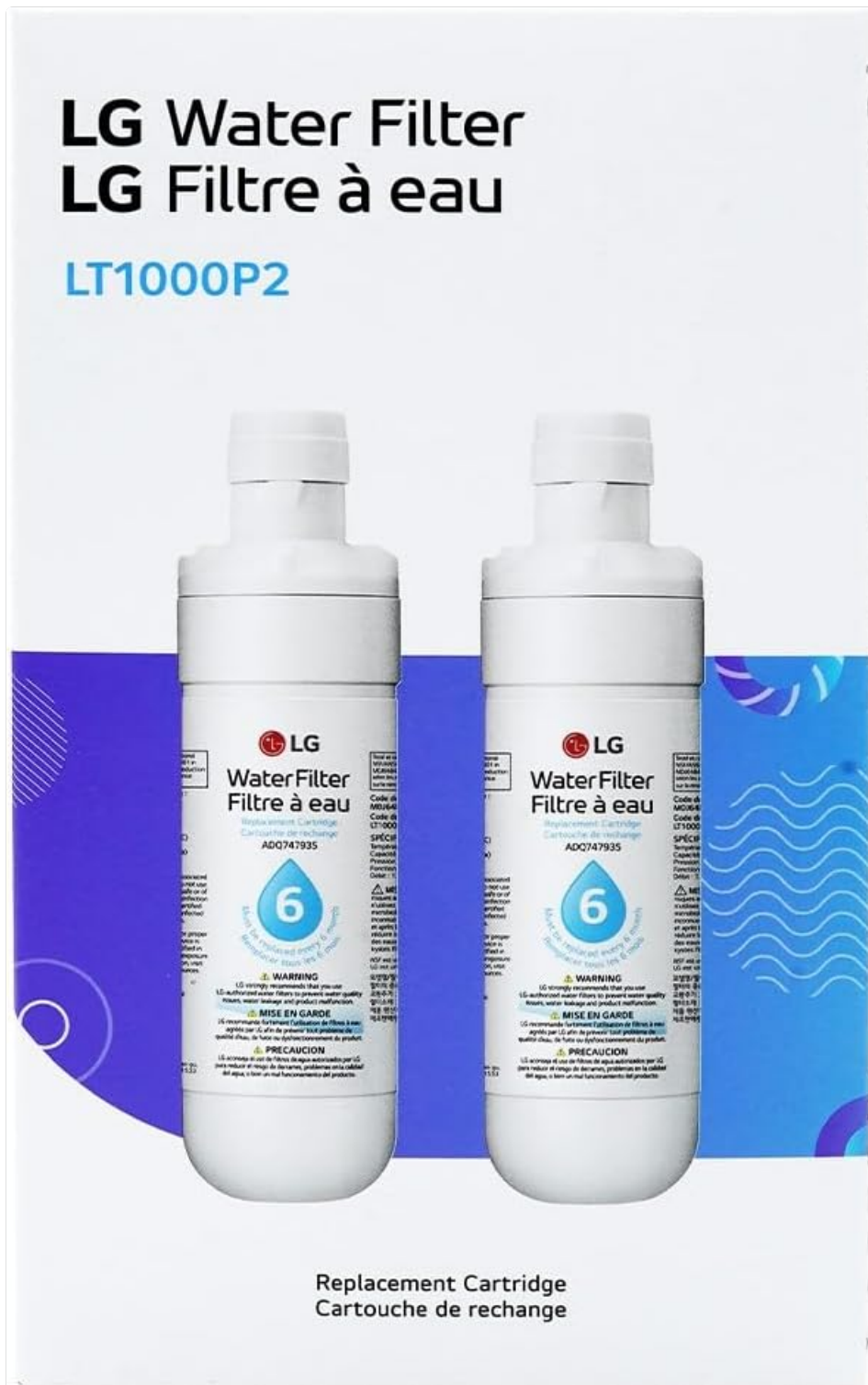
Image: The two-pack of LG LT1000P2 water filters as they appear in their packaging.