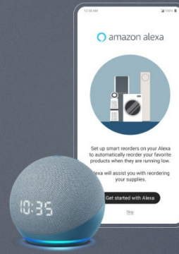
Image: Visual representation of LG ThinQ app integration with Amazon Alexa for smart reordering of supplies like water filters.

To enjoy the benefits of smart reorders, connect your LG ThinQ account with Alexa so you never run out.