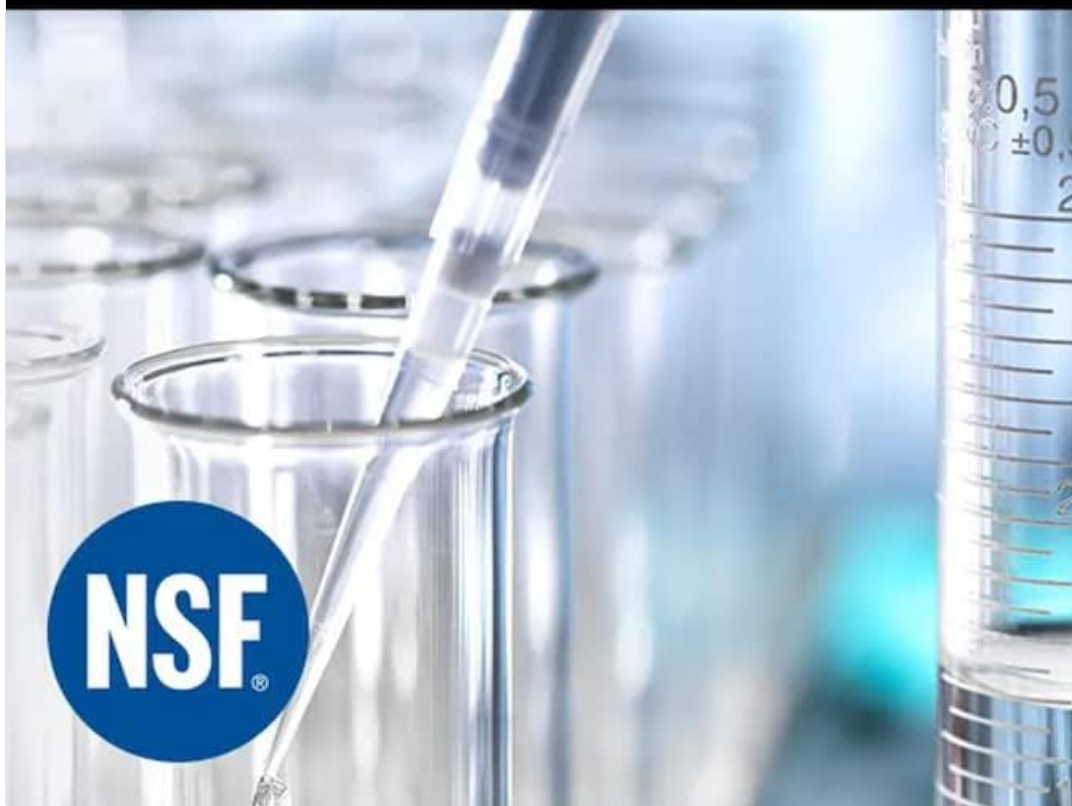
Image: Illustration of NSF certification, indicating the filter has been tested and certified for quality and contaminant reduction.