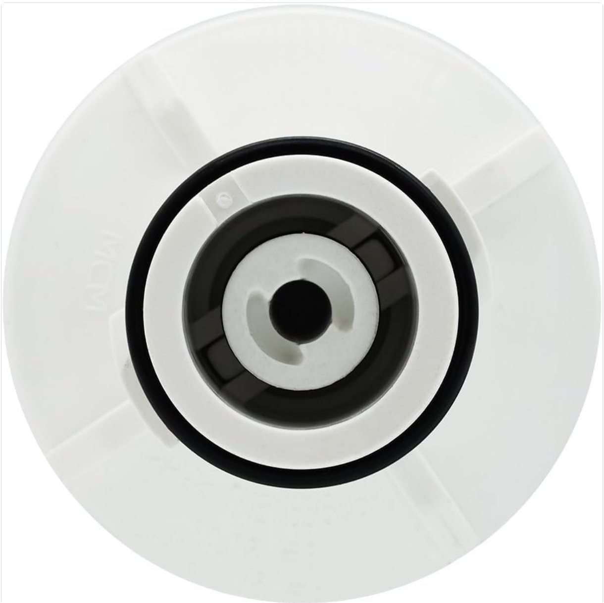
Image: The top of the LG LT1000P2 water filter, indicating the twist-and-lock mechanism.