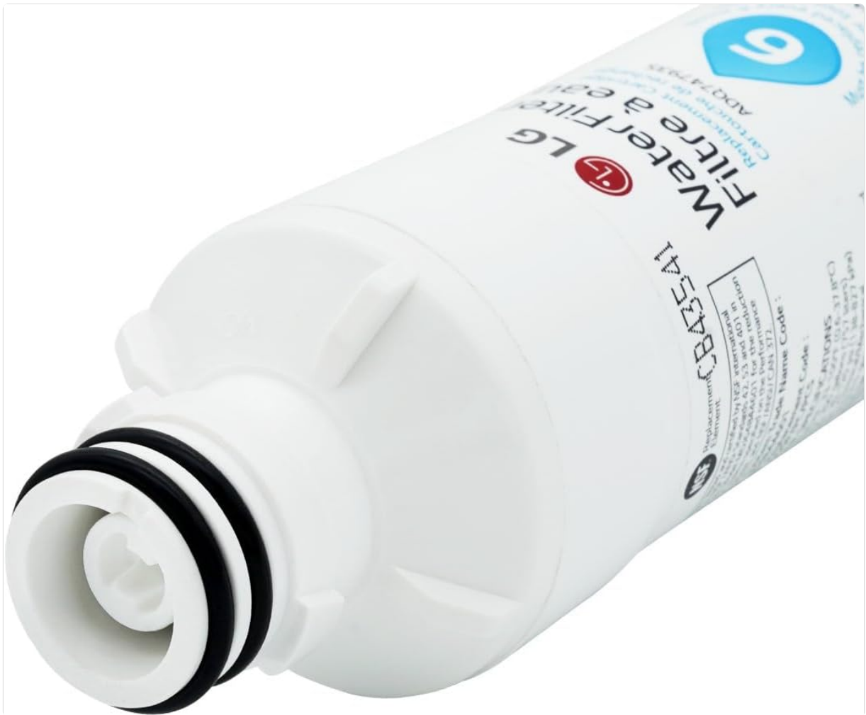
Image: The bottom connection point of the LG LT1000P2 water filter, showing the O-rings for a secure seal.