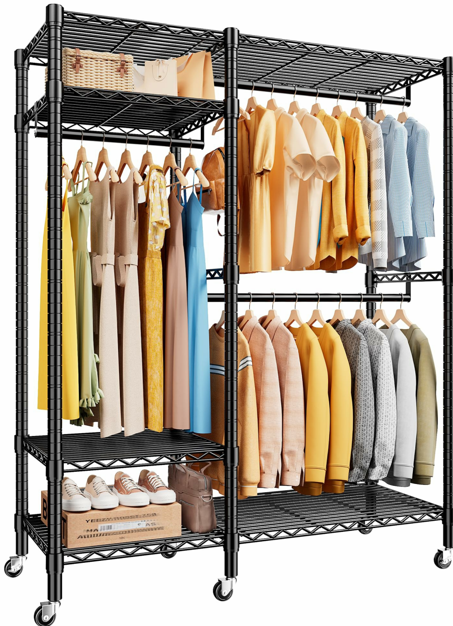
Image: Fully assembled Raybee Heavy Duty Clothes Rack, showcasing its storage capacity with various clothing items and boxes.