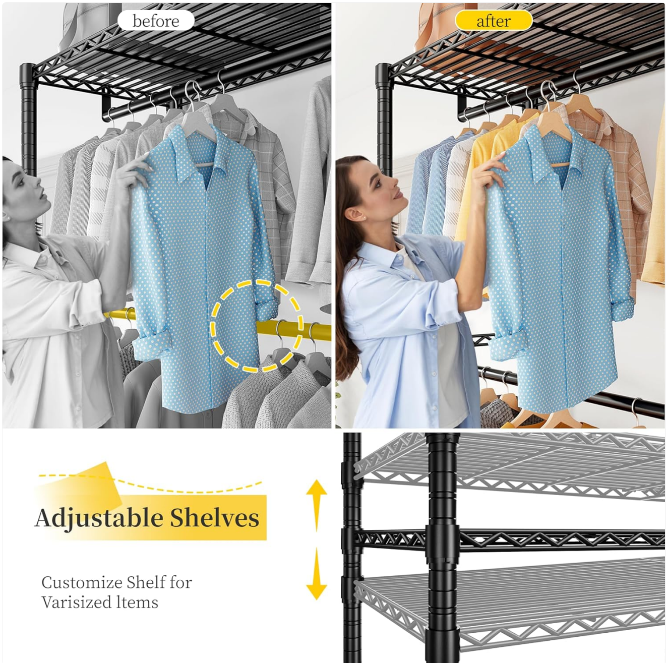
Image: Demonstration of adjustable shelves for customizing storage space for various items.