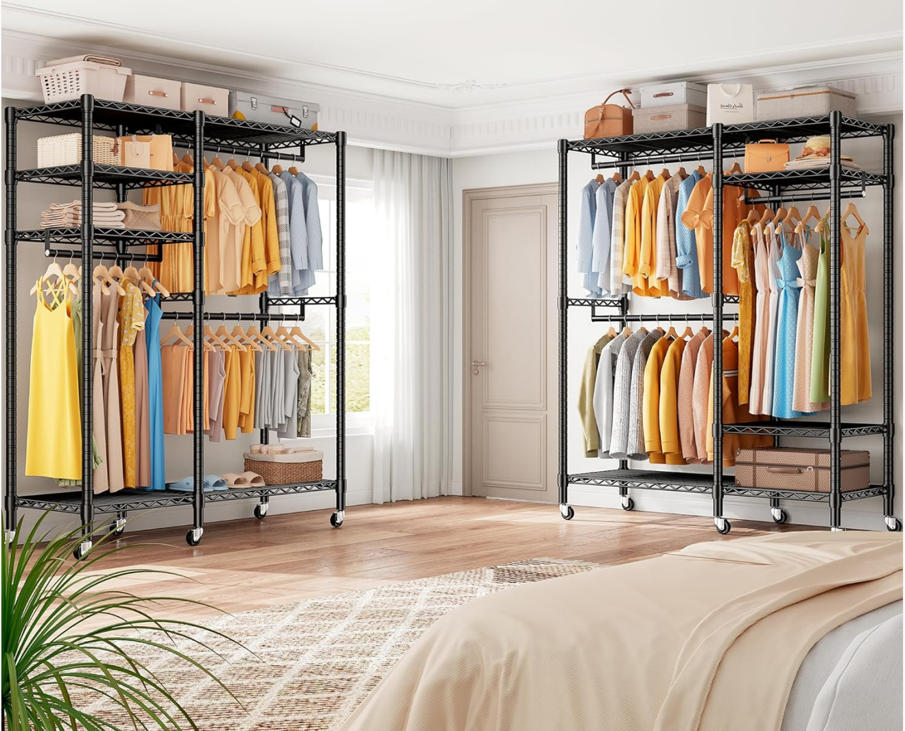
Image: Examples of different rack configurations to suit diverse storage requirements.