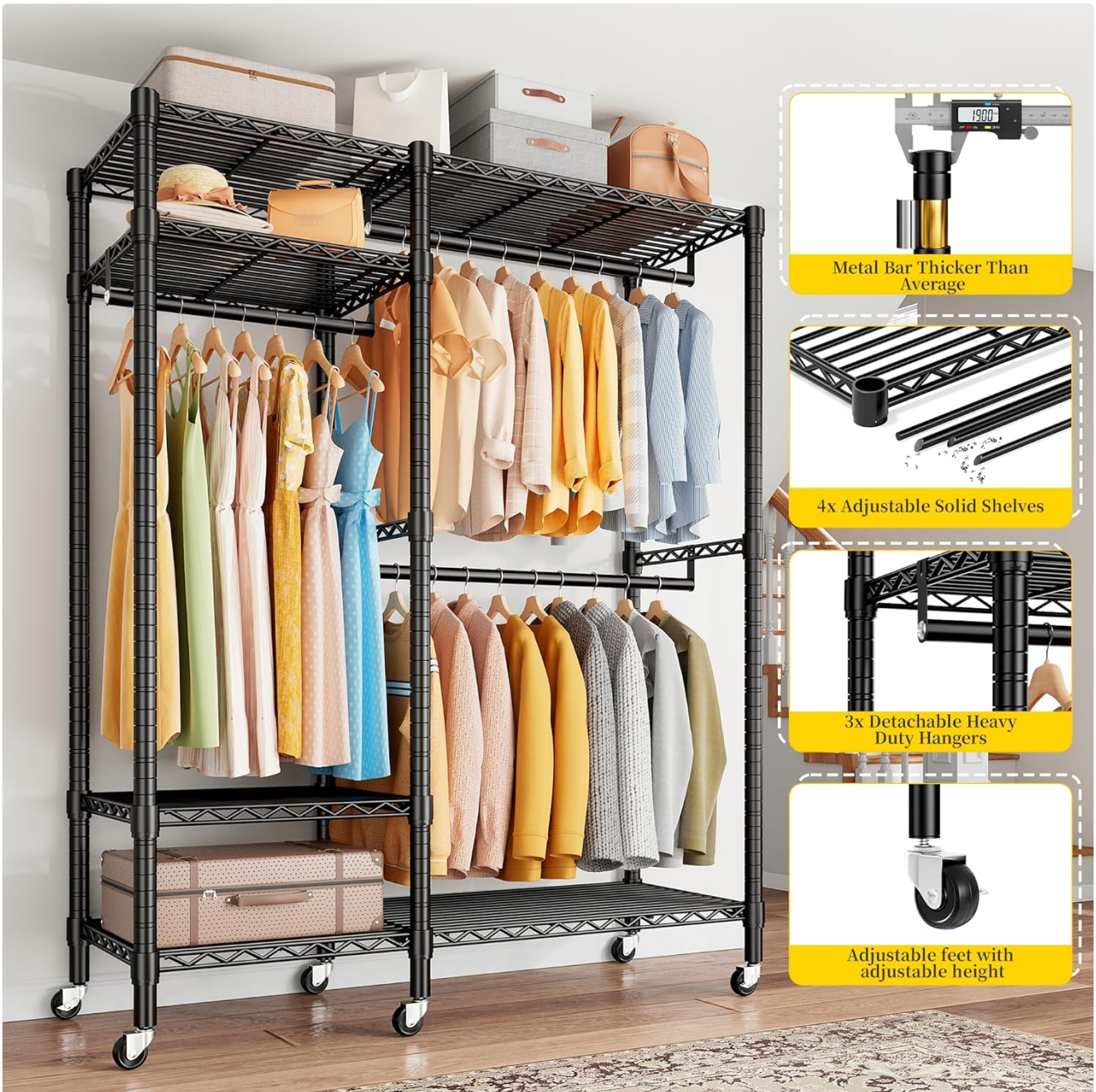
Image: Detailed view of the rack's construction, highlighting the thicker metal bars, adjustable shelves, detachable hanging rods, and adjustable feet with wheels.