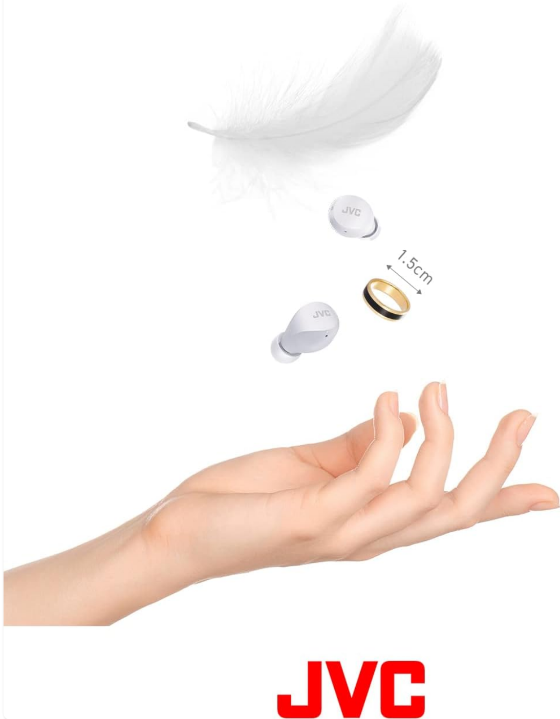
Image: Earbuds illustrating stable wireless connectivity with various devices.