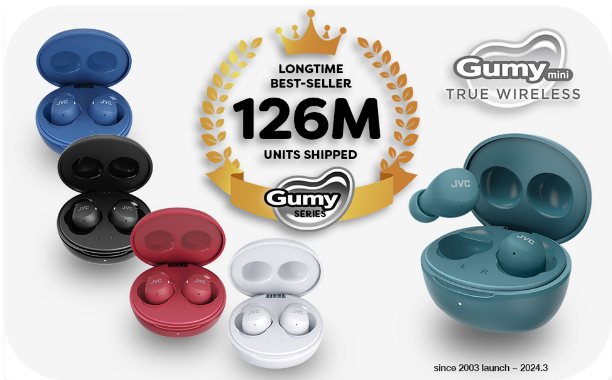
Image: Contents of the JVC Gummy Mini True Wireless Earbuds package.