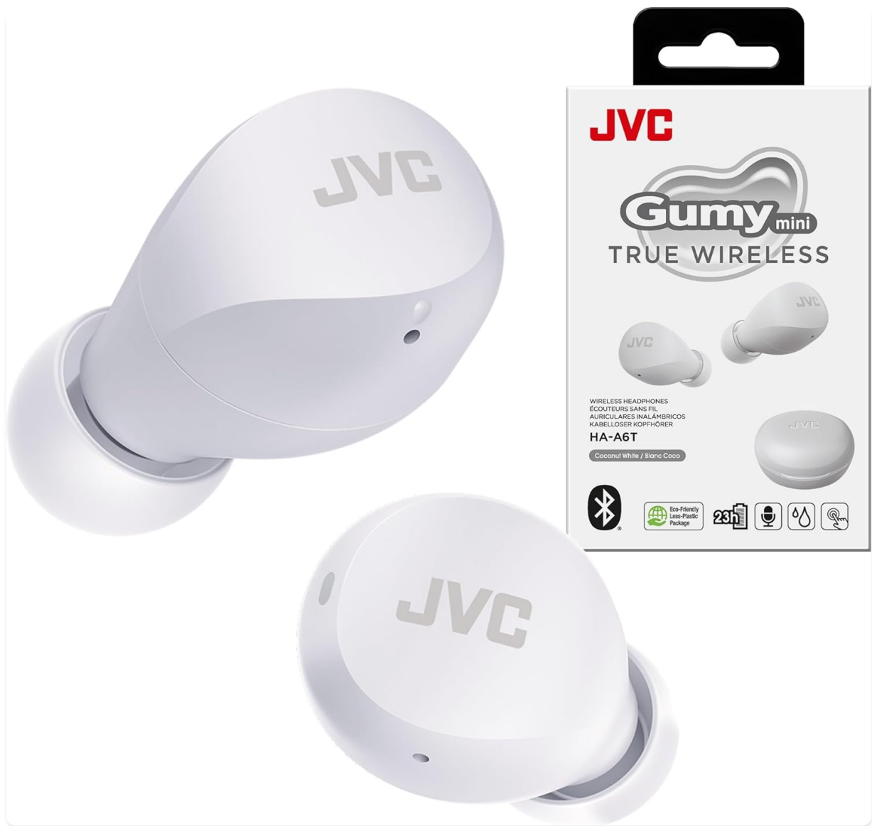
Image: JVC Gummy Mini True Wireless Earbuds (HAA6TW) in white, alongside their retail packaging.