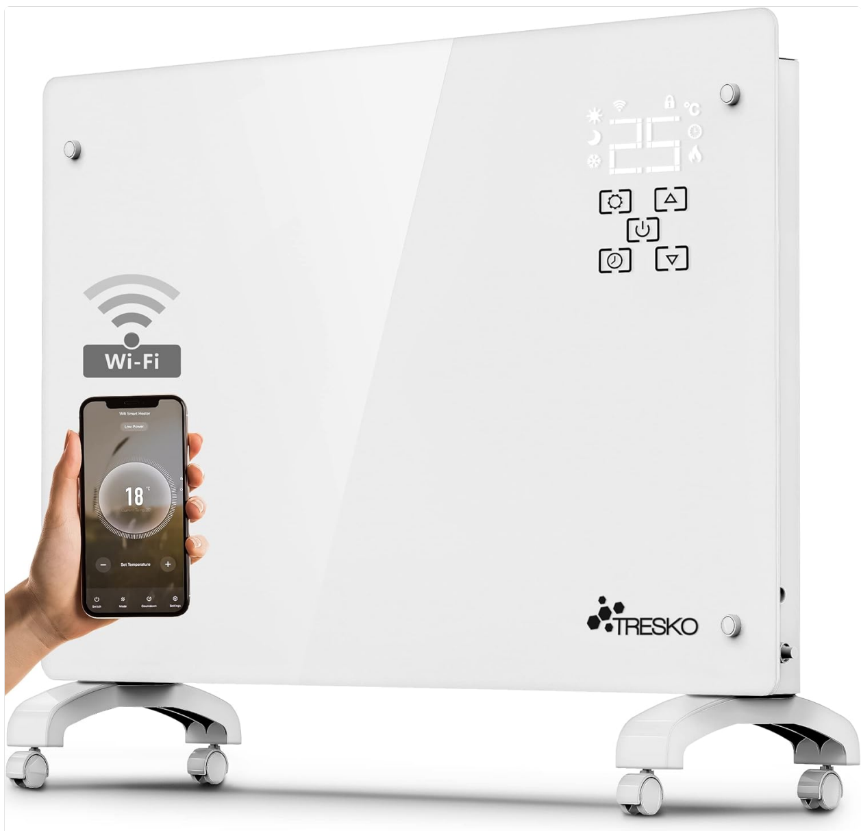
The TRESKO WiFi Smart Electric Convection Heater, showcasing its modern design and integrated WiFi functionality for remote control via a smartphone application.