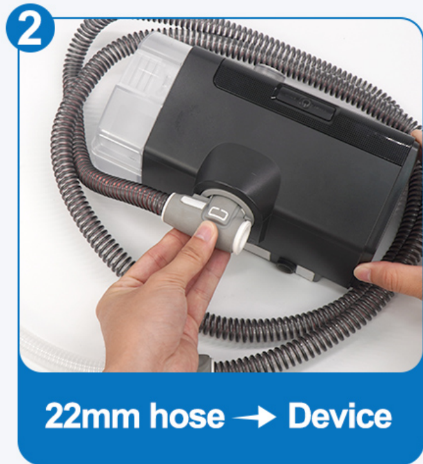
Figure 4: Visual instructions for the correct connection sequence: short tube to 22mm hose, then 22mm hose to the device.