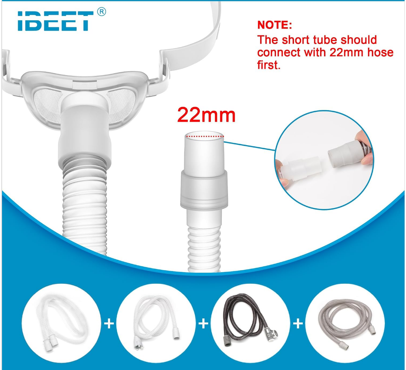
Figure 3: Illustration of connecting the short tube to a 22mm hose, a crucial first step in the setup process.

NOTE: The short tube should connect with 22mm hose first.