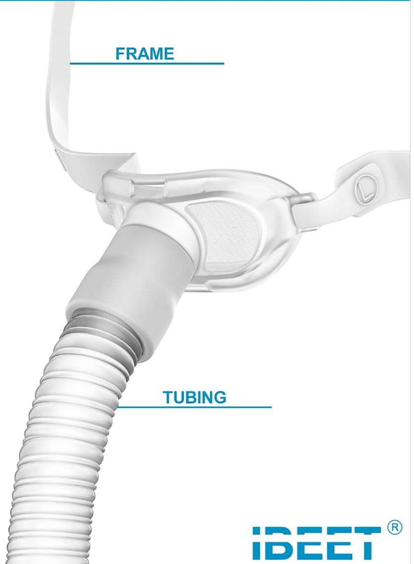
Figure 1: Overview of the IBEET P10 Replacement Kit components, highlighting the frame, tubing, and gentle exhaust design.