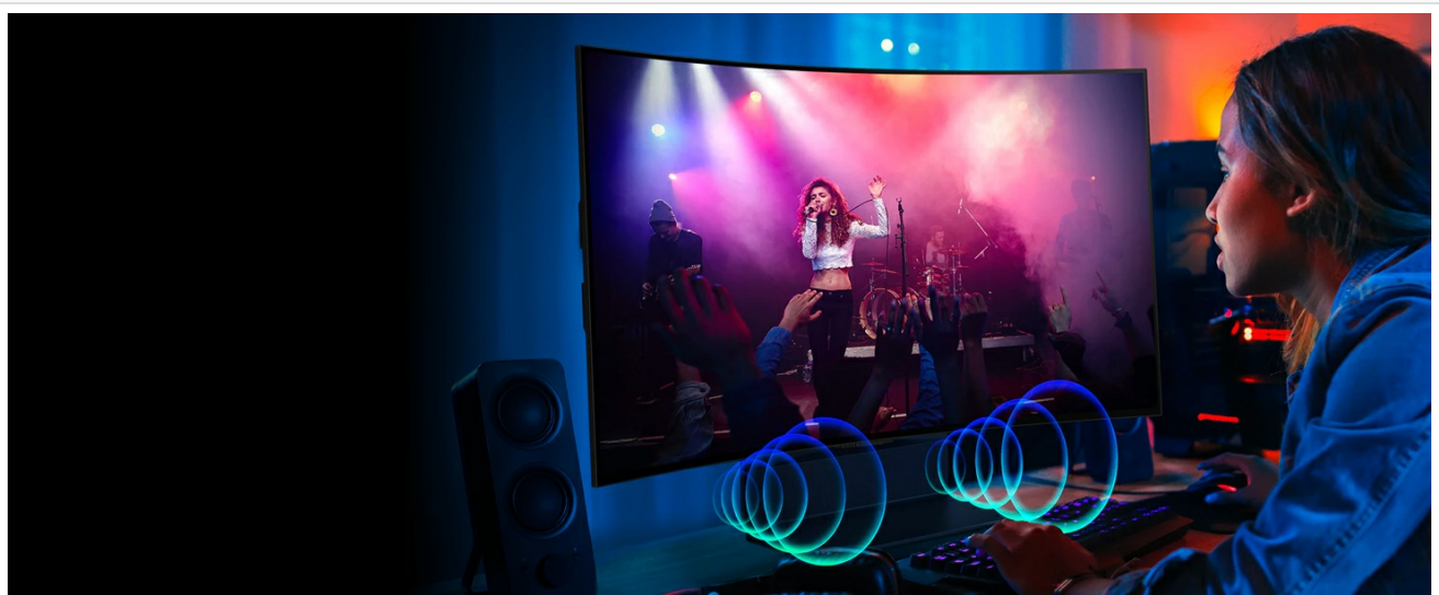
Figure 4.5: Adjustable screen sizes for various gaming needs.