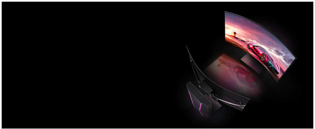
Figure 4.6: Immersive audio experience with the LG OLED Flex.