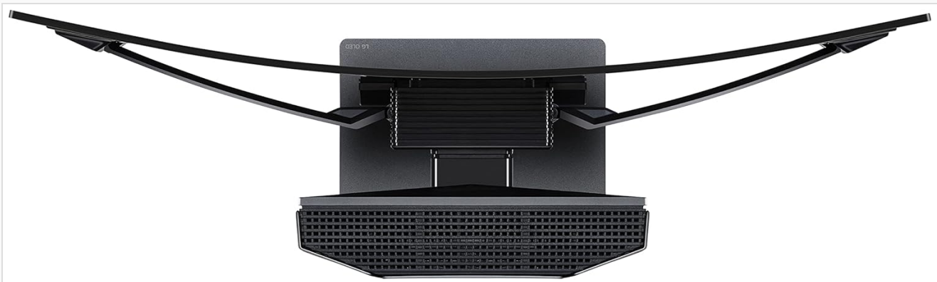
Figure 4.7: Customizable ambient lighting on the rear of the stand.

The rear of the stand features customizable ambient lighting to enhance your viewing environment.