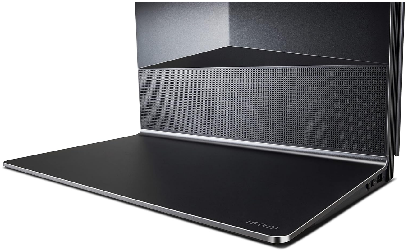
Figure 3.5: Rear LAN, antenna, and optical audio ports.

After connecting all desired devices, plug the power cable into the TV and then into a wall outlet.