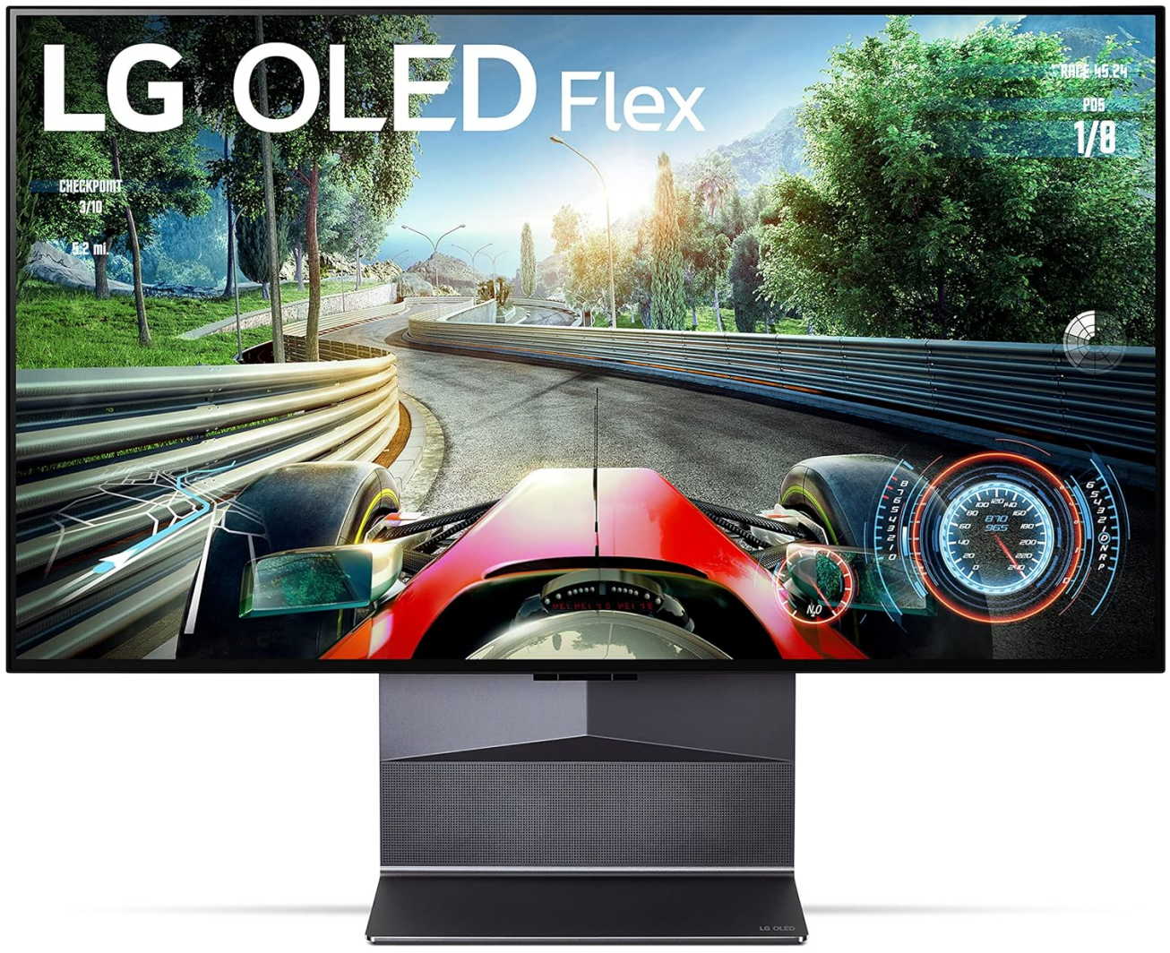
Figure 3.1: LG OLED Flex Smart TV in its flat screen configuration, ideal for general viewing or productivity.