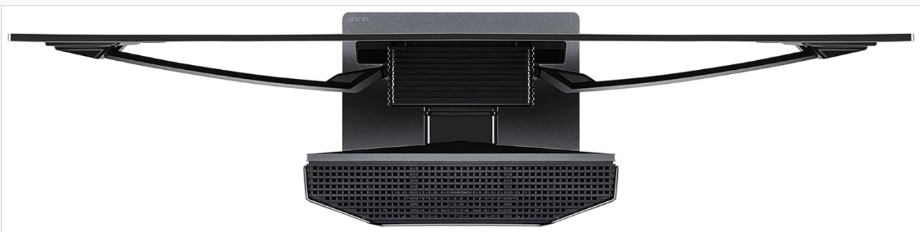
Figure 4.2: Top view of the screen in its curved position.