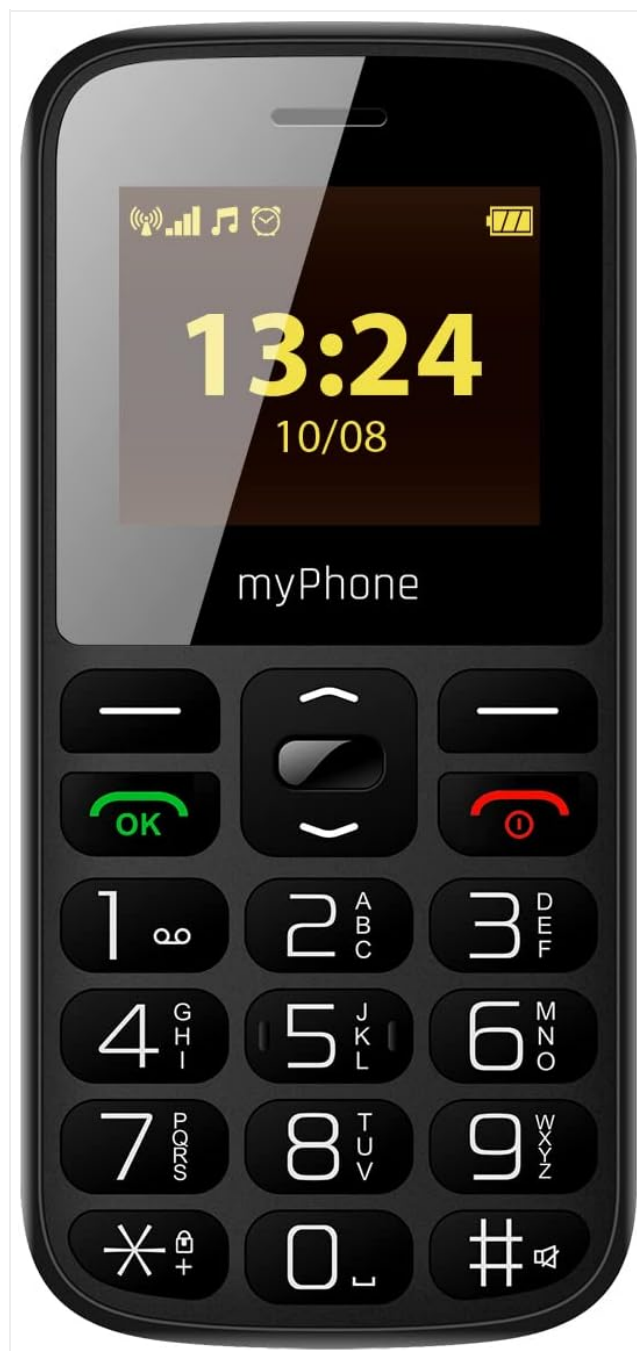
Image: A clear front view of the myPhone Halo A+, emphasizing its large, easy-to-read keypad and display.