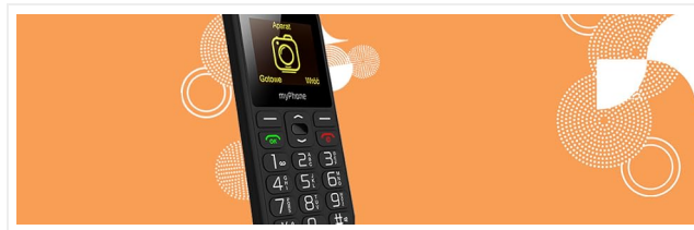
Image: The myPhone Halo A+ display showing the camera application icon, indicating its multimedia capabilities.