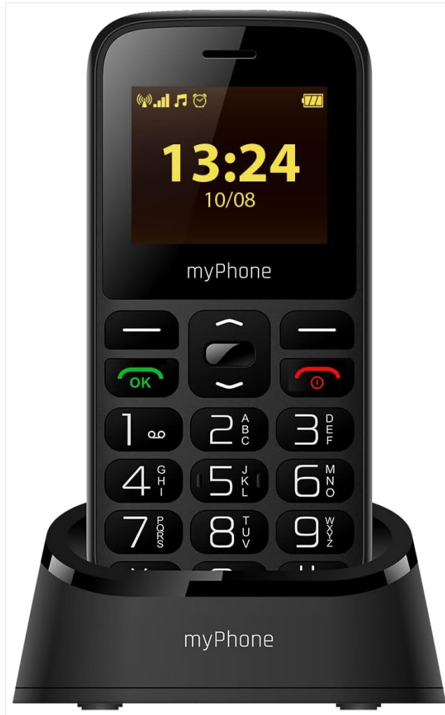
Image: The myPhone Halo A+ securely placed in its dedicated charging station, showing the clear display and large keypad.