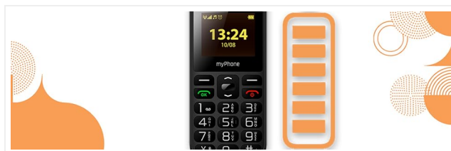
Image: The myPhone Halo A+ display indicating a full battery charge, emphasizing the importance of battery maintenance.