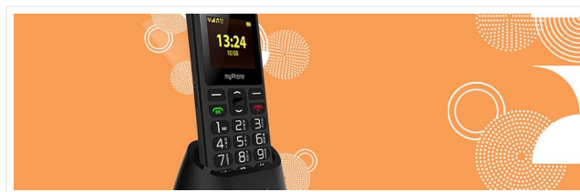
Image: An angled view of the myPhone Halo A+ in its charging dock, highlighting the convenience of the charging solution.