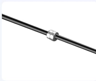
Strong Magnetic Connection