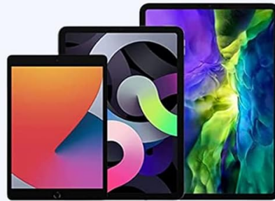
Compatible with iPad, iPad Air, iPad Pro 11", iPad (2021) 12.9"

NOTE: Only X14 Foldable Teleprompter is included.