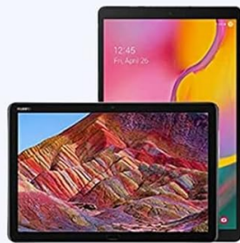
Compatible with Samsung, Huawei