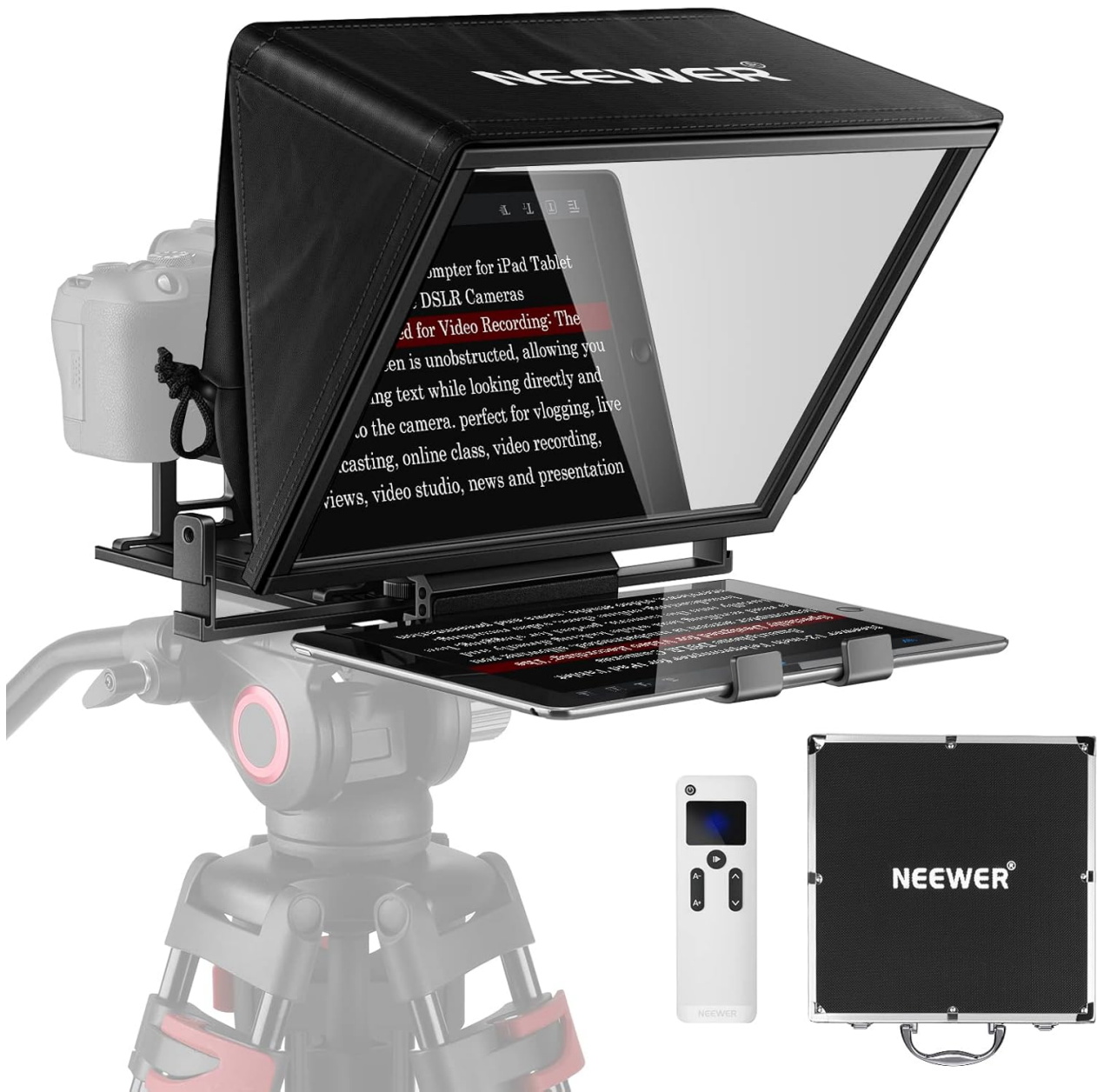
Image: The NEEWER Teleprompter X14 shown with its remote control and a protective carrying case. The teleprompter is mounted on a tripod with a camera attached, and a tablet displaying text is positioned below the beam splitter glass.