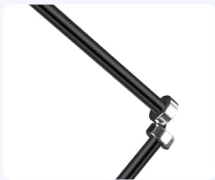
Reinforced Metal Rods