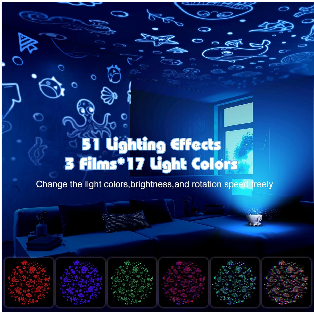
Image: The DOFLER Night Light Projector displaying its interchangeable projection films and remote control. This image illustrates the various components and the overall design of the product.