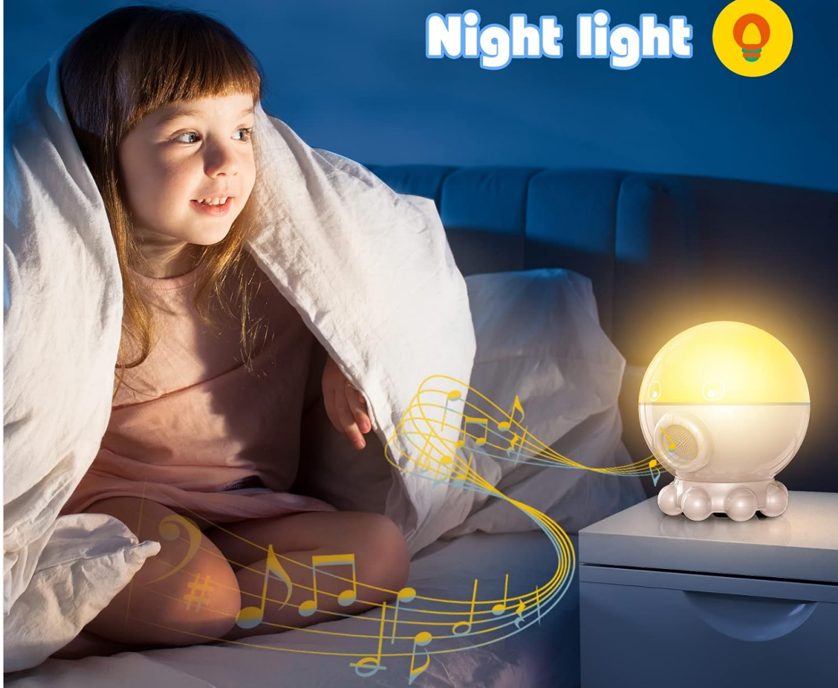
Image: The DOFLER Night Light Projector functioning as a night light and playing lullabies, creating a calming atmosphere for a child.