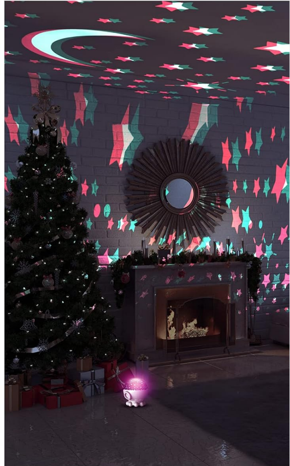
Stars and Moon

Image: Examples of the three available projection themes: Sea World, Dinosaur World, and Stars and Moon, as projected onto a room's ceiling and walls.