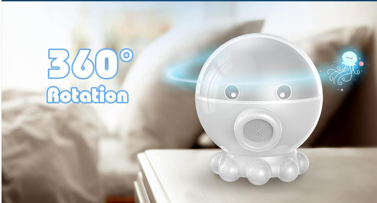
Image: The projector highlighting its 360-degree rotation capability and the auto shut-off timer options (1, 2, 4 hours).