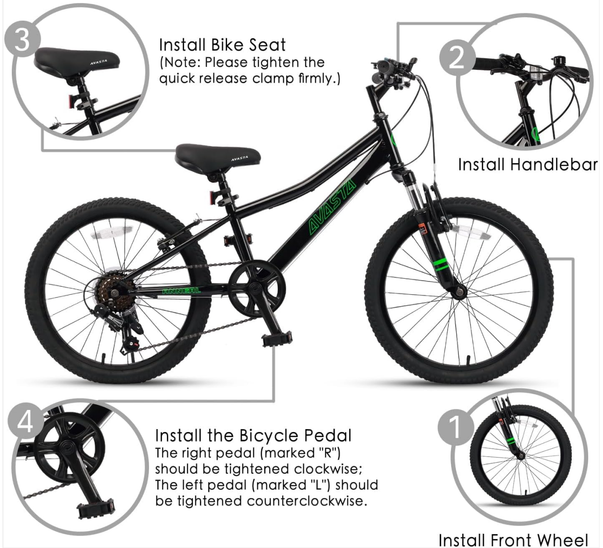
Image: Simple assembly steps for the AVASTA Govet 20" Kids Mountain Bike, illustrating the installation of the front wheel, handlebar, and pedals.