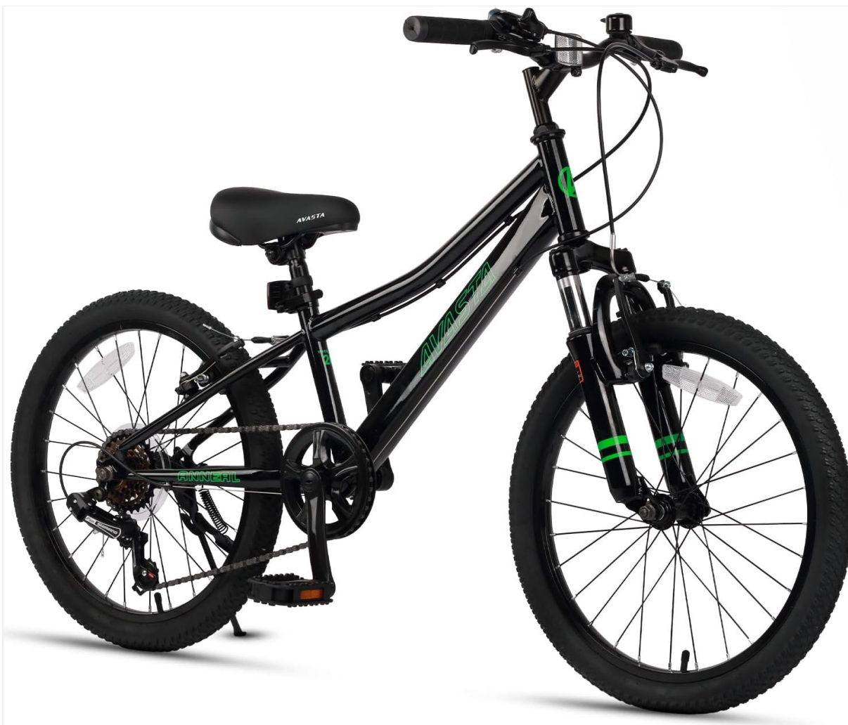
Image: The AVASTA Govet 20-inch Kids Mountain Bike, showcasing its design and features.

This manual provides essential information for the safe assembly, operation, and maintenance of your AVASTA Govet 20" Kids Mountain Bike. Please read it thoroughly before use and retain it for future reference.