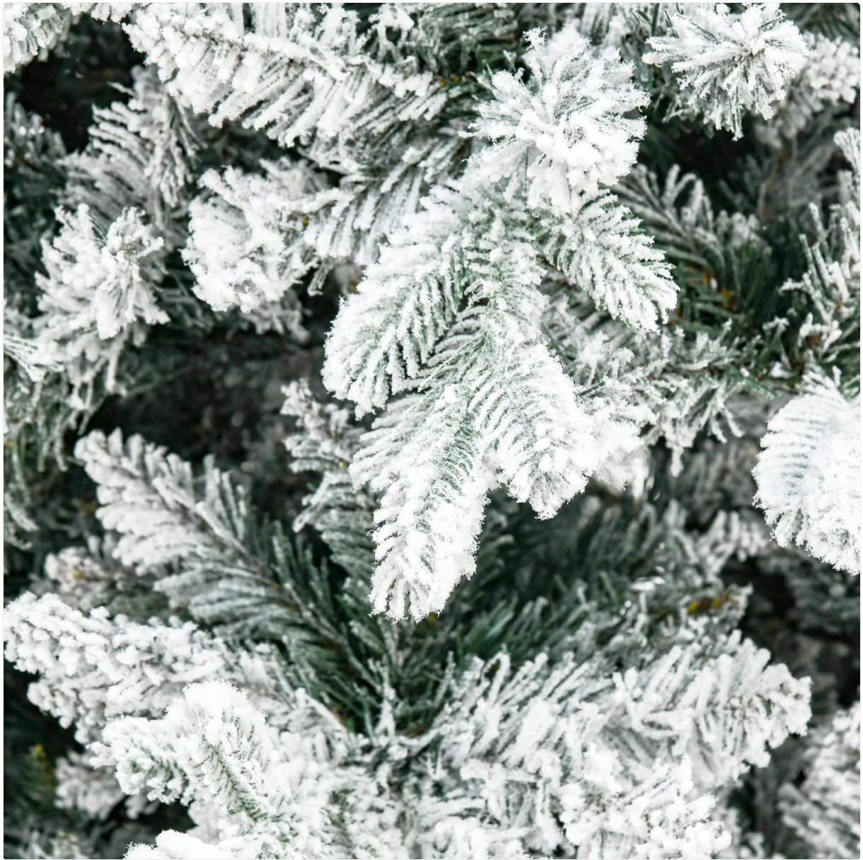
An intricate close-up of the snow-flocked texture on the individual branches, providing a realistic winter aesthetic.