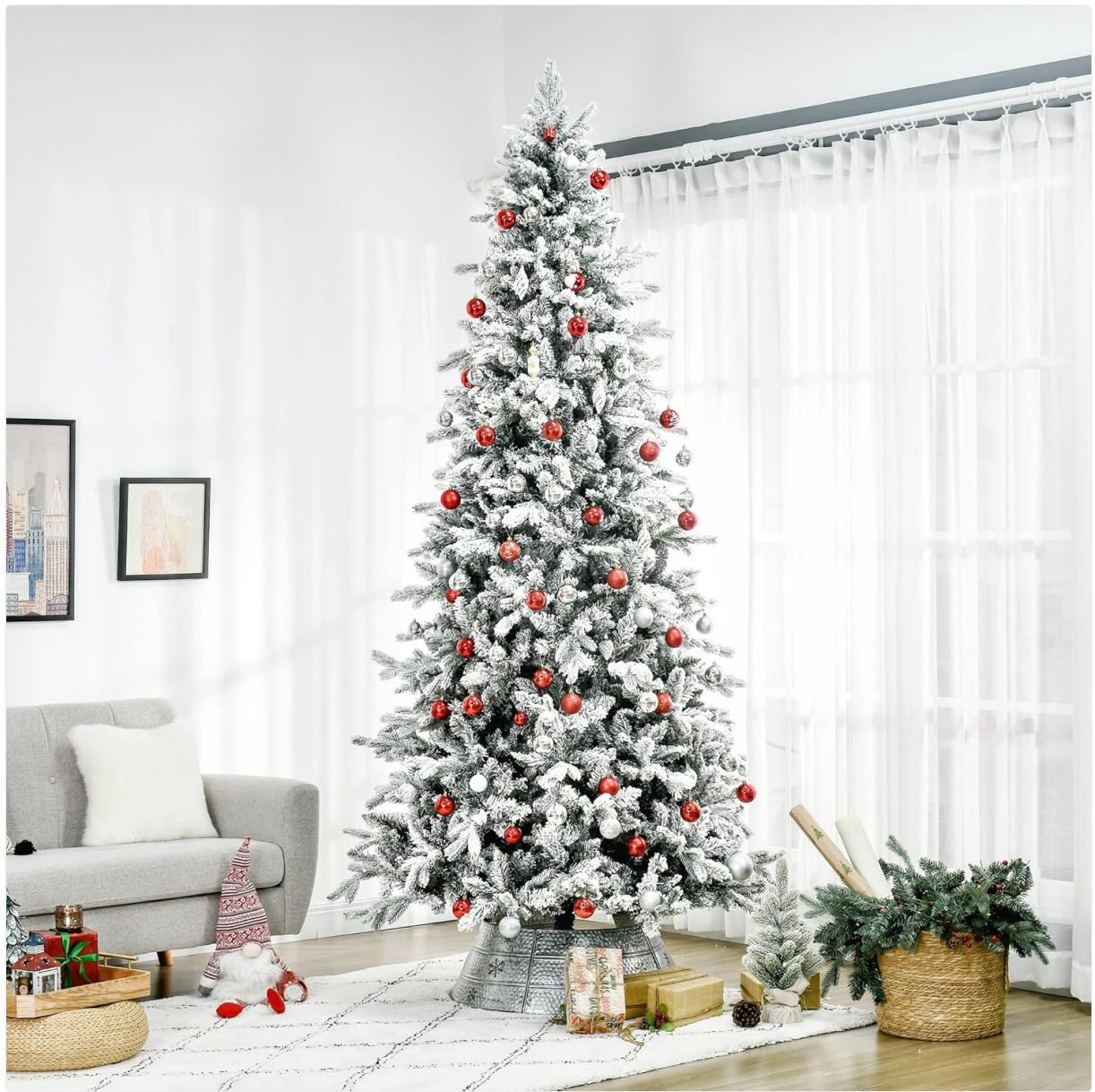
A fully decorated HOMCOM 9 Foot Snow Flocked Artificial Christmas Tree, showcasing its elegant appearance in a home setting.