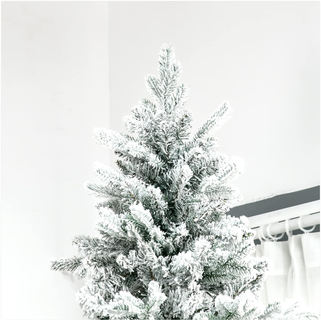
A detailed view of the top section of the tree, showing the dense, flocked foliage.