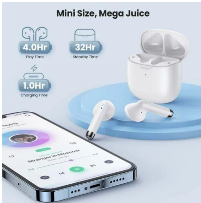
Image: The earbuds and charging case next to a smartphone displaying music. Text overlays indicate 4.0 hours play time, 32 hours standby time, and 1.0 hour charging time.