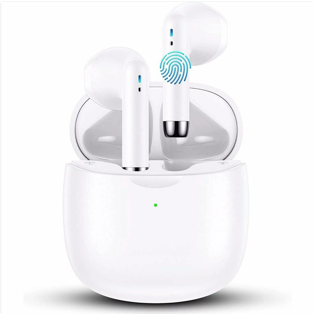
Image: The SGNICS TWS Wireless Bluetooth 5.0 Earbuds, consisting of two earbuds and their charging case.