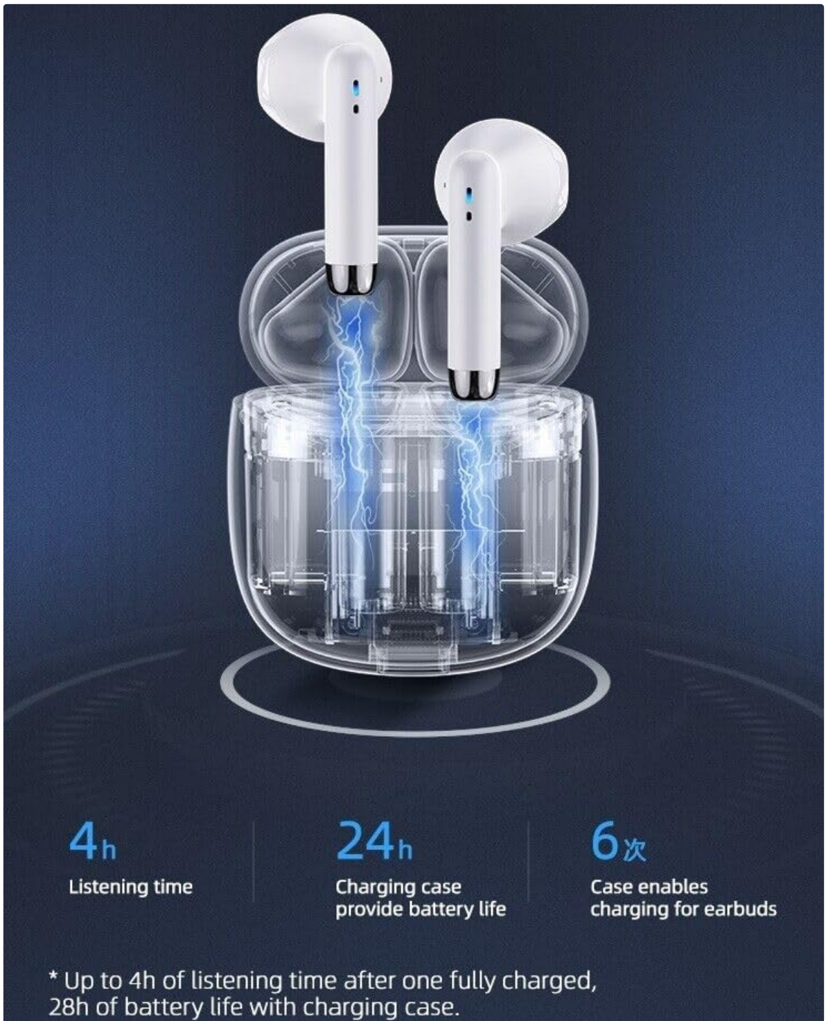
Image: The earbuds placed inside the charging case, illustrating the charging process and indicating 4 hours listening time, 24 hours additional battery from the case, and 6 charges provided by the case.