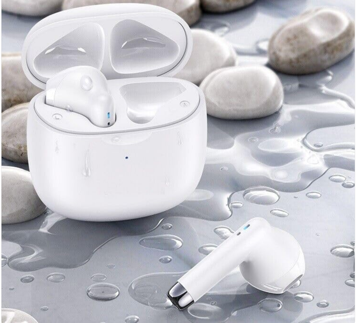
Image: The earbuds and charging case shown with water droplets, illustrating their sweat-proof and water-resistant design, suitable for sports use.

— Sweat and water resistance, suitable for sports use