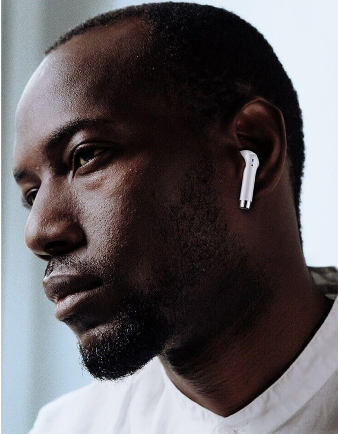
Image: A person wearing one of the SGNICS TWS Wireless Bluetooth 5.0 Earbuds, demonstrating proper ear placement.

13mm high resolution speaker, support stereo dual channel, enjoy lossless sound