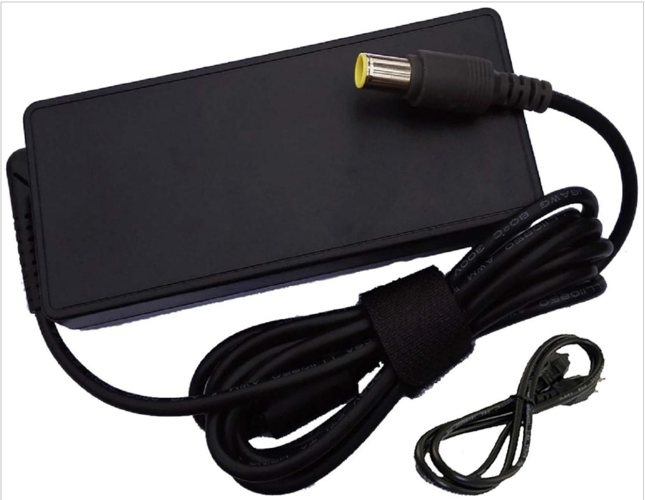
Image 4.1: The UpBright AC/DC Adapter features a barrel connector for connecting to the power station.