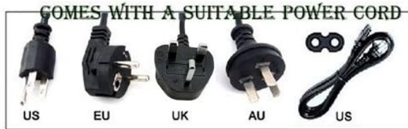
Image 3.1: The package includes the AC/DC adapter and an AC power cord appropriate for the region of purchase. A warranty certificate is also provided.