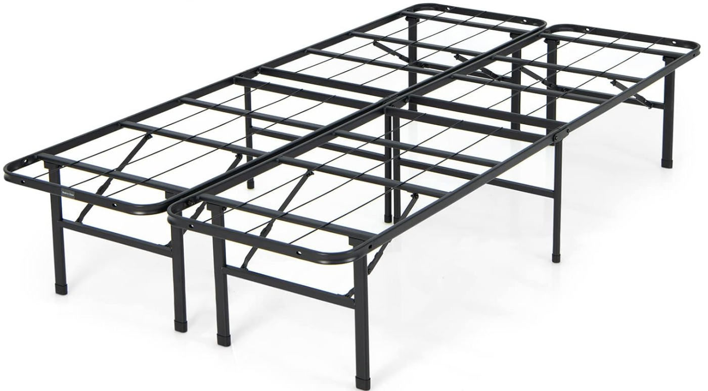
Image 1.1: The GOFLAME Folding Metal Platform Bed Frame shown in its fully assembled, unfolded state, ready to support a mattress. This image highlights the robust steel construction and ample under-bed clearance.