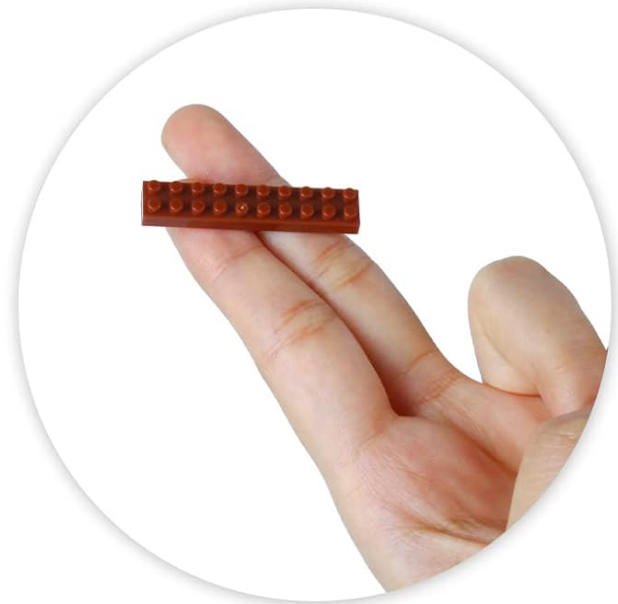
Image: A size reference showing the small scale of the micro building blocks compared to common coins and a human finger, highlighting the need for precision.