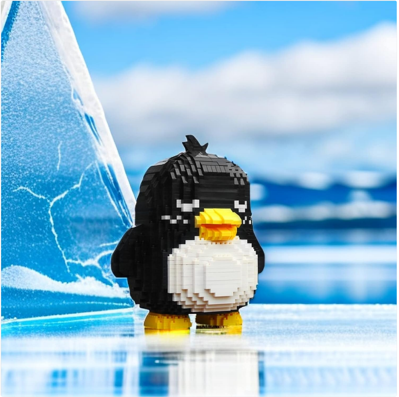
Image: The completed Larcele Penguin model displayed in a simulated icy environment, highlighting its aesthetic appeal.

Upon completion, your Larcele Micro Building Blocks Penguin will be a sturdy and decorative piece.