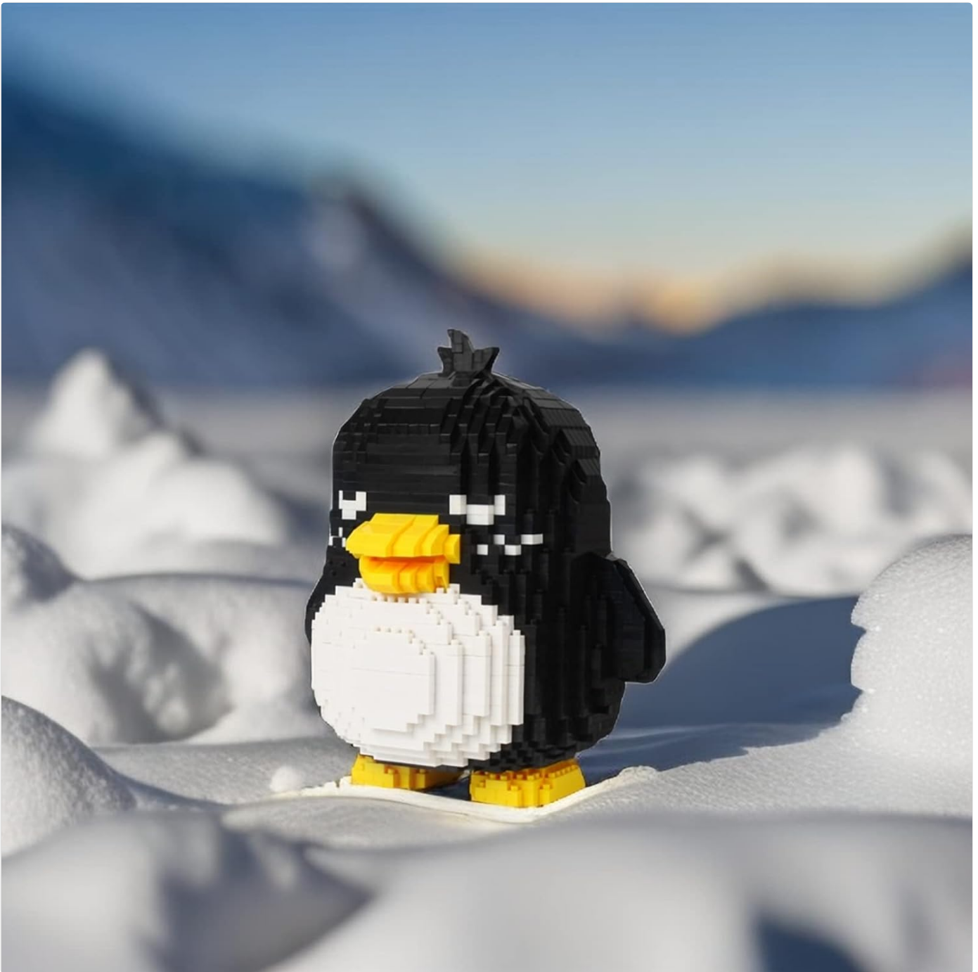
Image: The completed Larcele Penguin model displayed in a simulated snowy environment, showcasing its suitability as a decorative item.