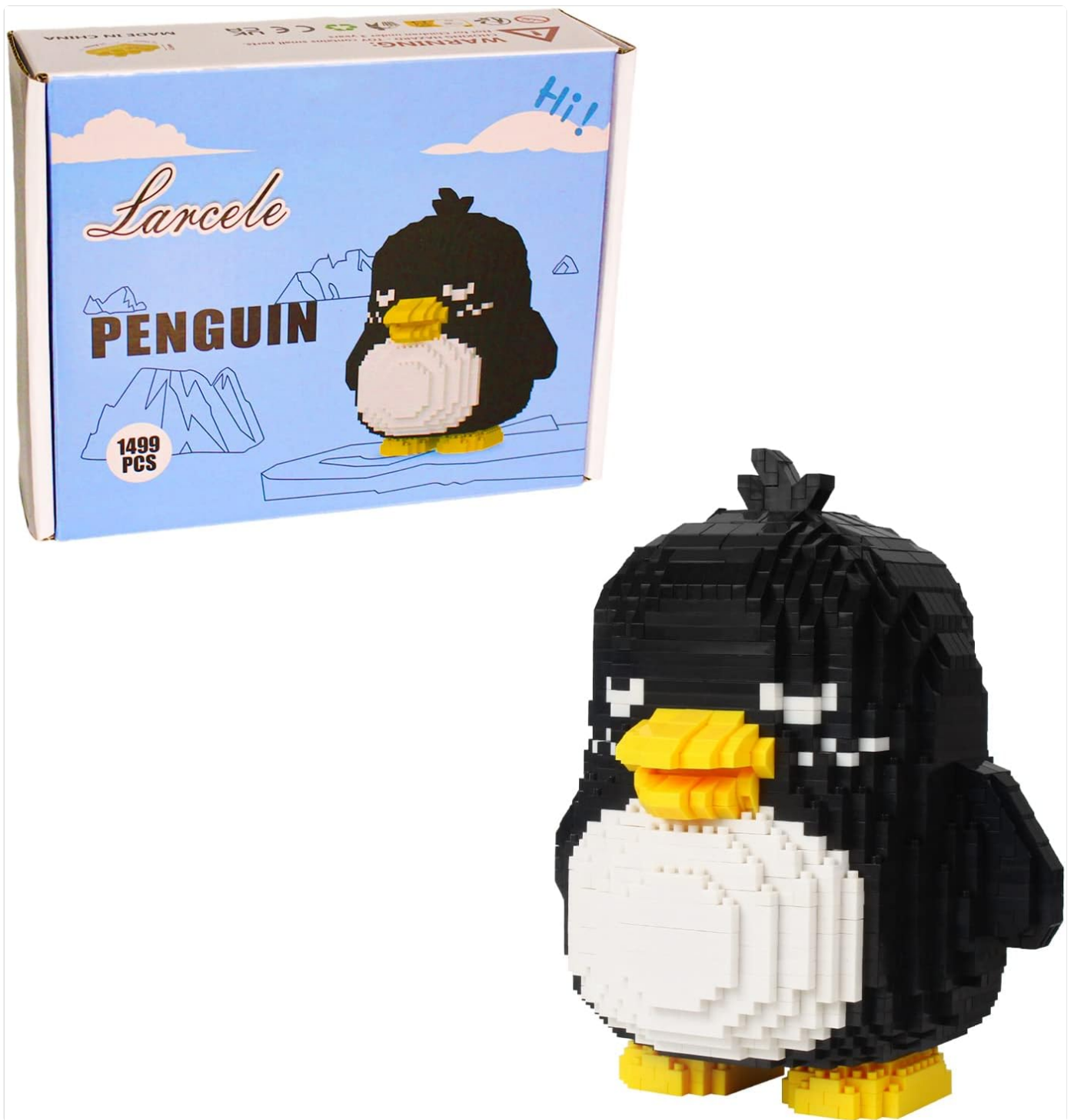
Image: The product box for the Larcele Penguin Micro Building Blocks and the fully assembled penguin model.