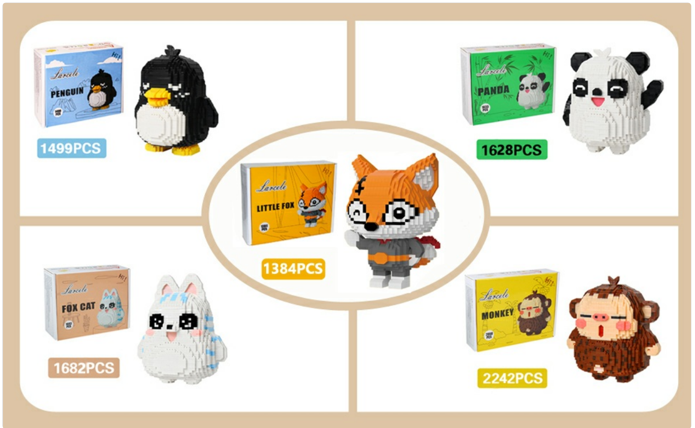
Image: Example of Larcele Micro Building Blocks packaging and how pieces might be sorted for assembly.