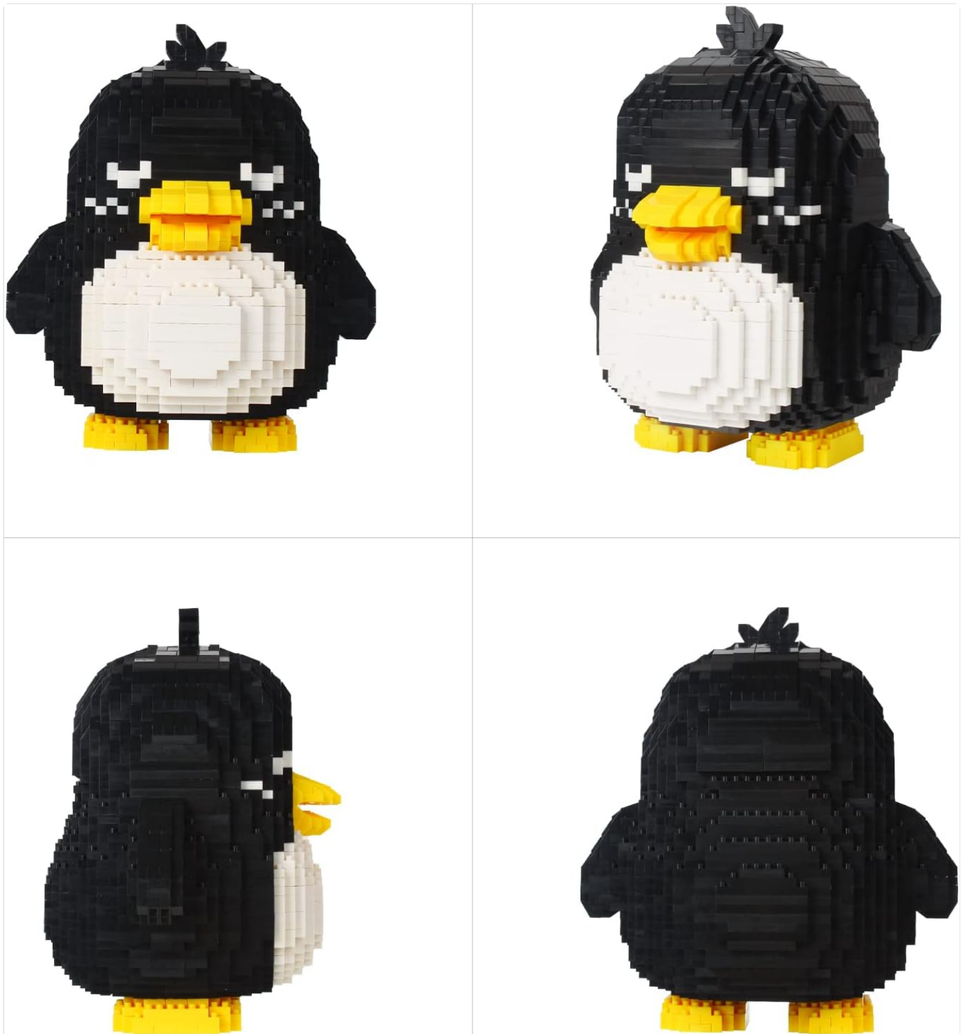
Image: Various angles of the completed Larcele Penguin model, showcasing its 3D design and details.