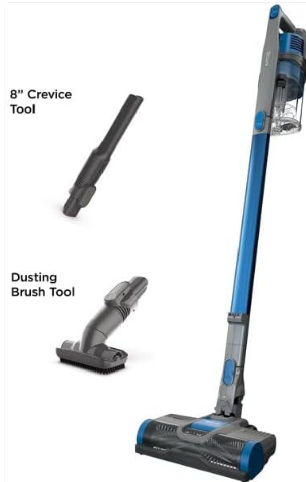
The 8-inch Crevice Tool, ideal for reaching tight spaces and corners.