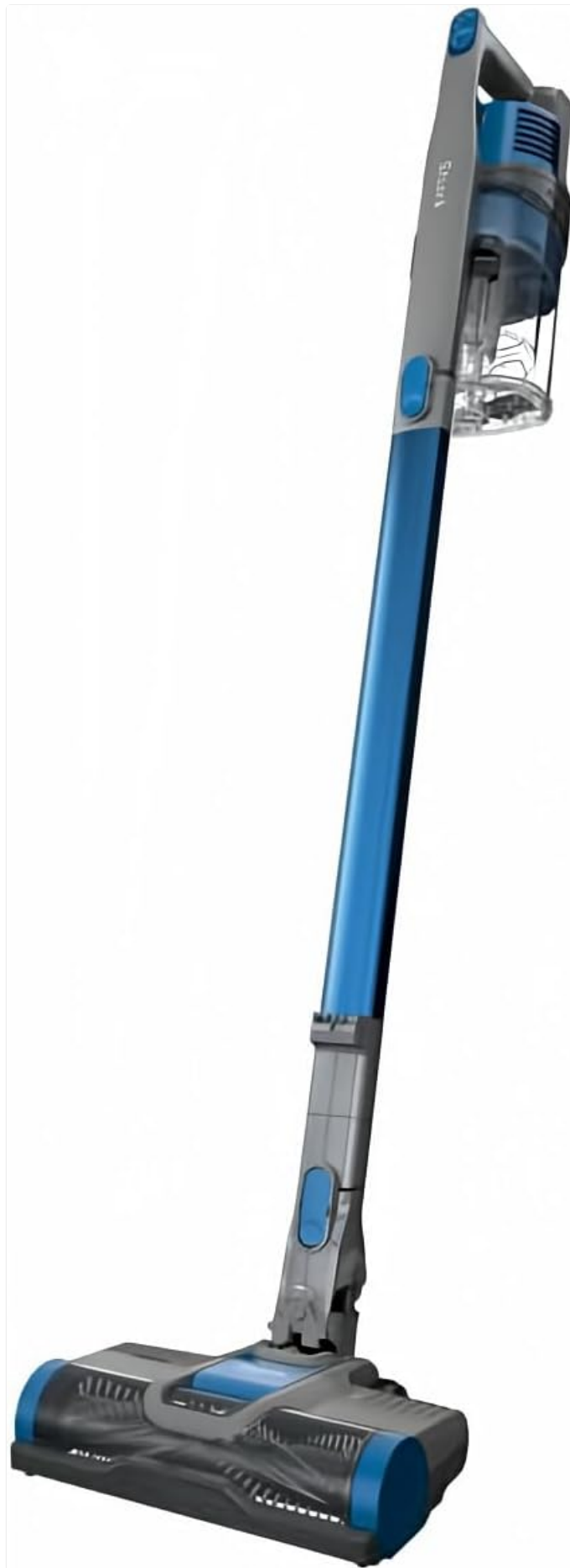
The Shark IX140H Lightweight Cordless Pet Stick Vacuum in blue.