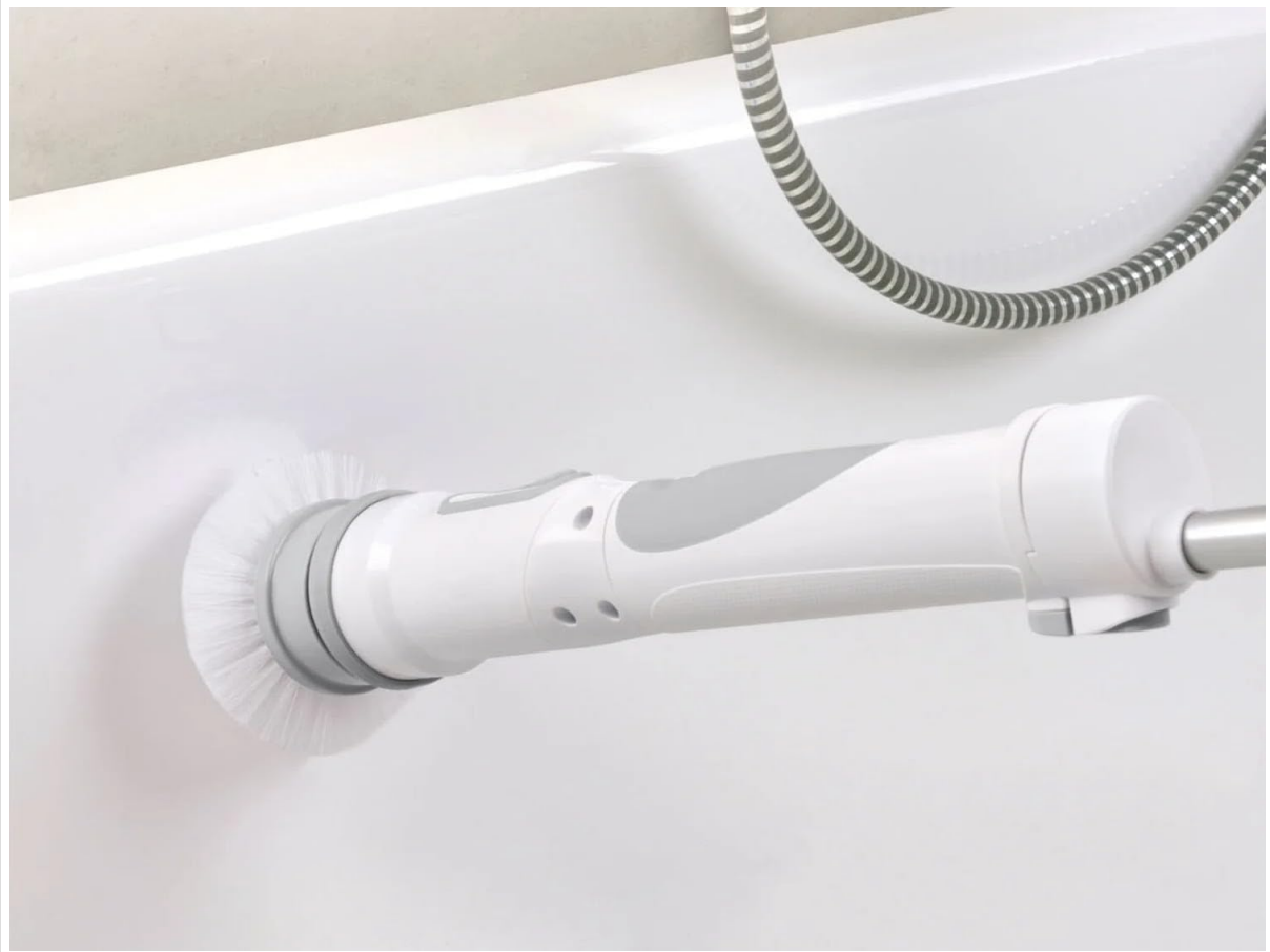
Image 4: A user demonstrating the cleaning brush in action, effectively cleaning the edge of a bathtub. The main unit can be adjusted to a 45-degree angle for ergonomic use.