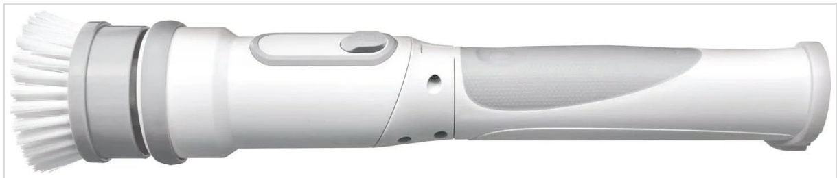
Image 3: The main cleaning unit with a brush head securely attached, demonstrating its compact form for handheld use.