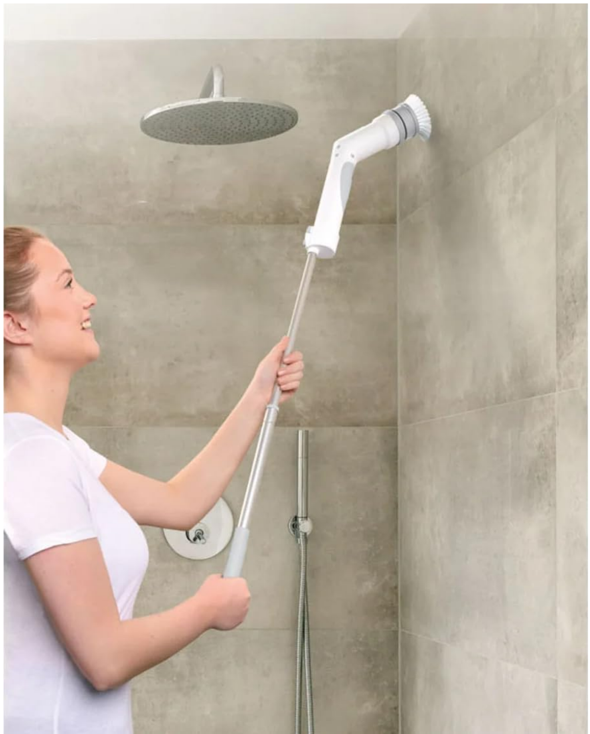
Image 5: A user cleaning a shower wall using the Silvercrest cordless cleaning brush with the telescopic handle extended, demonstrating its utility for higher surfaces.