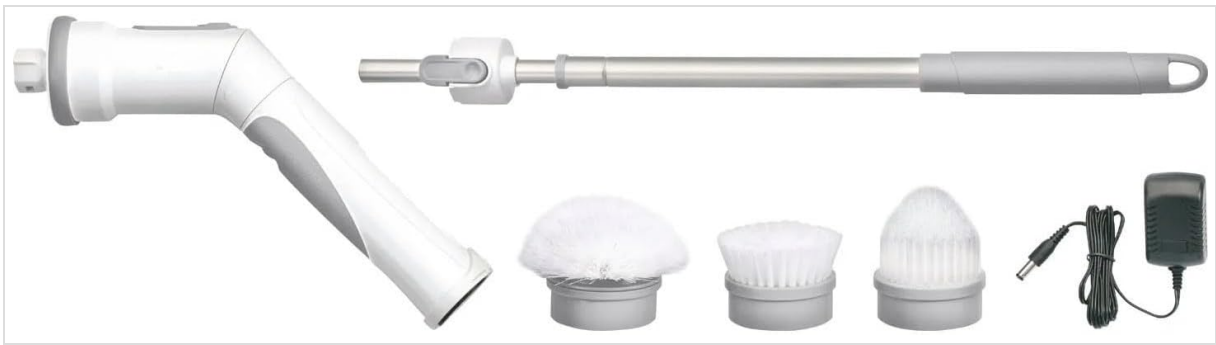
Image 1: Overview of the Silvercrest SRBX 2200 B2 Cordless Cleaning Brush and its included accessories. This image displays the main cleaning unit, the adjustable telescopic handle, three distinct brush heads (flat, round, and conical), and the power adapter for charging.