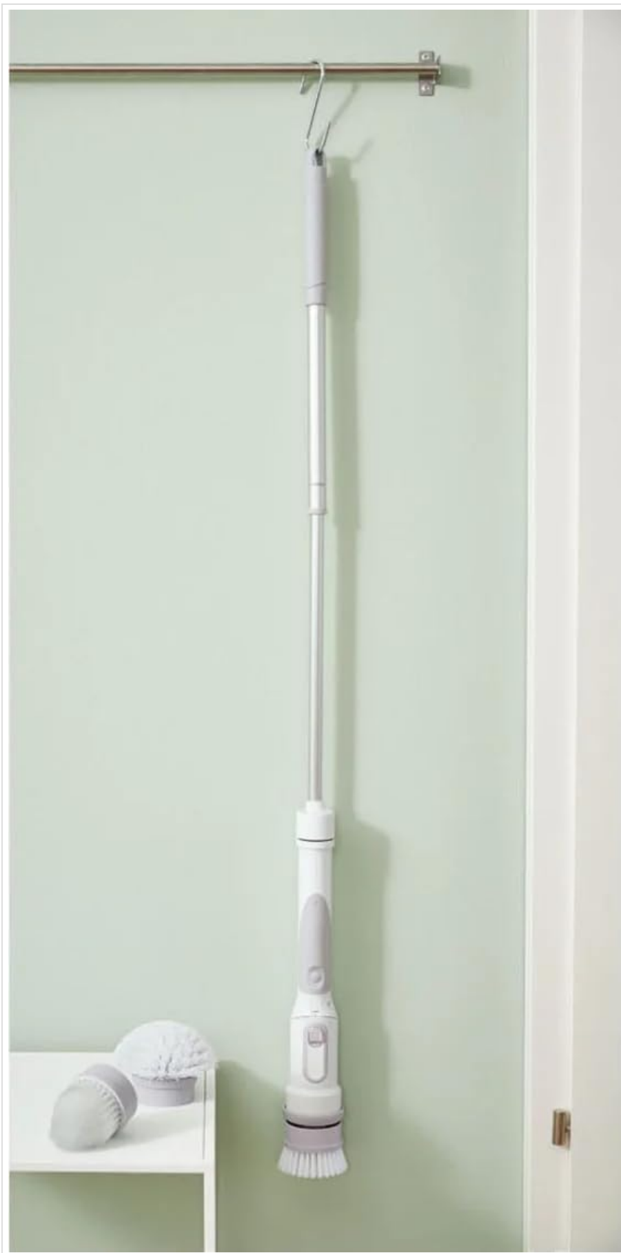
Image 6: The Silvercrest cordless cleaning brush, with its telescopic handle, shown hanging on a wall hook, illustrating a practical storage solution.