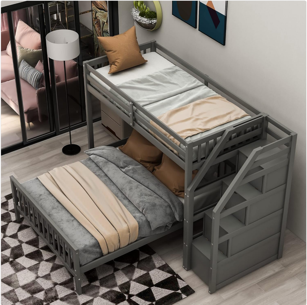
Image: Top-down view demonstrating the movable lower full bed, creating versatile space.