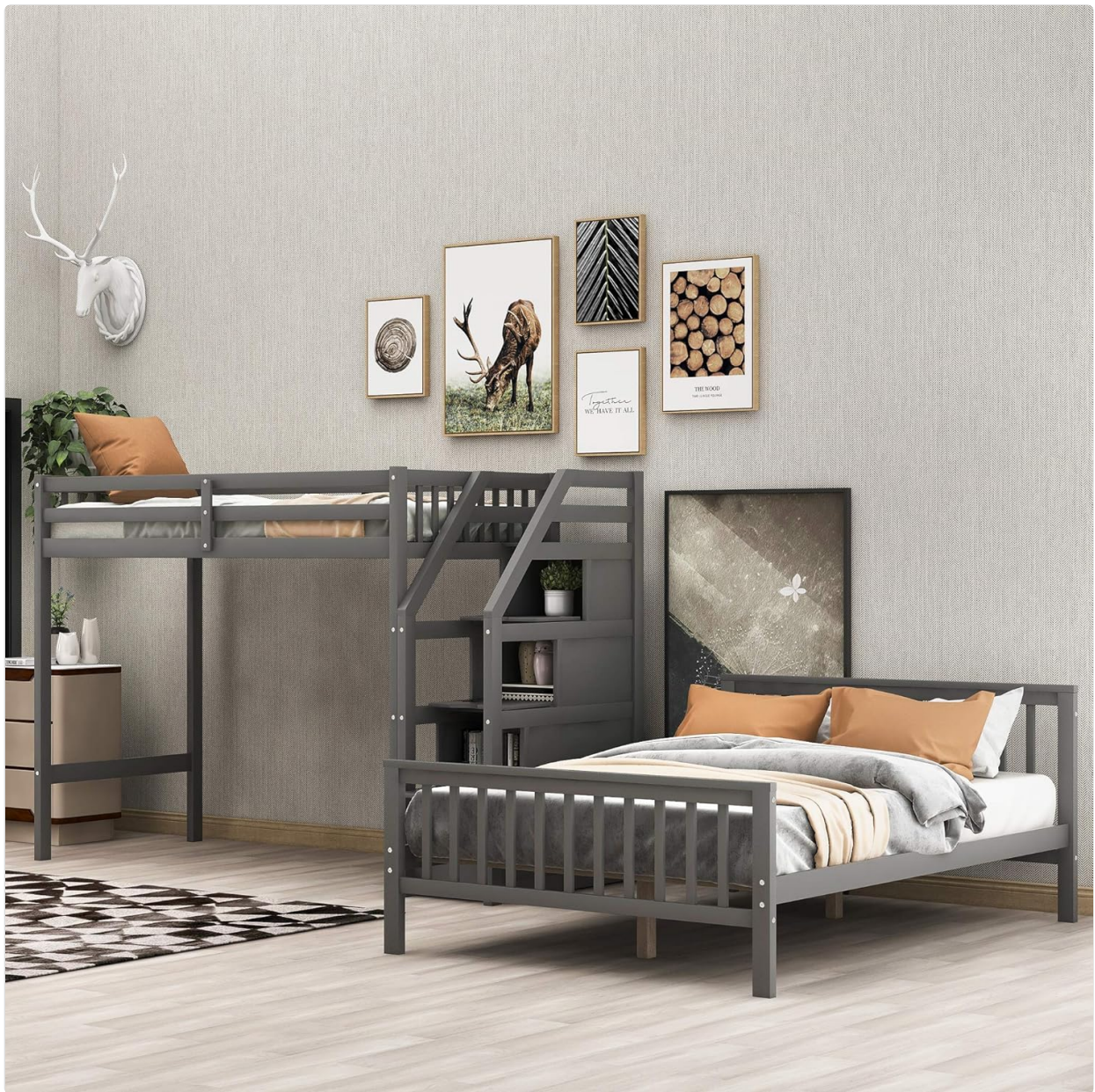
Image: The bunk bed configured with the upper twin bed and lower full bed separated for flexible room arrangement.