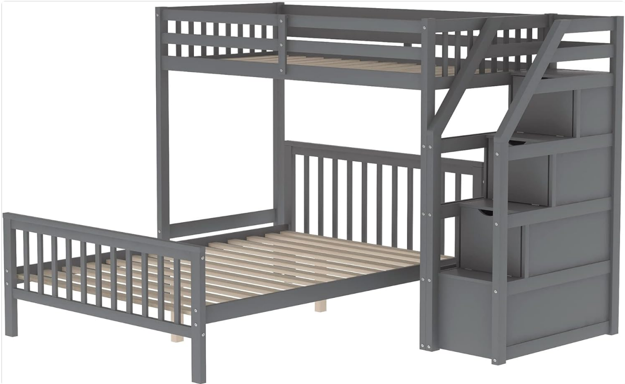
Image: Side view illustrating the integrated three-step storage staircase.