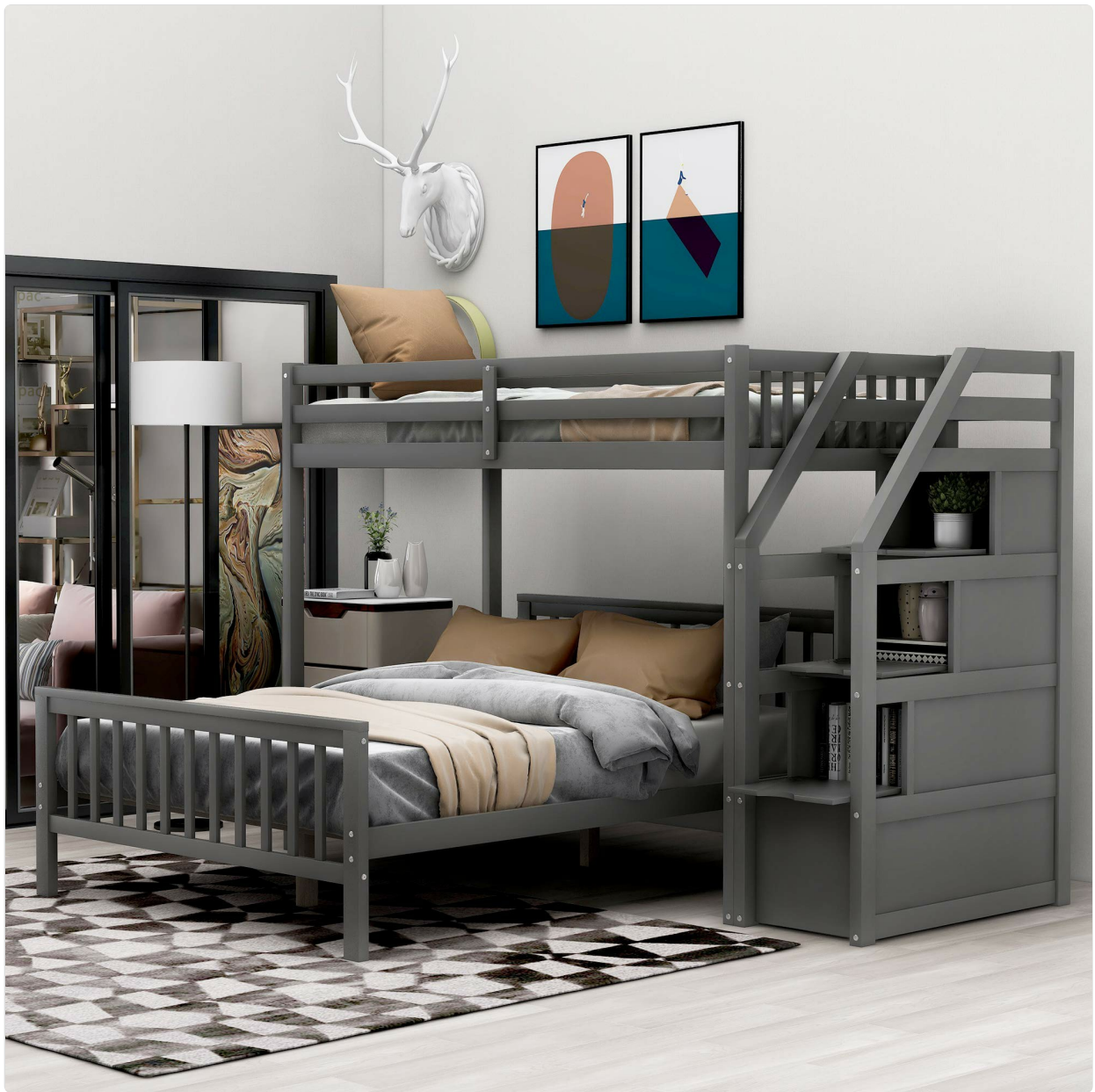
Image: Overall view of the Fliexs Twin Over Full Bunk Bed with Three Storage Staircase in Grey.