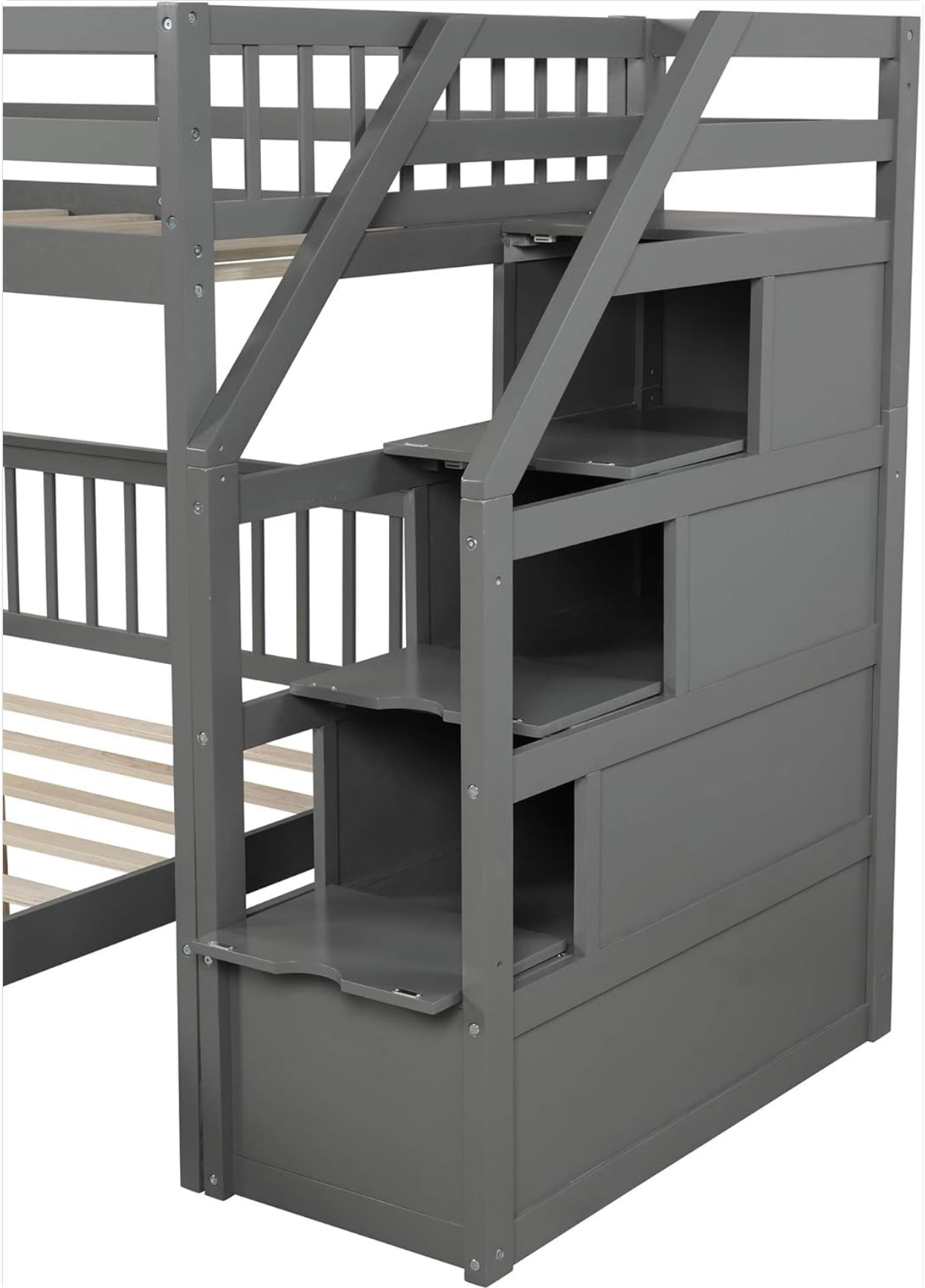
Image: Detailed view of the storage compartments integrated into the staircase steps.