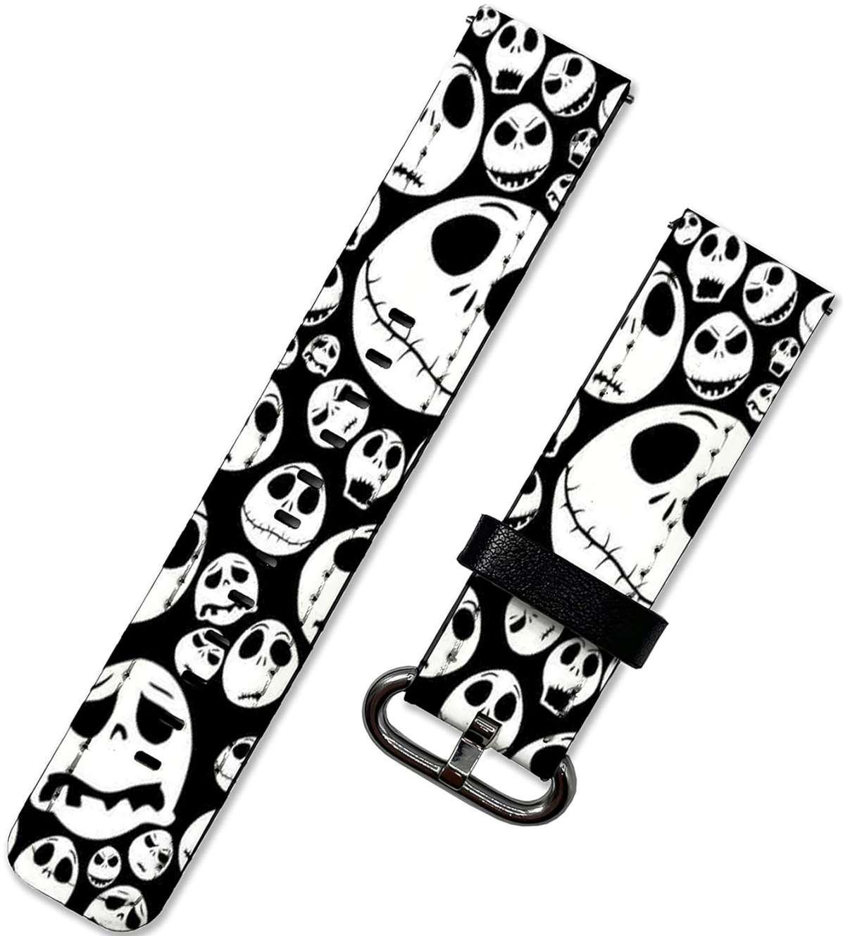
Image: The Skeleton Halloween Nightmare design smartwatch band.