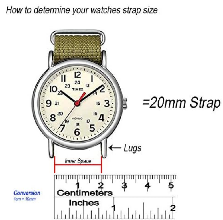
Image: A watch face with a ruler measuring the inner space between the lugs, indicating a 20mm strap size.