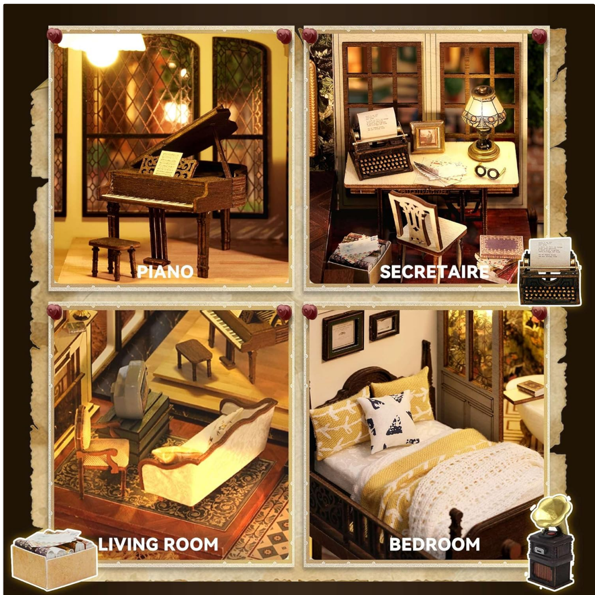
Image 4.2: Detailed views of various rooms and furniture within the assembled dollhouse.