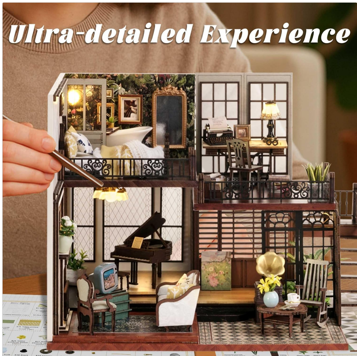
Image 4.1: Illustrates the precision required for assembling the miniature details.

The assembly process is estimated to take approximately 24-32 hours, depending on individual pace and experience. Patience is key to achieving an 'ultra-detailed experience'.