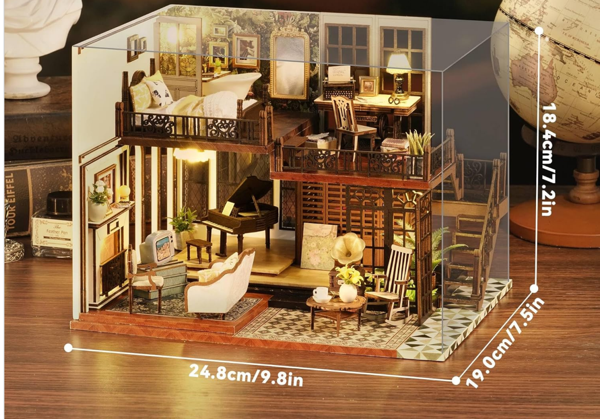
Image 8.1: Product dimensions for the 'Time Impression' miniature dollhouse.