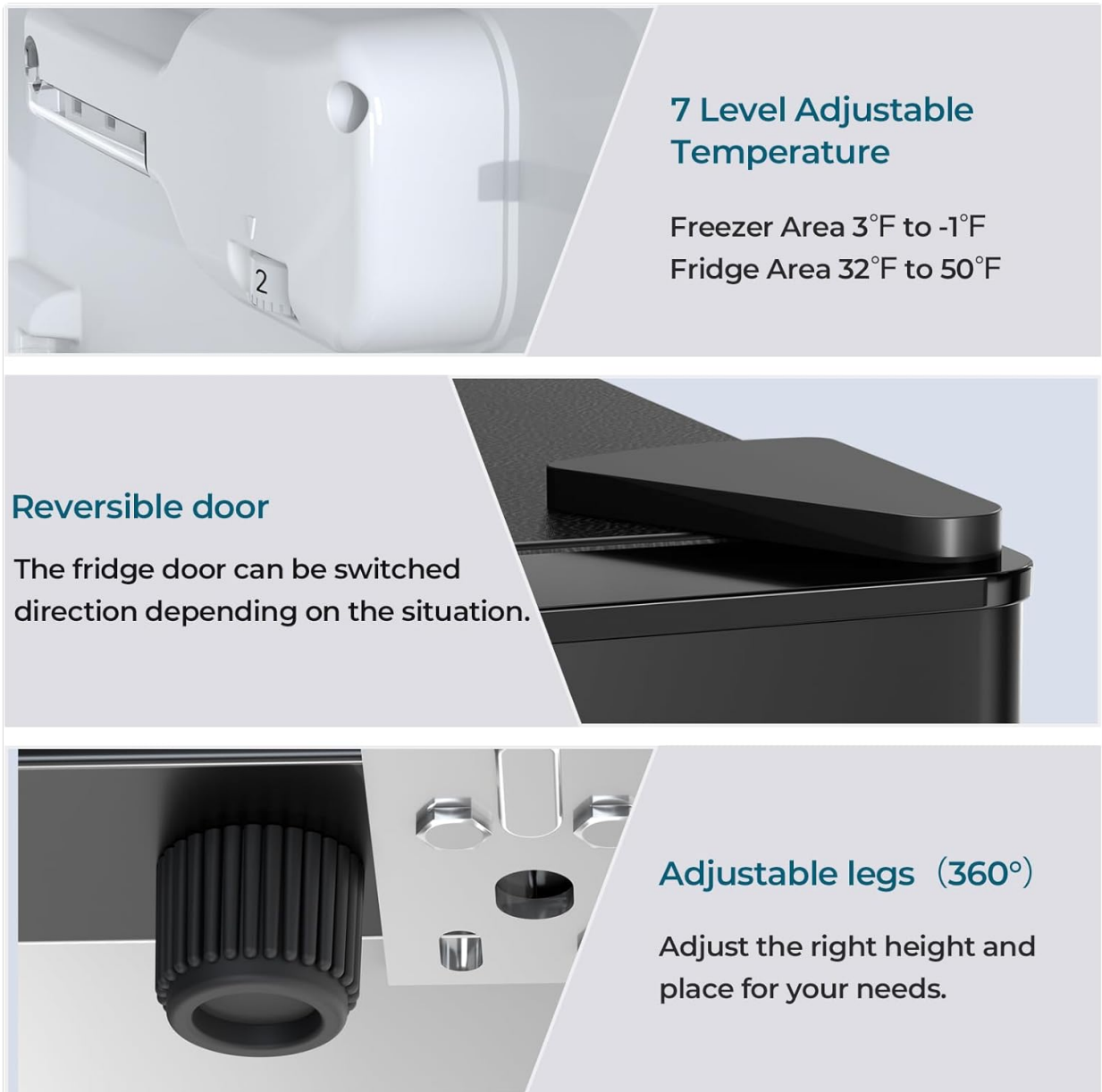
Figure 2: Close-up view of the adjustable leveling legs, allowing for height adjustment and stability.

The mini-fridge is equipped with adjustable leveling legs (360° rotation) to ensure stability and proper alignment. Rotate the legs to adjust the height and level the appliance on uneven surfaces.