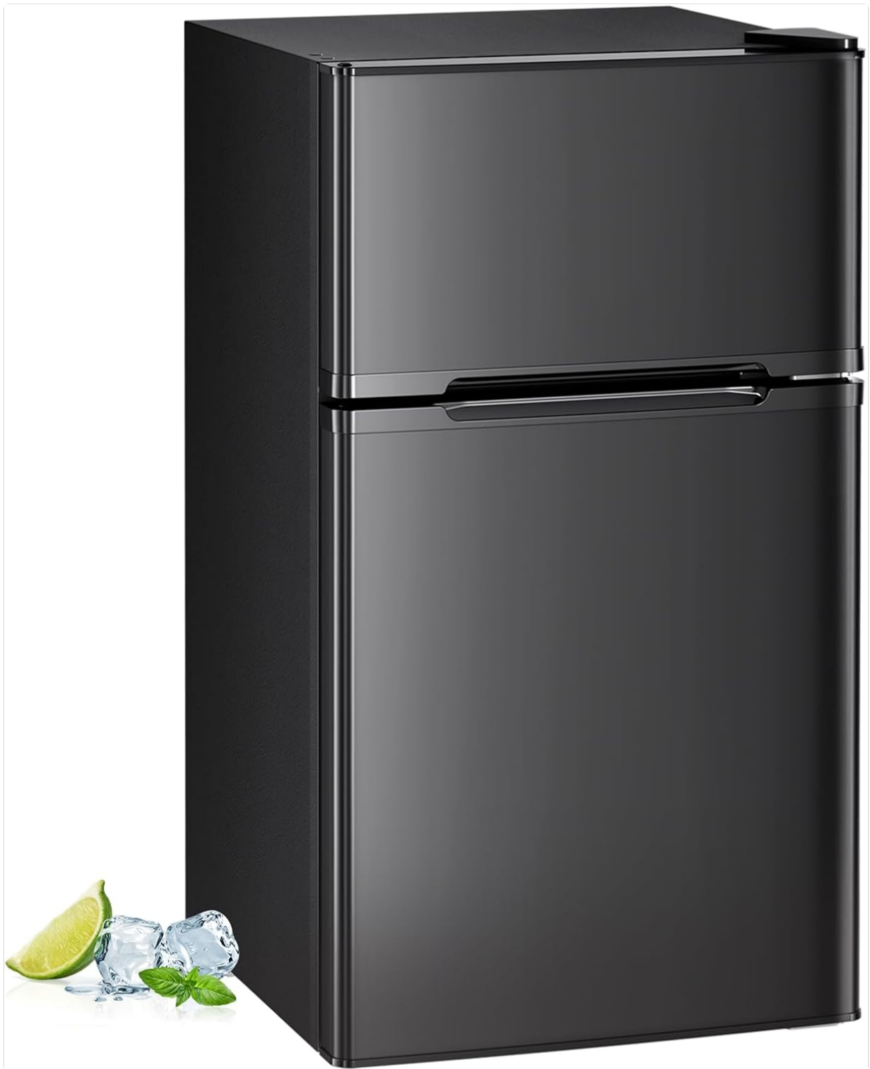
Figure 1: Front view of the Havato 3.2 Cu.Ft Mini Fridge with Freezer in black.