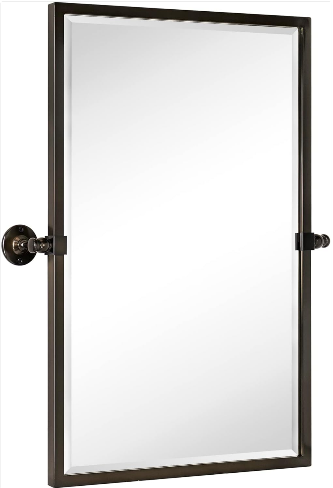
Figure 3.1: Close-up view of the pivot mechanism.