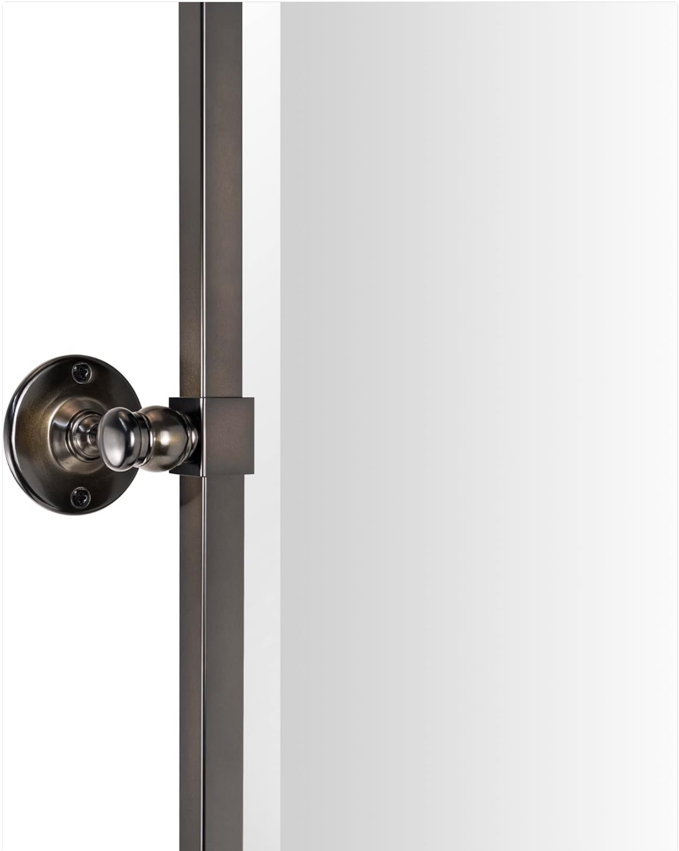
Figure 3.2: Side view illustrating the mirror's tilting capability.

Video 3.1: Official TEHOME video demonstrating the installation process for pivot mirrors. This video provides a step-by-step guide to securely mount your mirror.