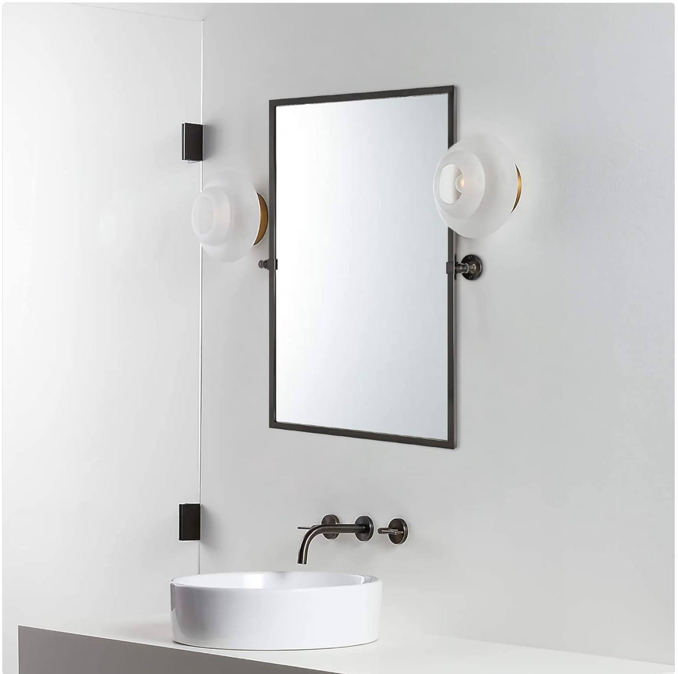
Figure 1.1: TEHOME Pivot Tilting Bathroom Mirror in Oil Rubbed Bronze finish.