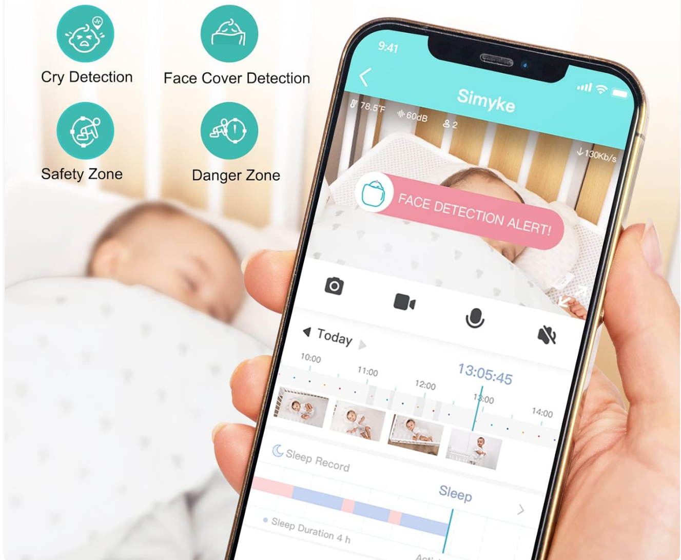
Figure 3: The Simyke app interface displaying smart monitoring features.

During the pairing process, you may be prompted to scan a QR code displayed on your phone with the monitor's camera. Follow the voice prompts from the monitor to confirm successful connection.