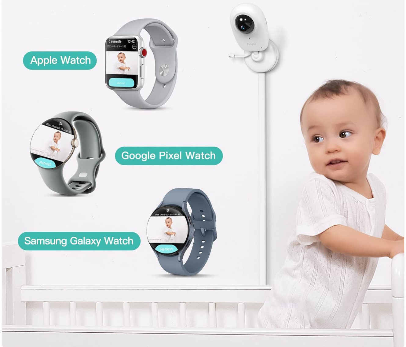
Figure 9: Connecting the monitor to various smartwatches.

Your browser does not support the video tag.