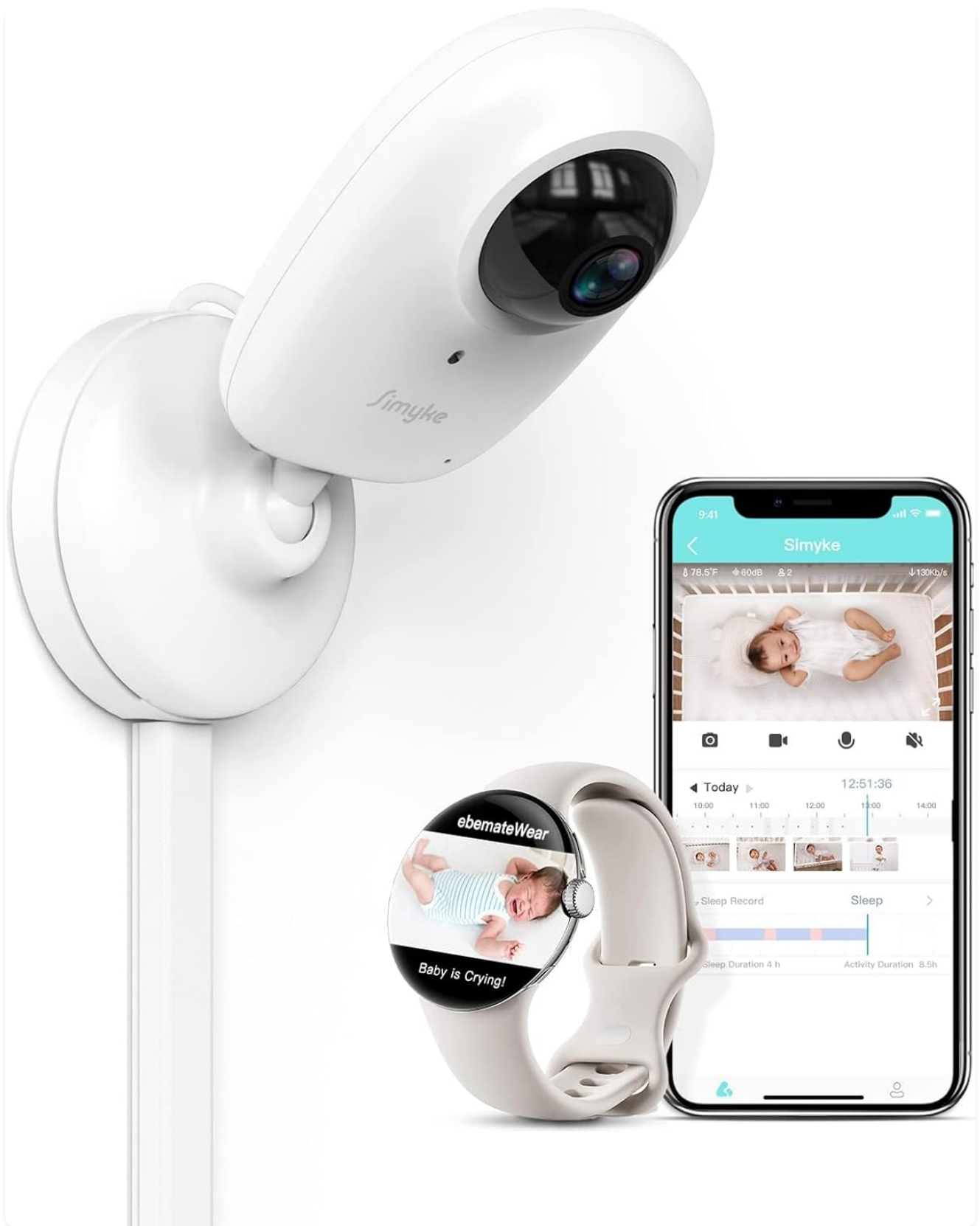
Figure 1: Simyke Smart Baby Monitor and its multi-device connectivity.