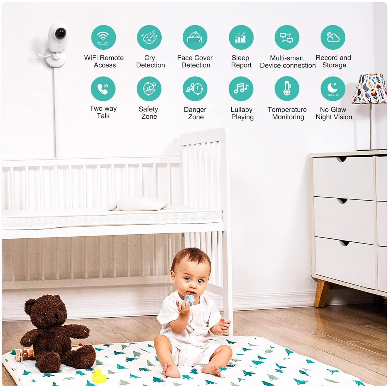
Figure 4: Overview of the monitor's smart features.

Your browser does not support the video tag.