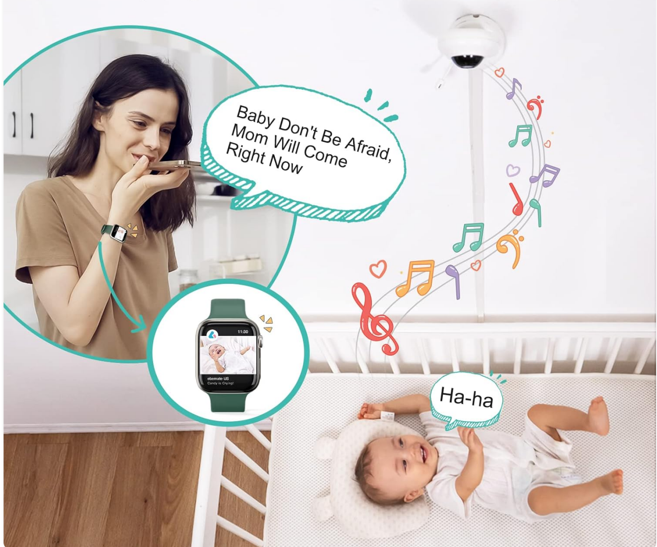
Figure 5: Using two-way talk and lullabies to interact with your baby.

Talk to Your Baby Any Time Any Where,when Your Baby Cries, You Can Play Baby's Favorite Lullabies to Soothe Your Baby.