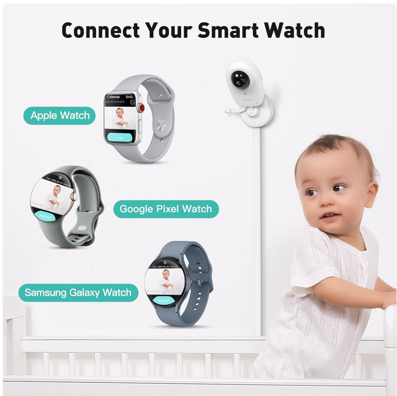
Figure 2: Recommended placement of the baby monitor for optimal viewing.

Position the baby monitor in a location that provides a clear, unobstructed view of your baby. Ensure it is placed securely and out of your baby's reach. The monitor can be placed on a flat surface or mounted to a wall or crib using the provided accessories.