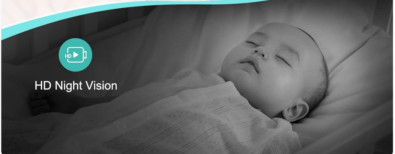
Figure 6: Day and night vision capabilities of the monitor.