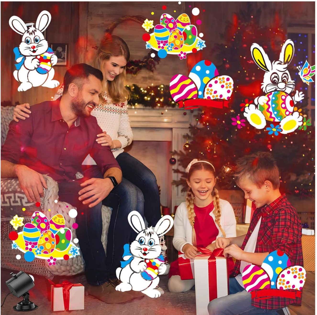
Image: A family enjoying Easter projections indoors, with the projector discreetly placed on the floor, demonstrating versatile placement.