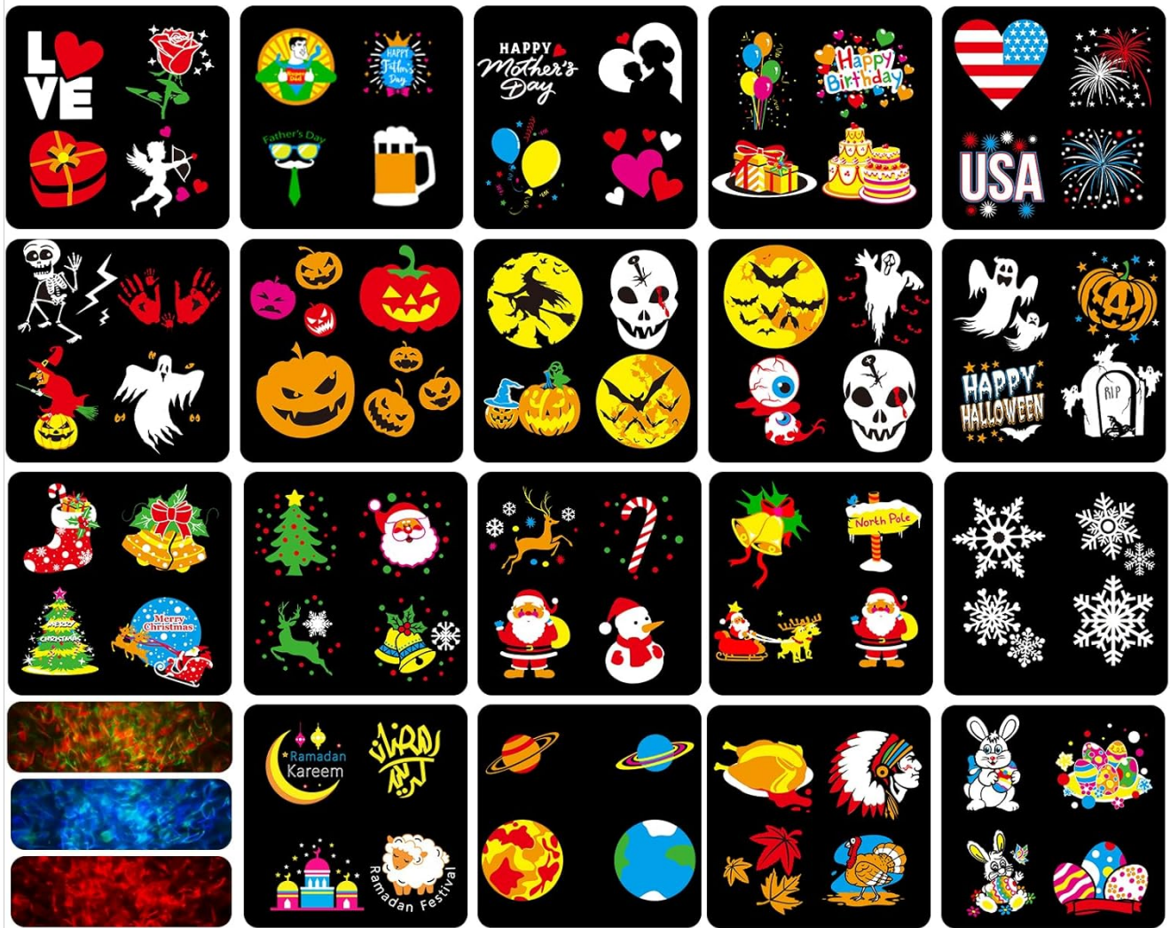
Image: A visual representation of the 19 interchangeable slides included with the projector, showcasing various holiday and seasonal themes.