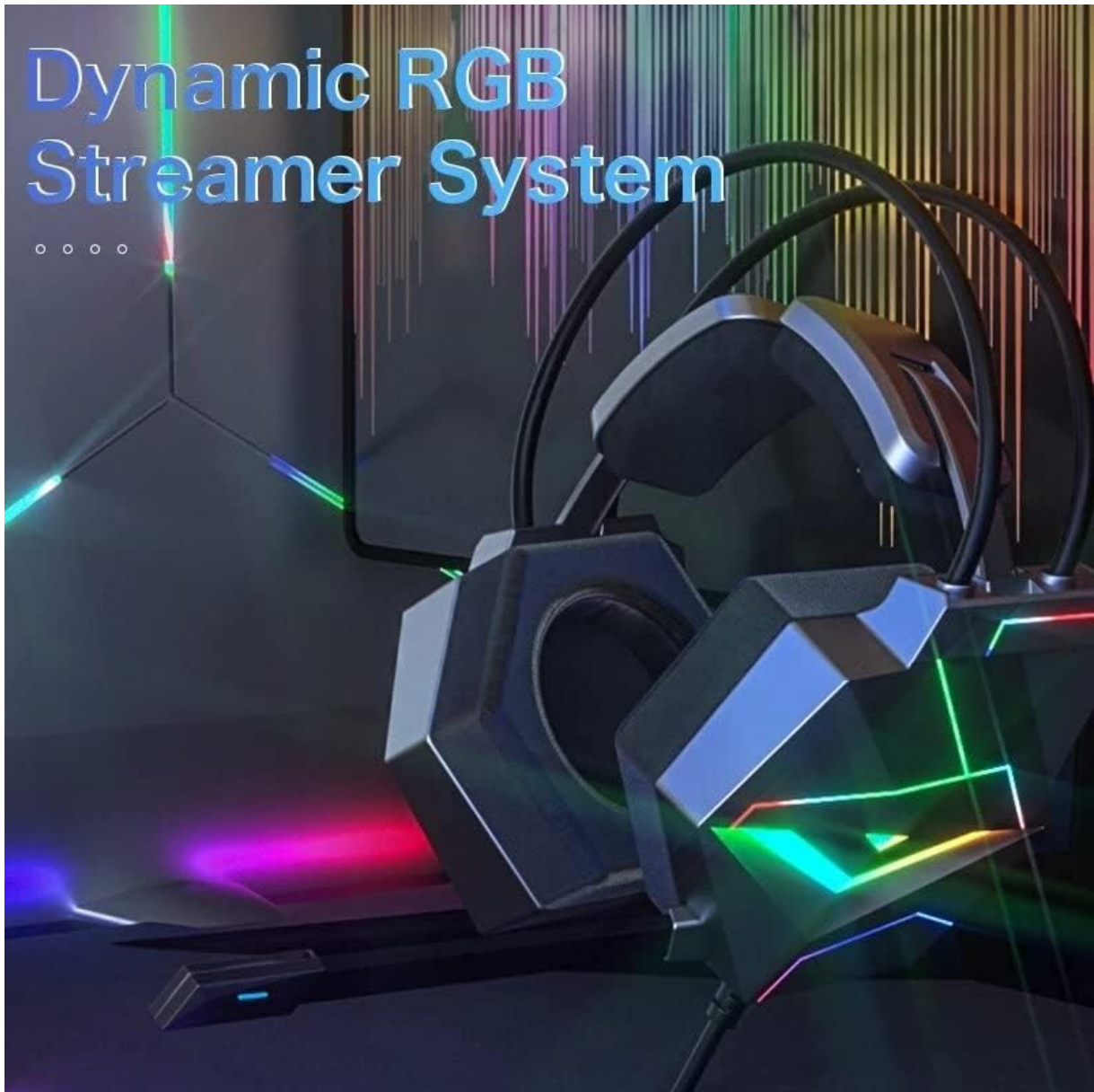
Image: The headset's earcups illuminated with dynamic RGB lighting.