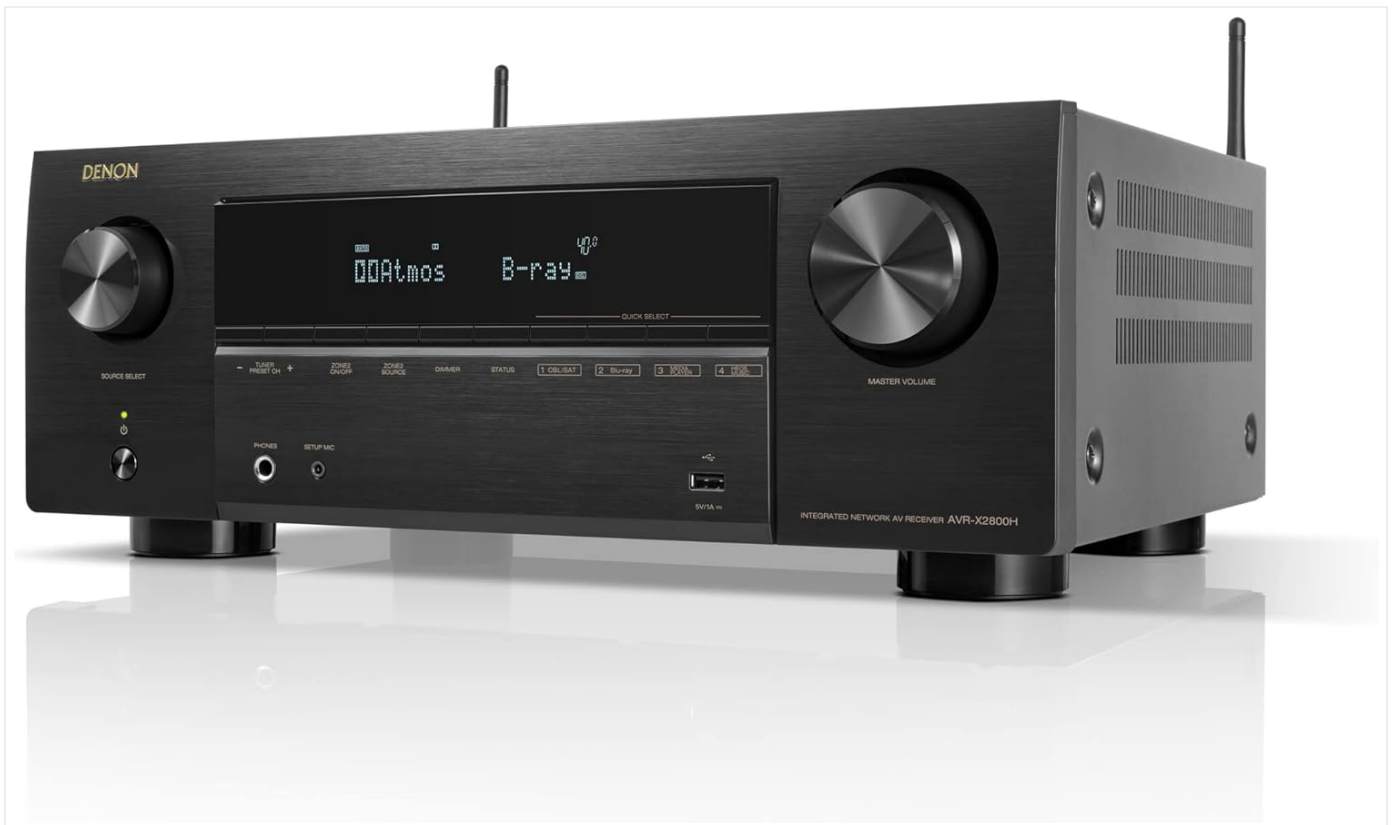
Figure 1: Front view of the Denon AVR-X2800H Receiver.

The Denon AVR-X2800H is a 7.2 channel 8K UHD Home Theater AV Receiver designed to deliver an immersive audio and video experience. It supports the latest 3D audio formats, advanced video specifications, and offers versatile connectivity options for a comprehensive home entertainment system.