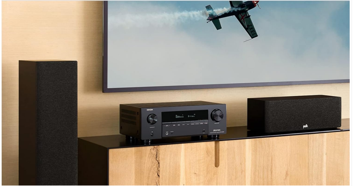
Figure 5: Audyssey Room Correction technology optimizes sound for your room.

The Audyssey suite of EQ software provides simple, accurate calibration to optimize sound for your room.