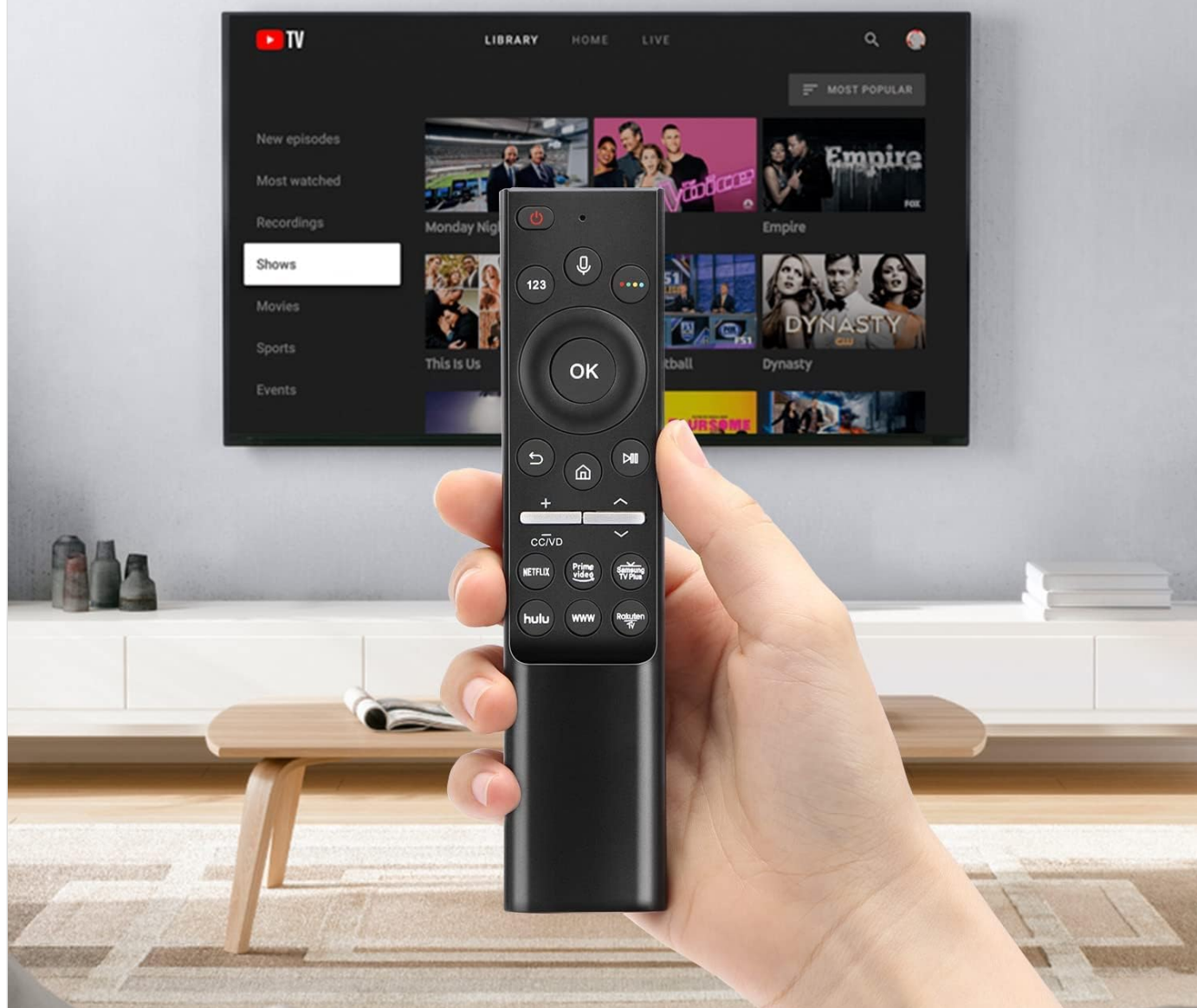
Figure 6: A user holding the Gmatrix remote, demonstrating its effective operating range. The image shows the remote being used comfortably from a distance, with the TV screen visible in the background.

The voice remote designed by upgraded chips, easily control far from 15 meters / 50 feet.