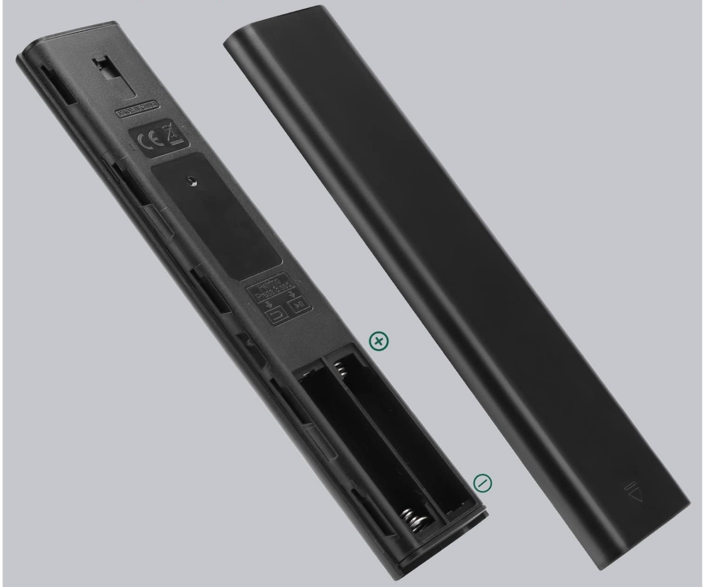
Figure 2: Battery compartment of the Gmatrix remote. This image shows the back of the remote with the battery cover removed, illustrating where to insert two AAA batteries.

( Battery not included, not solar remote )