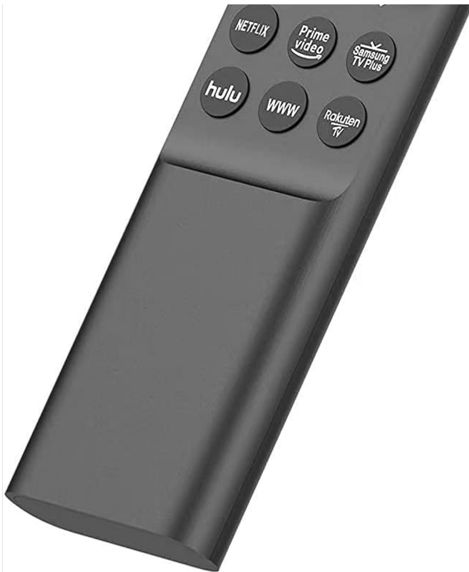
Figure 1: Gmatrix Replacement Voice Remote Control. This image displays the sleek, black remote control with its various buttons, including the prominent voice control microphone icon at the top.

Important Note: This remote is NOT compatible with IR (Infrared) technology. Voice control functionality is supported only for Samsung TV models with Bixby/Alexa built-in.