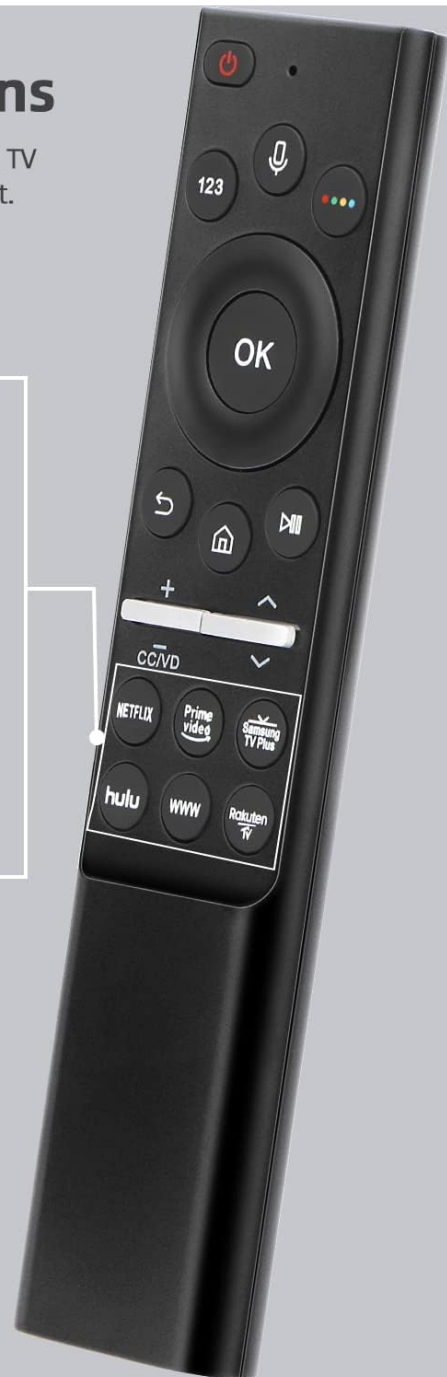
Figure 5: The Gmatrix remote highlighting its shortcut buttons. This image clearly labels the dedicated buttons for Netflix, Prime Video, Samsung TV Plus, Hulu, WWW, and Rakuten TV, providing quick access to these services.