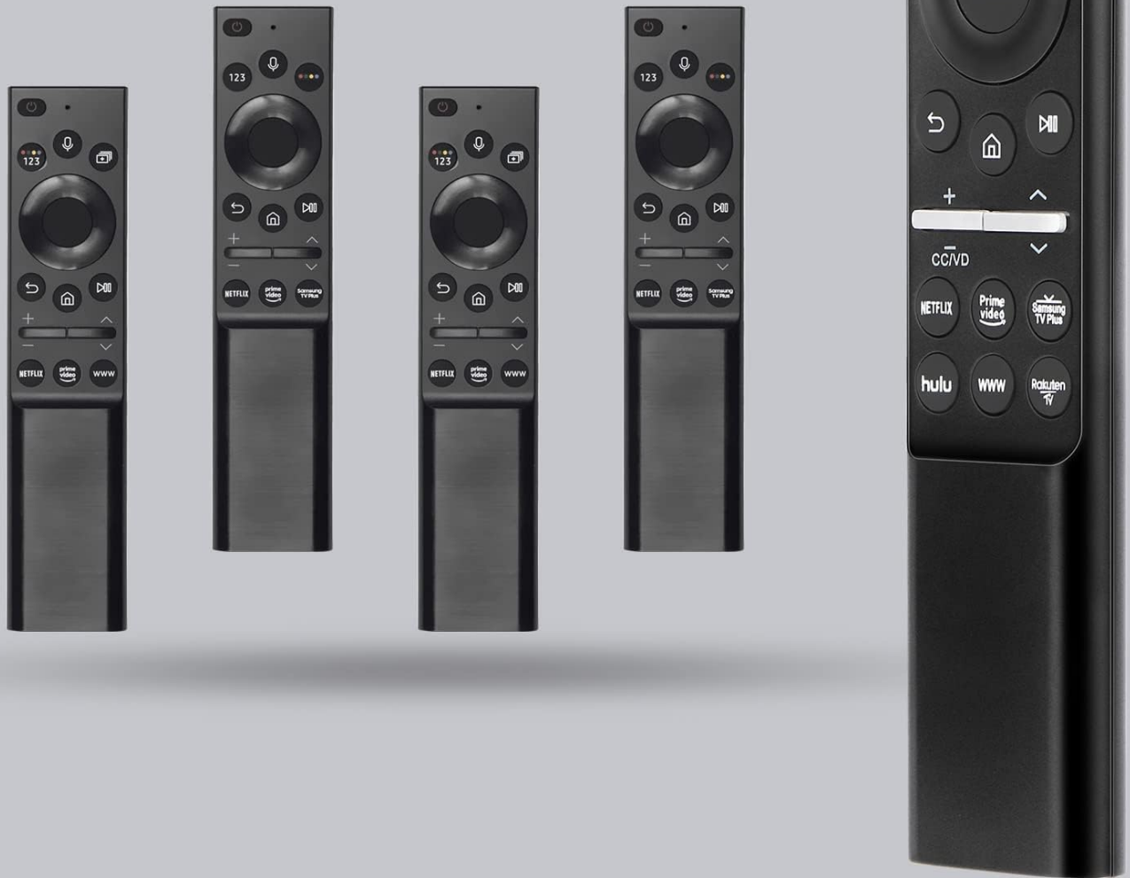
Figure 7: The Gmatrix remote positioned next to several original Samsung remote models it is designed to replace. This image visually confirms its role as a compatible replacement.

BN59-01357A, BN59-01357F, BN59-01357L, BN59-01363A, BN59-01363C, BN59-01363L, BN59-01380A, BN59-01385A, BN59-01385B, BN59-01385D, BN59-01386D, BN59-01391A etc.