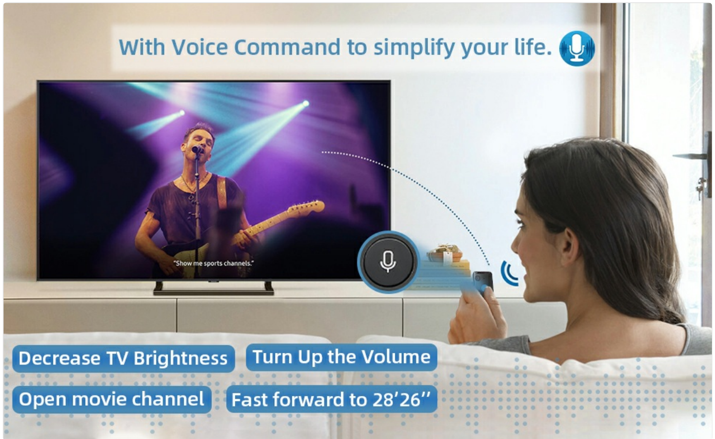
Figure 4: A user demonstrating voice command functionality. This image shows a person speaking into the remote, with example commands displayed on the screen, illustrating how voice control simplifies interaction with the TV.