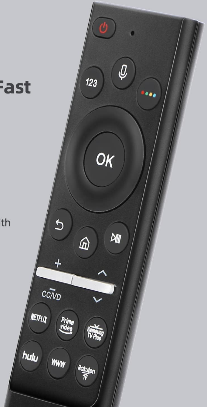
Figure 3: Voice Control feature on the Gmatrix remote. This image highlights the microphone button and illustrates the concept of voice commands, which are enabled after successful pairing.

Use Voice command and you'll find your favorite content faster than ever before. Spend more time watching with voice remote.