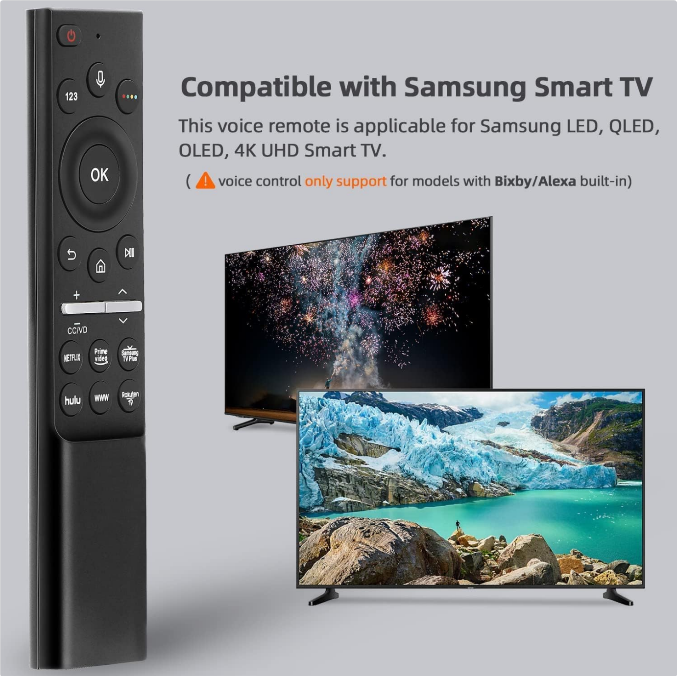
Figure 8: The Gmatrix remote displayed alongside two different Samsung Smart TVs, illustrating its broad compatibility with various Samsung LED, QLED, OLED, and 4K UHD models.