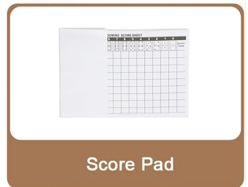
Figure 1: All components included in the uvcany Mexican Train Dominoes Set, including 91 numbered tiles, 4 wooden racks, 9 colorful trains, a central hub, a score pad, and a portable carrying case.