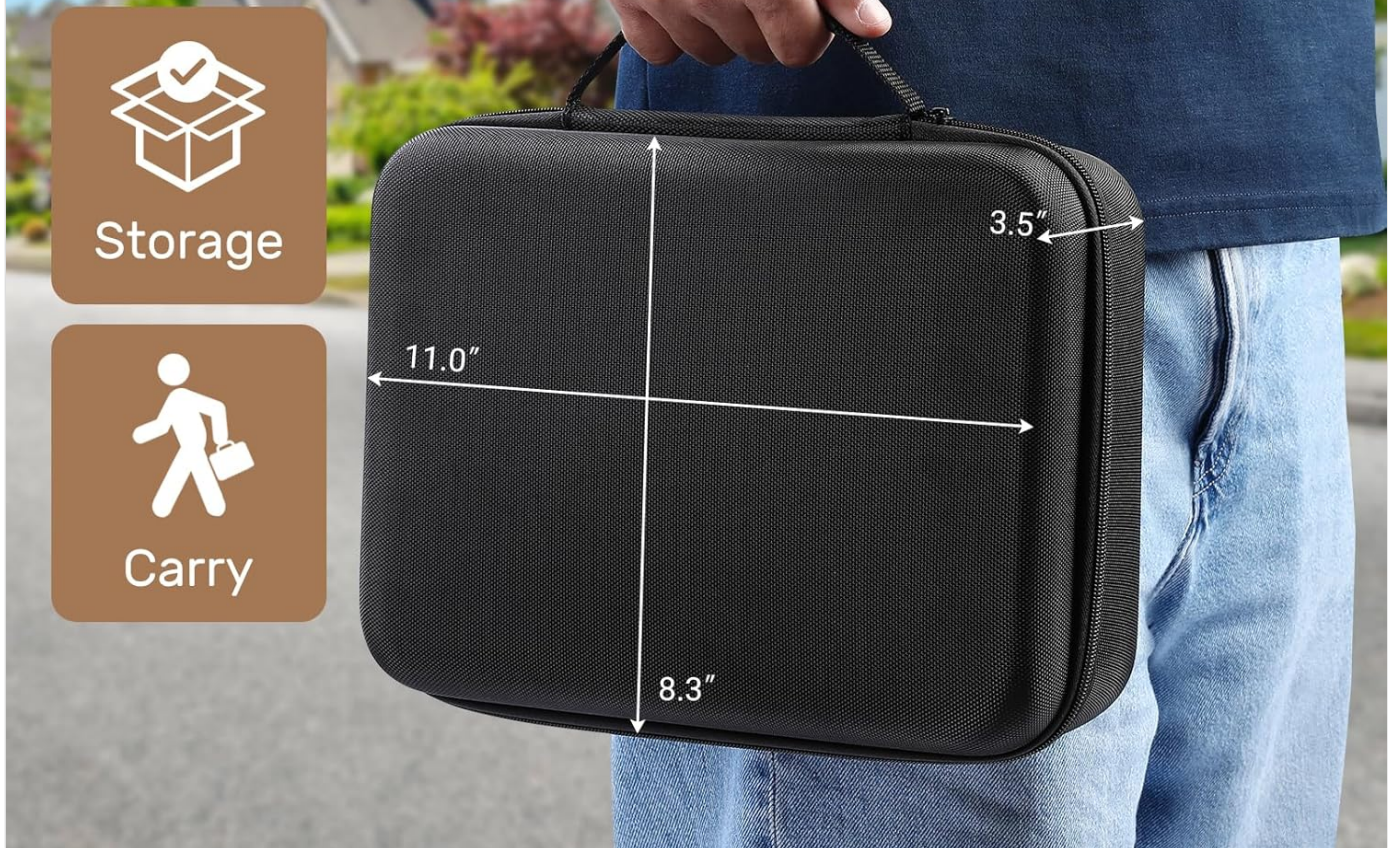
Figure 2: The durable zippered carrying case, measuring approximately 11.0" x 8.3" x 3.5", designed for convenient storage and portability of the entire dominoes set.

All pieces (including 4 wooden racks) can fit in the zippered case, easy to store and carry