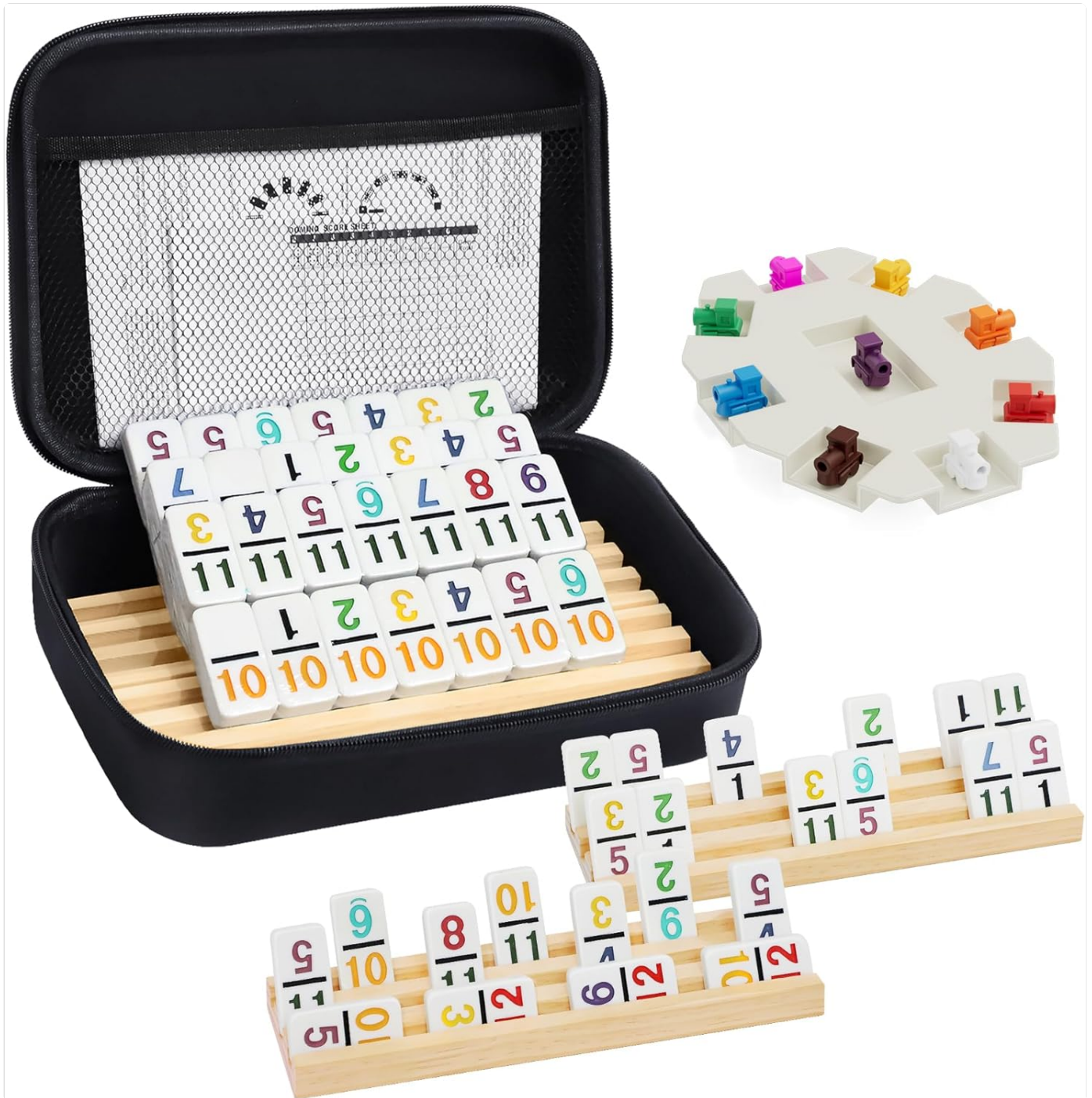
Figure 3: The uvcany Mexican Train Dominoes Set ready for setup, showing the tiles, wooden racks, and central hub.

Your browser does not support the video tag.