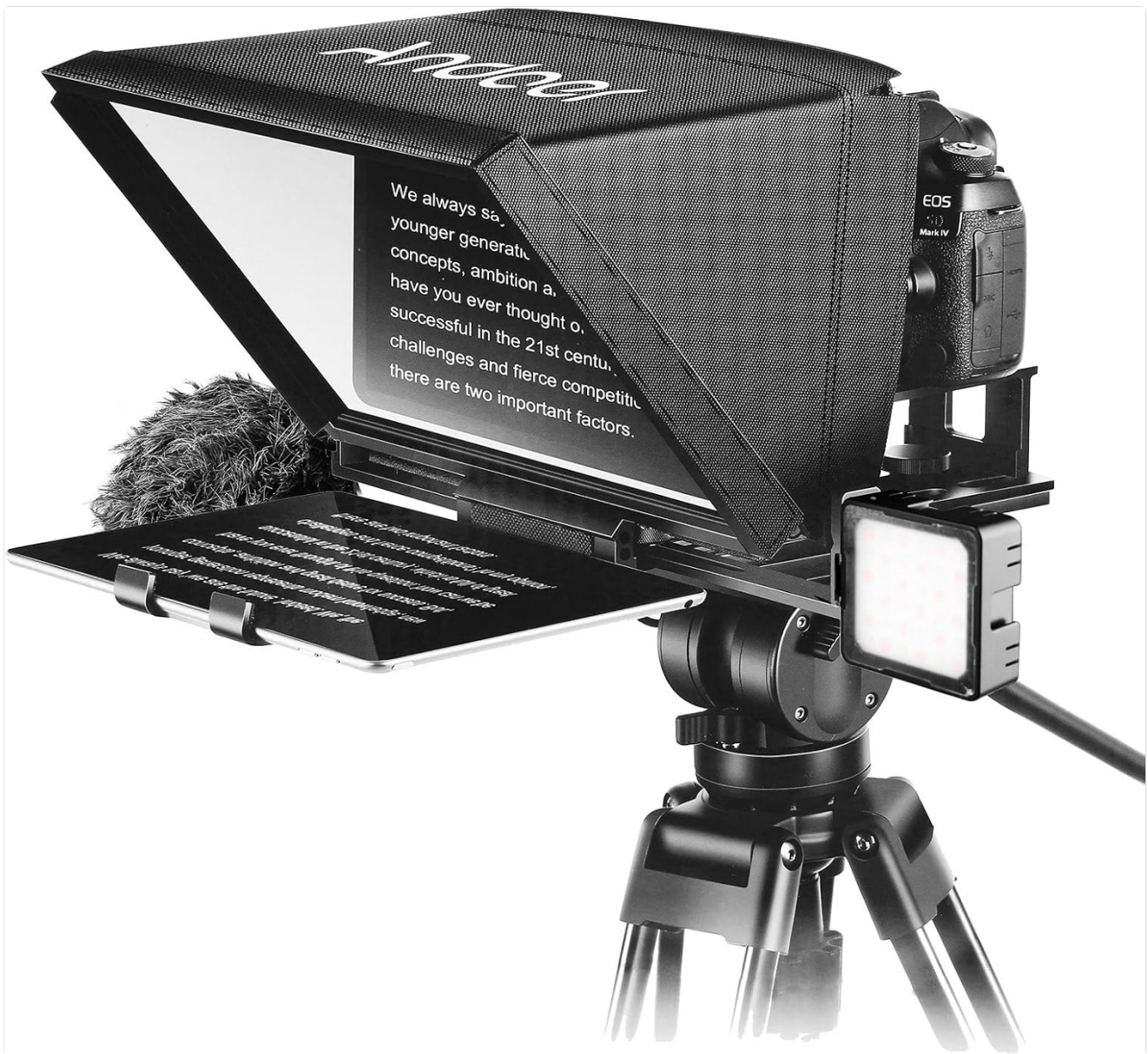
Image: The Andoer A12 teleprompter assembled with a DSLR camera mounted, ready for use, showcasing its compact design.