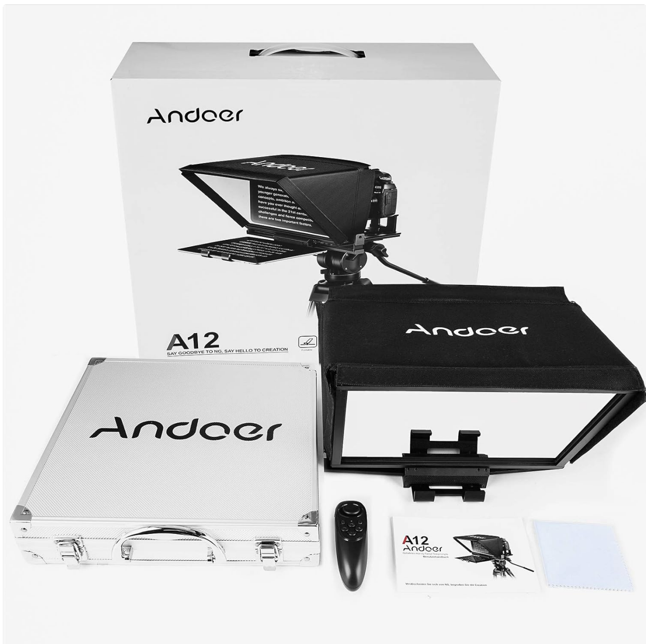
Image: The Andoer A12 teleprompter system, including the main unit, remote control, cleaning cloth, and carry case, laid out next to its packaging.