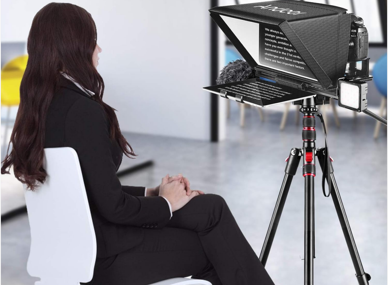
Image: A person sitting in front of the Andoer A12 teleprompter, which is mounted on a tripod with a camera, demonstrating its use for recording.