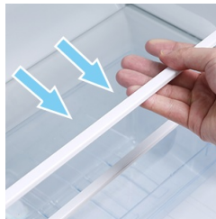
Image: A hand demonstrating the removal of a glass shelf from the refrigerator interior, illustrating the adjustable storage options.