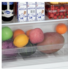
Image: A crisper drawer filled with various fruits and vegetables, demonstrating its function for fresh produce storage.