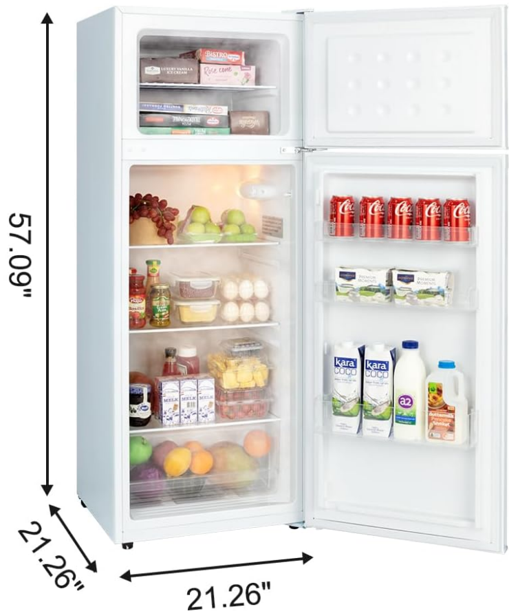
Image: Front view of the Frestec 7.4 CU' Refrigerator with key dimensions (57.09" height, 21.26" width, 21.26" depth) and features like Energy Saving, Keep Fresh, Quiet Operation, Automatic Lighting, and Available Modes.