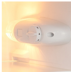
Image: Close-up view of the mechanical thermostat dial, typically located inside the refrigerator compartment, used to adjust temperature settings.

The refrigerator features an adjustable thermostat control. The freezer temperature can be set from 21.2°F to -0.4°F, ideal for frozen food and ice cream. The refrigerator zone operates from 32°F to 50°F, keeping ingredients fresh and locking in moisture. Adjust the dial inside the refrigerator compartment to your desired setting.