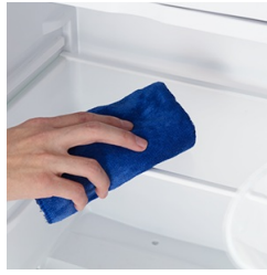
Image: A hand cleaning the interior of the refrigerator with a cloth, emphasizing the ease of cleaning due to removable components.

and warm water to wipe down surfaces. Rinse with clean water and dry thoroughly. The removable shelves facilitate easy cleaning.