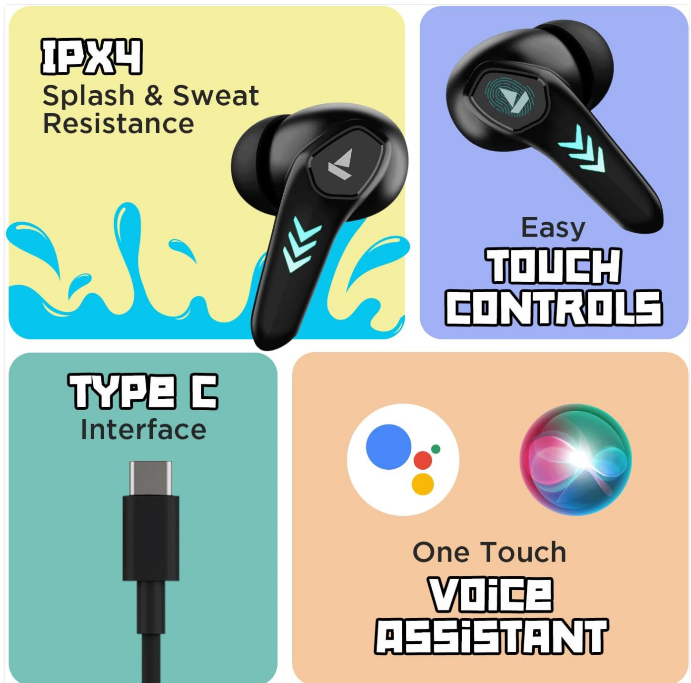
Image: A visual representation of key features including IPX4 splash and sweat resistance, easy touch controls on the earbuds, a Type-C charging interface, and one-touch access to voice assistants like Google Assistant and Siri.