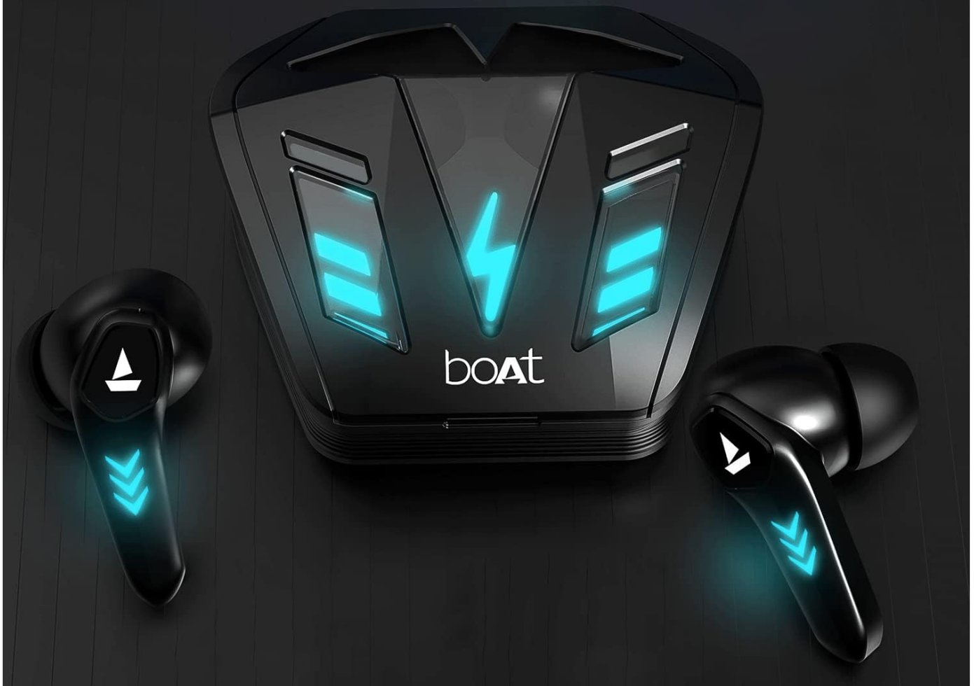
Image: The boAt Airdopes 190 charging case and earbuds, showcasing the "Fancy Breathing LED Lights" which illuminate in blue, designed to enhance the gaming experience.