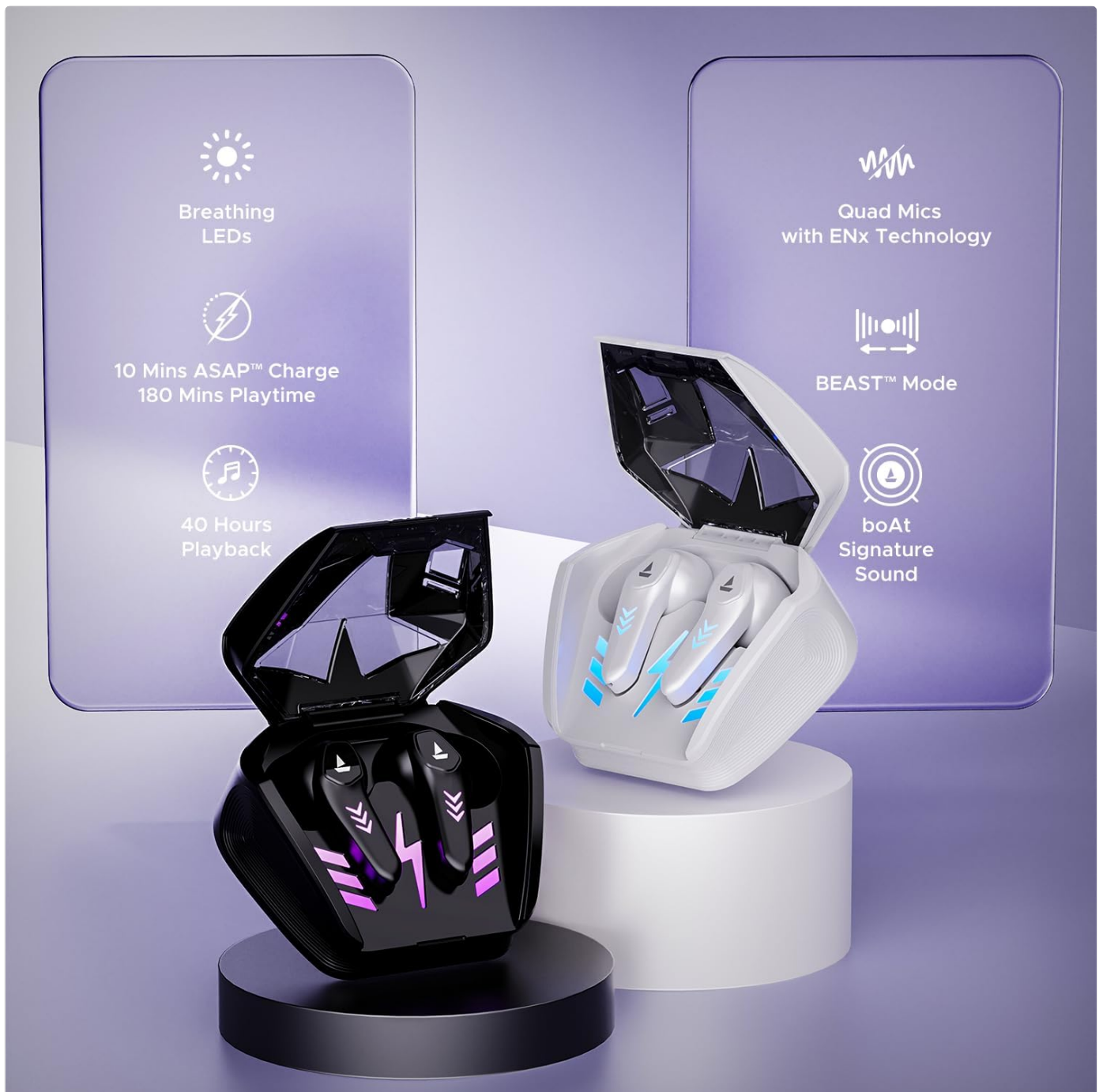
Image: boAt Airdopes 190 TWS Earbuds in black and white, highlighting features such as Breathing LEDs, Quad Mics with ENx Technology, BEAST Mode for low latency, 40 hours total playback, and 10 minutes ASAP Charge for 180 minutes playtime.