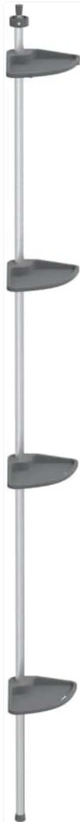
Image: All components of the vidaXL 4-Tier Telescopic Shower Corner Shelf, including the telescopic pole, four grey storage trays, and adjustment mechanisms.