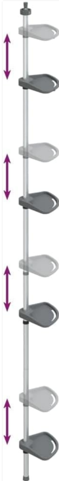
Image: The shower shelf with four trays, illustrating how the trays can be moved up or down the pole to customize storage height.