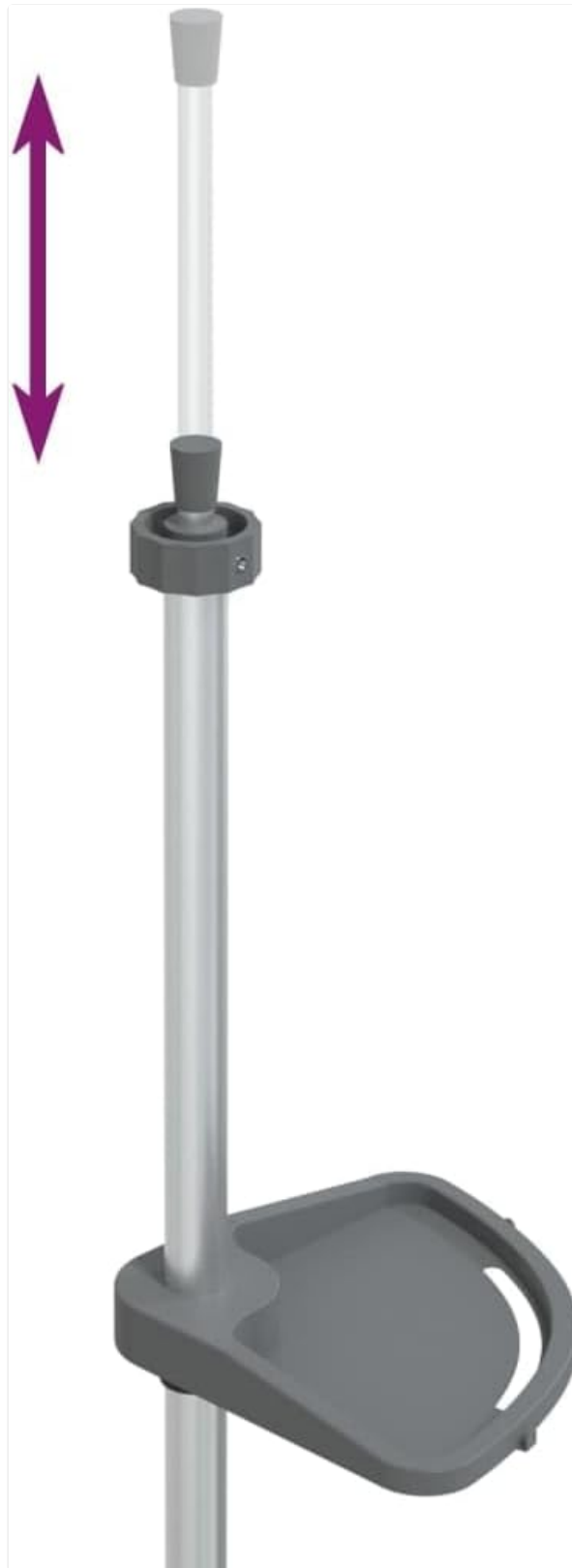
Image: Detail of the top section of the telescopic pole, showing the spring-loaded mechanism and adjustment knob for securing the pole between the floor and ceiling.