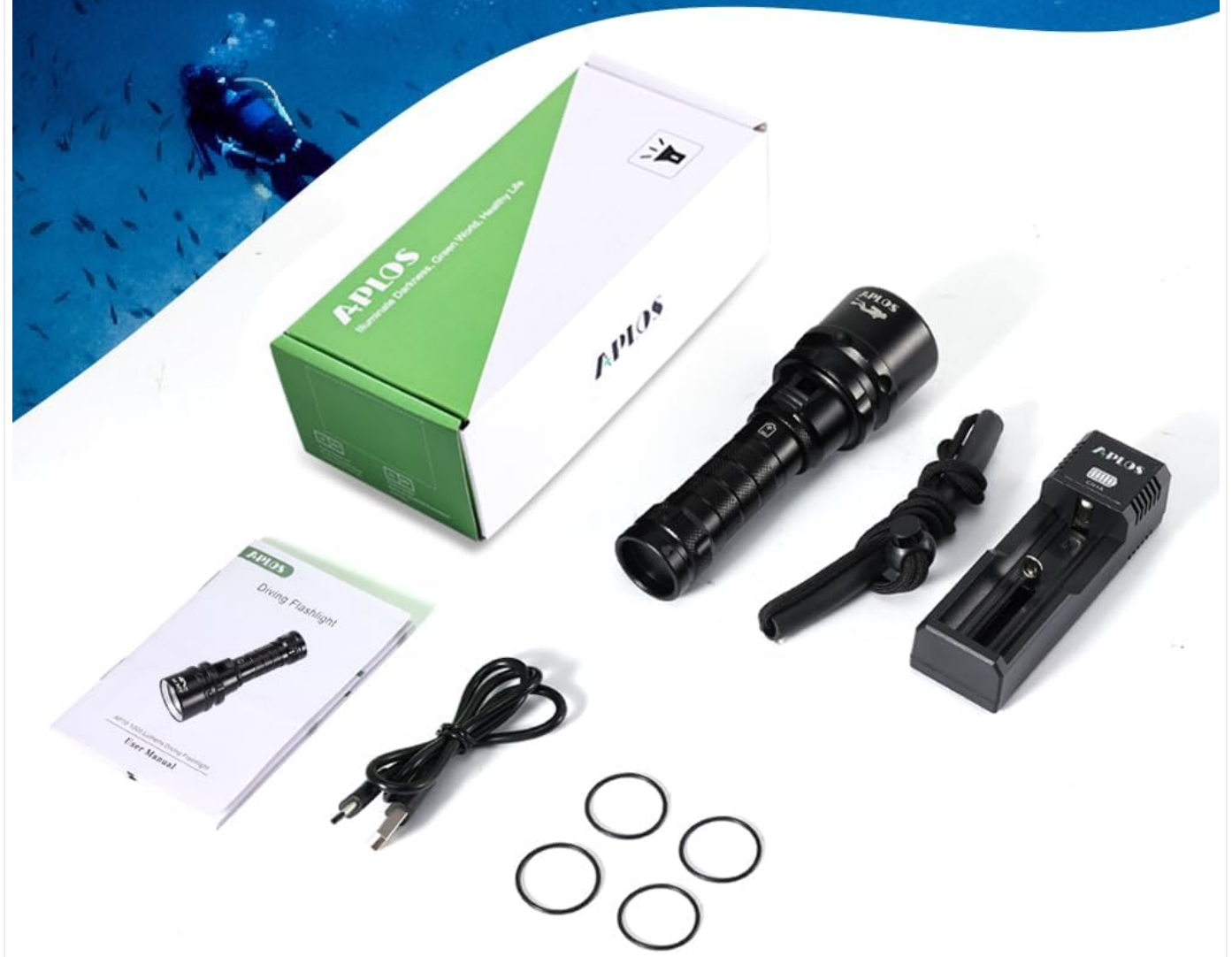
Image 3.1: All items included in the APLOS AP20 Scuba Dive Light package, laid out next to the product box.