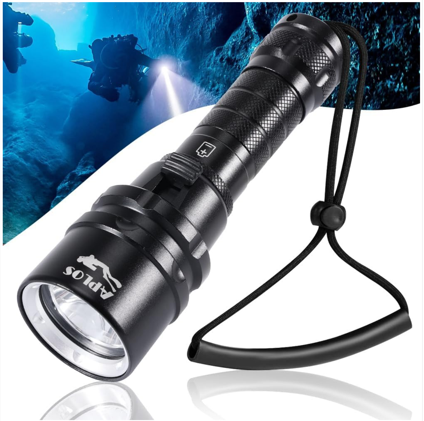
Image 1.1: The APLOS AP20 Scuba Dive Light, a compact and powerful underwater flashlight.