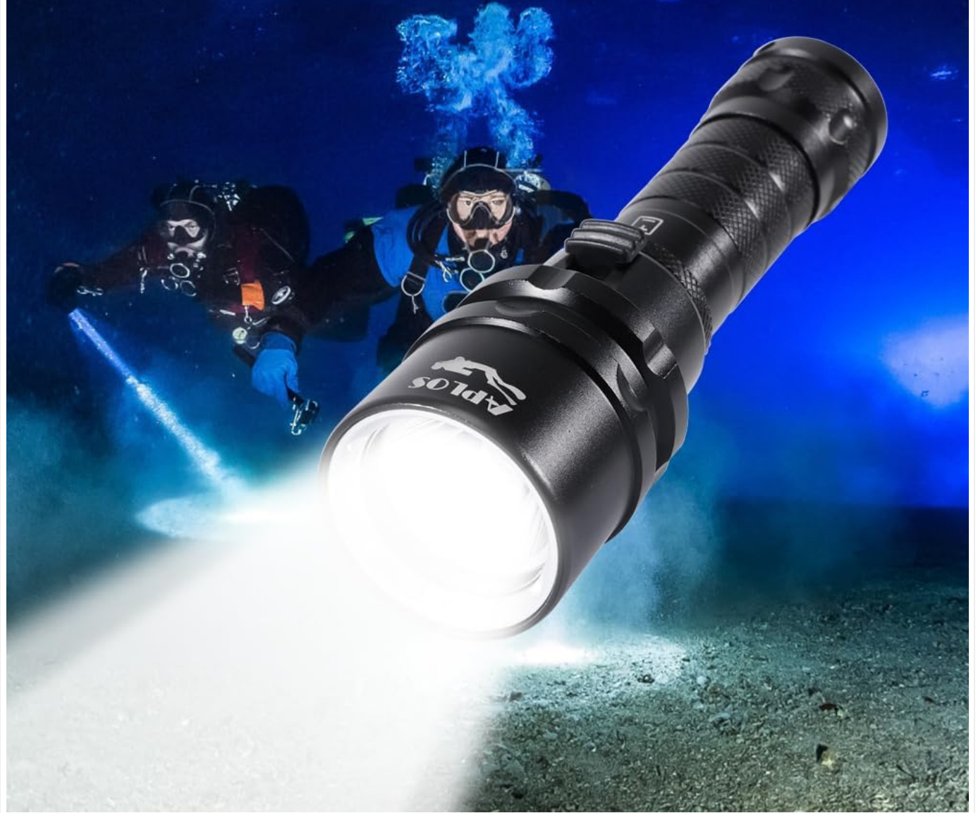
Image 2.2: Close-up of the APLOS AP20 showing its compact body and the 1 XM L2-2000 lumens LED bulb with over 50,000 hours lifespan.

1 XM L2-2000 lumens LED bulb with over 50,000 hours lifespan