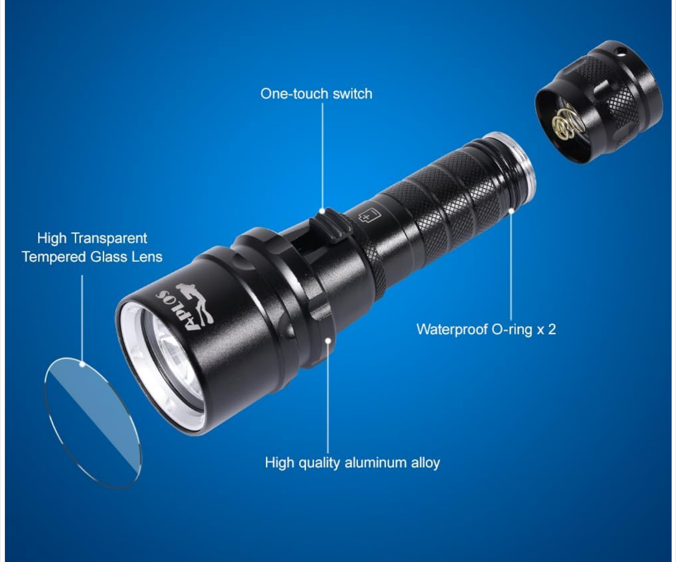
Image 4.1: Exploded view diagram of the APLOS AP20 showing its main components: AL-6061-T6 aircraft-grade aluminum body, high transparent tempered glass lens, one-touch switch, and waterproof O-rings.

AL-6061-T6 aircraft grade aluminum body, military regulations III hard anodized finish, abrasion and seawater corrosion resistance