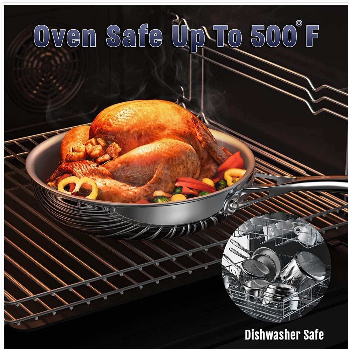
Image showing a turkey roasting in the frying pan inside an oven, with an inset indicating the cookware is dishwasher safe.

The cookware is oven safe up to 500°F (260°C). When using in the oven, always use oven mitts as handles will become hot.