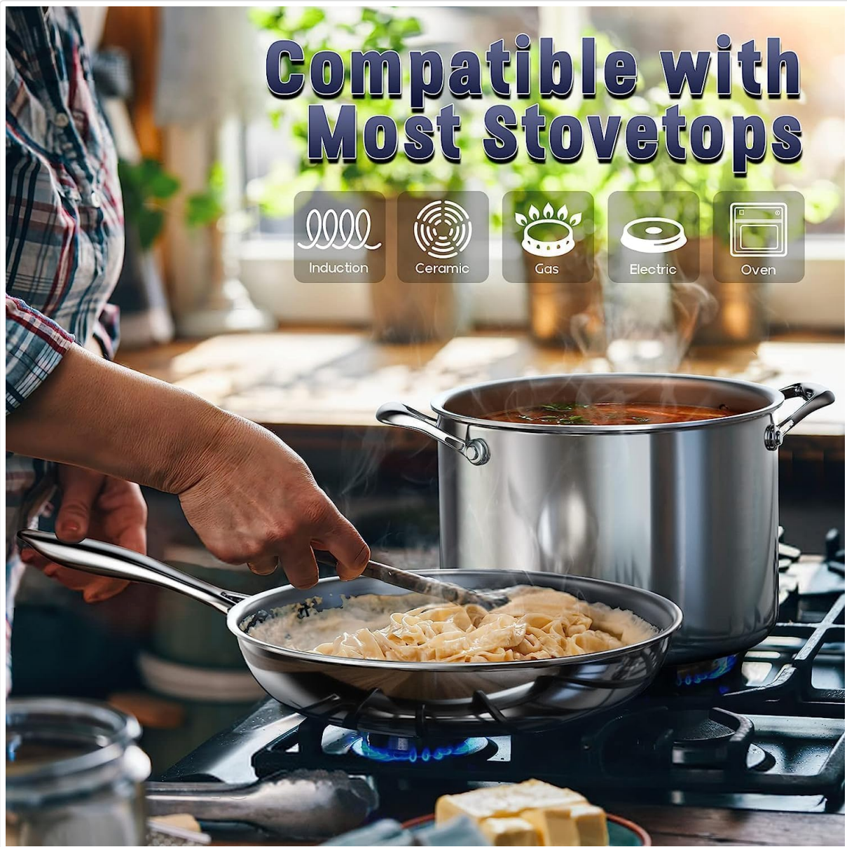
Image depicting the cookware's compatibility with various stovetop types including induction, ceramic, gas, electric, and oven.