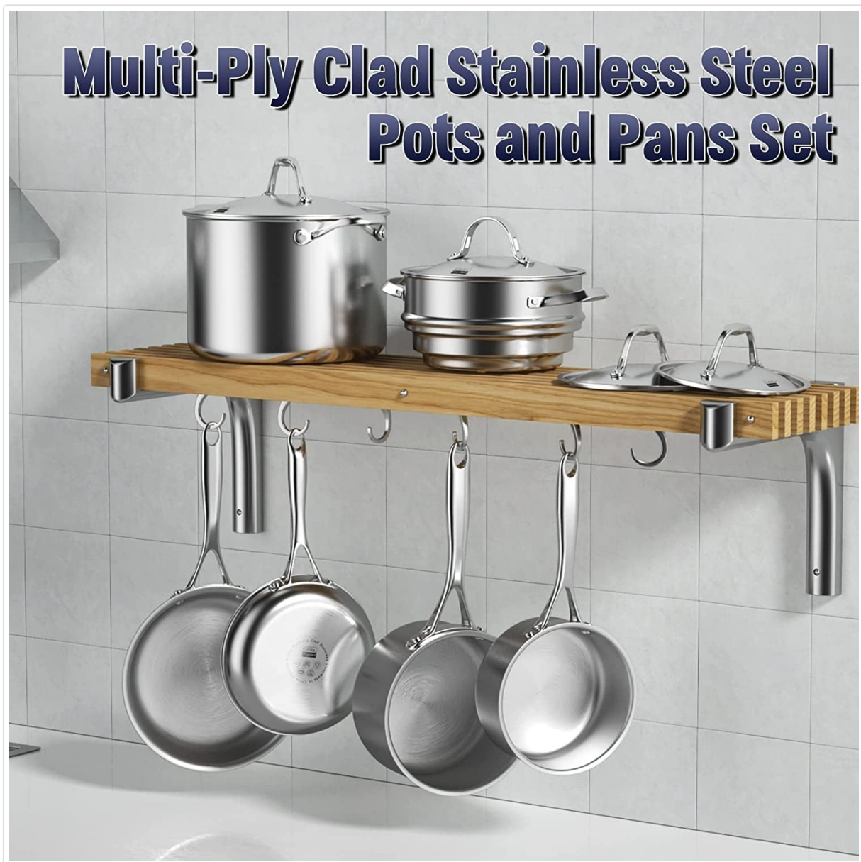
Image showing the Cooks Standard cookware set neatly stored on a kitchen rack, demonstrating proper storage.

Store cookware in a dry place. To prevent scratching when stacking, place a cloth or paper towel between pieces.