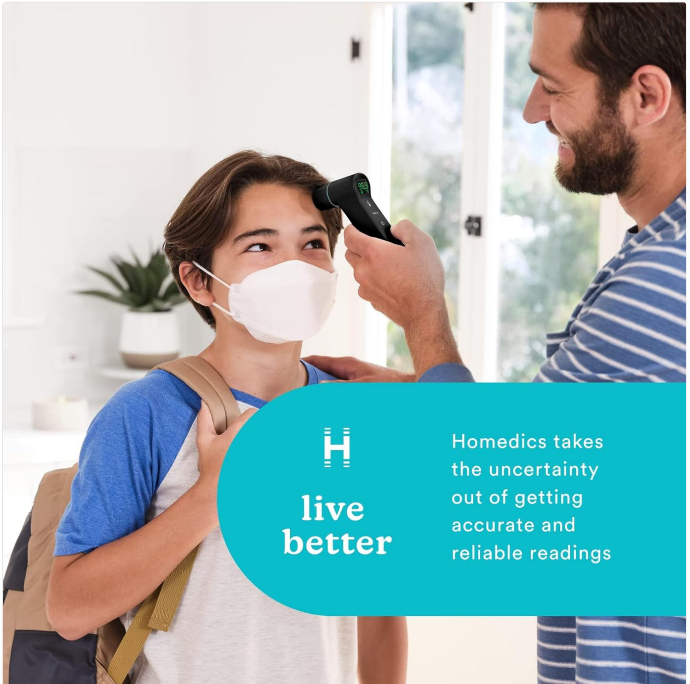
An adult taking a child's forehead temperature using the no-contact infrared technology of the HoMedics thermometer.