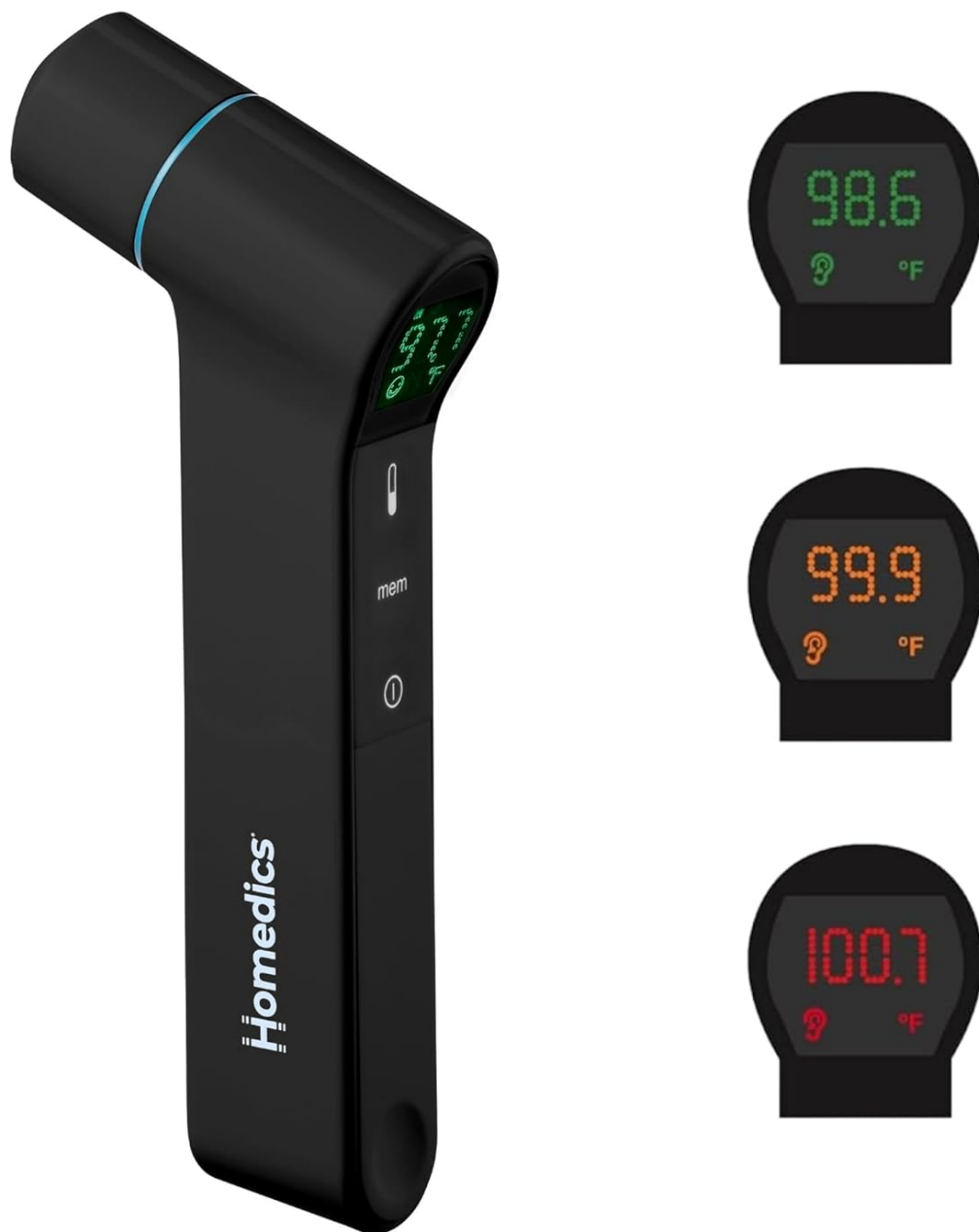
The HoMedics Dual-Use Ear and Forehead Thermometer, shown with its digital display indicating different temperature ranges via color coding (green for normal, orange for elevated, red for high fever).