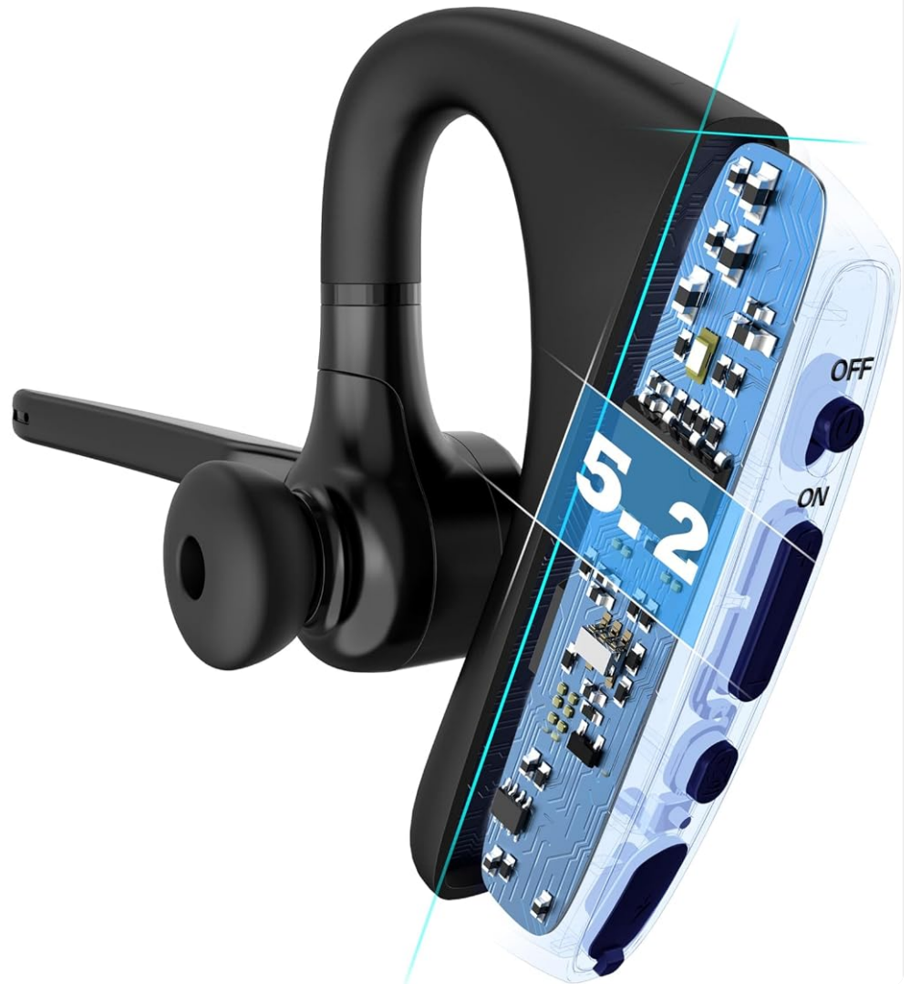
Figure 2: The headset is designed for comfortable, hands-free communication.

The Conambo K18 is a single-ear Bluetooth headset featuring advanced V5.1 wireless technology, dual-mic CVC8.0 and ENC noise cancellation for superior call clarity, and aptX HD audio for high-quality sound. It offers multipoint connectivity, allowing connection to two devices simultaneously, and provides up to 16 hours of talk time.