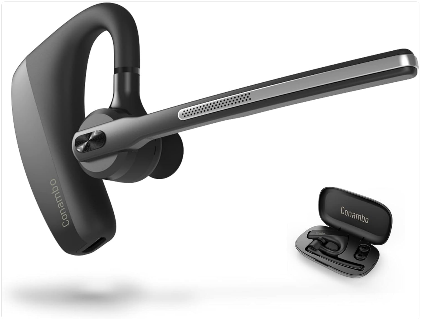
Figure 1: Conambo K18 Bluetooth Headset and its compact charging case.