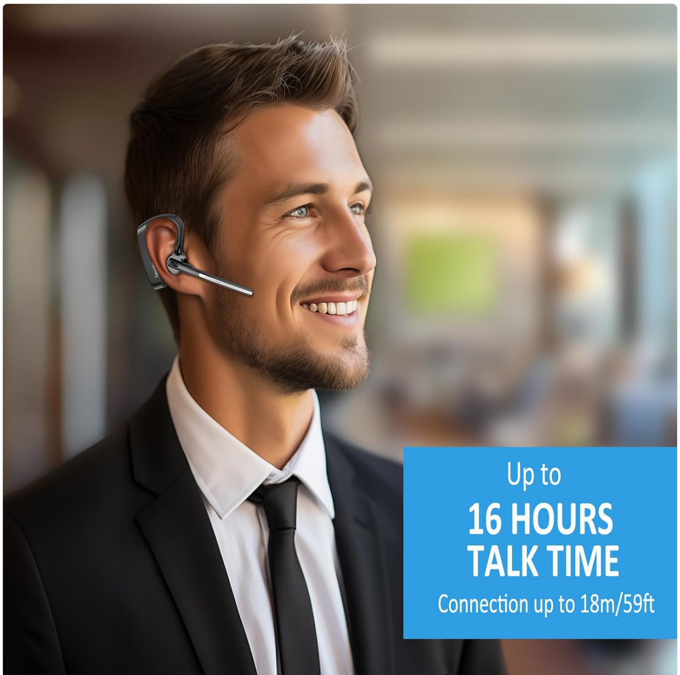
Figure 6: Enjoy up to 16 hours of talk time and a wireless range of up to 59 feet (18 meters).