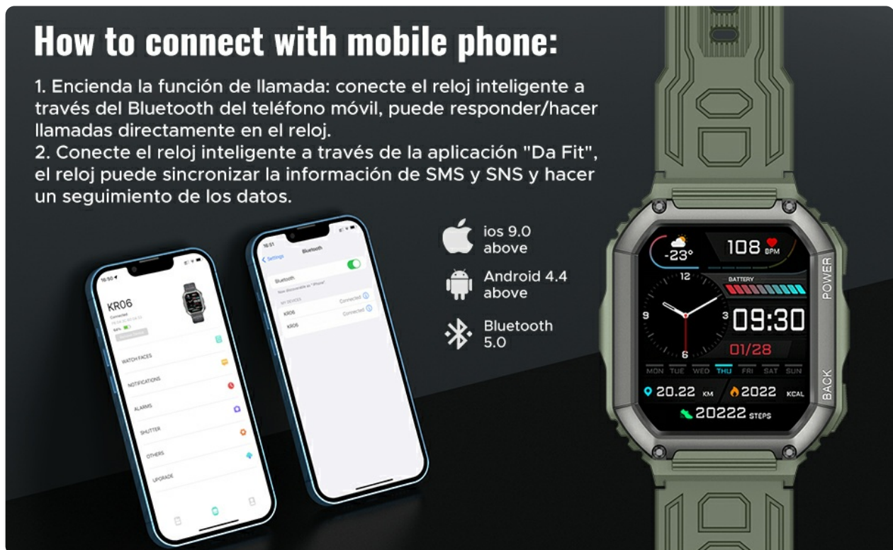
Image 4.1: Visual guide for connecting the smartwatch to a mobile phone via the 'Da Fit' app and Bluetooth.