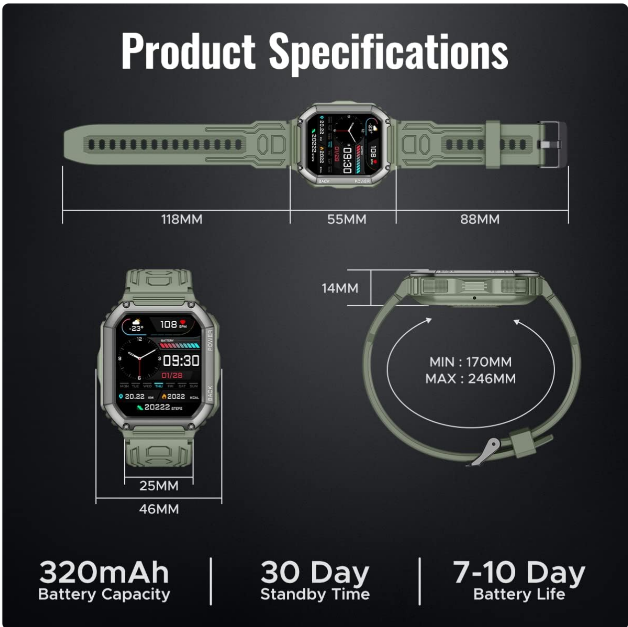
Image 3.1: Diagram showing the smartwatch dimensions and key physical features.

The watch typically includes a power button, a back button, and a charging port on the rear. The strap is made of comfortable silicone.