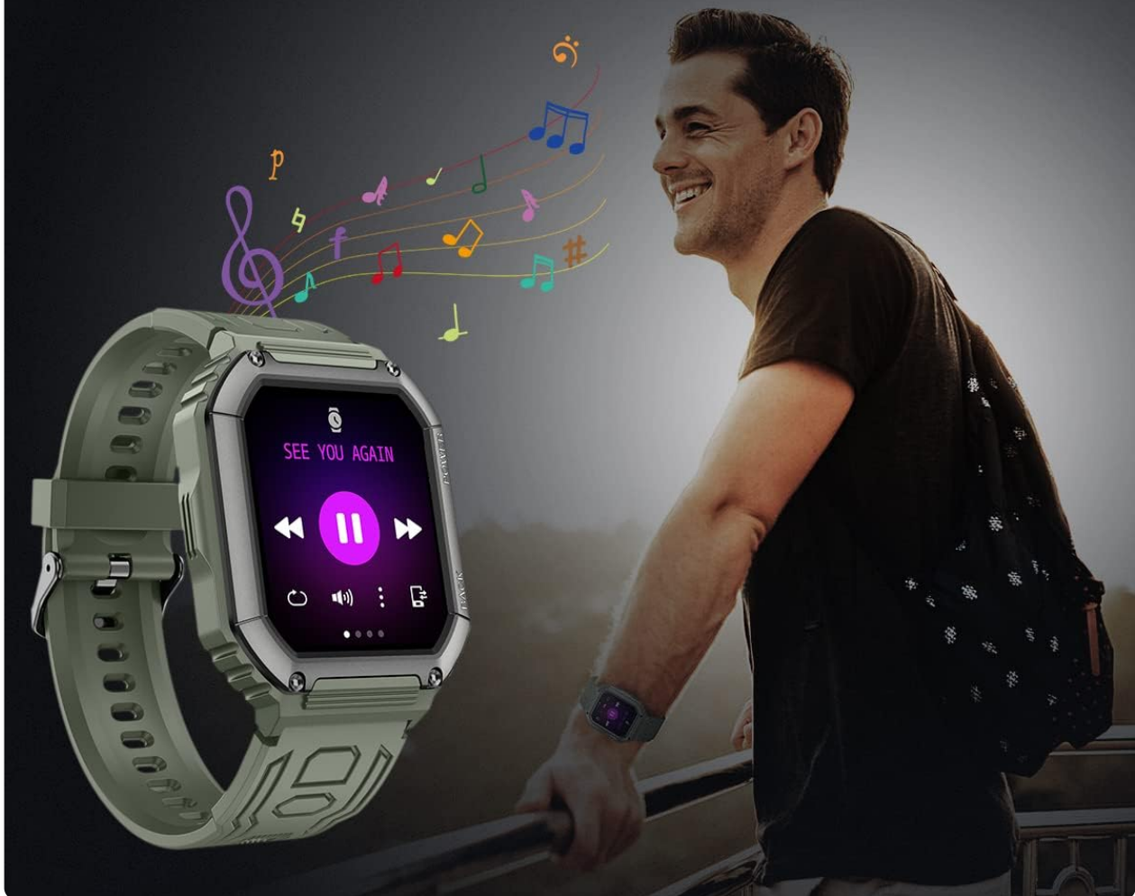
Image 5.4: The smartwatch displaying music controls, with a person enjoying music.

Connected to your phone, the smartwatch can play music.