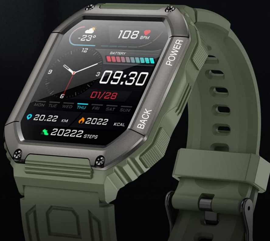
Image 6.1: Overview of key features including 1.8-inch screen, 320mAh battery, and IP67 waterproof rating.