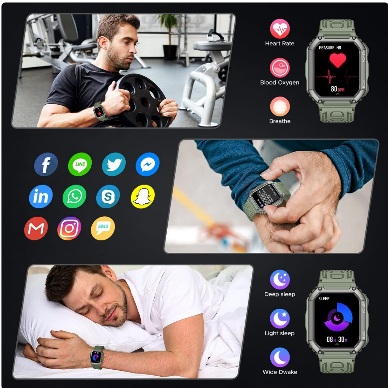
Image 5.2: Display of heart rate, blood oxygen, sleep tracking, and notification icons on the smartwatch.