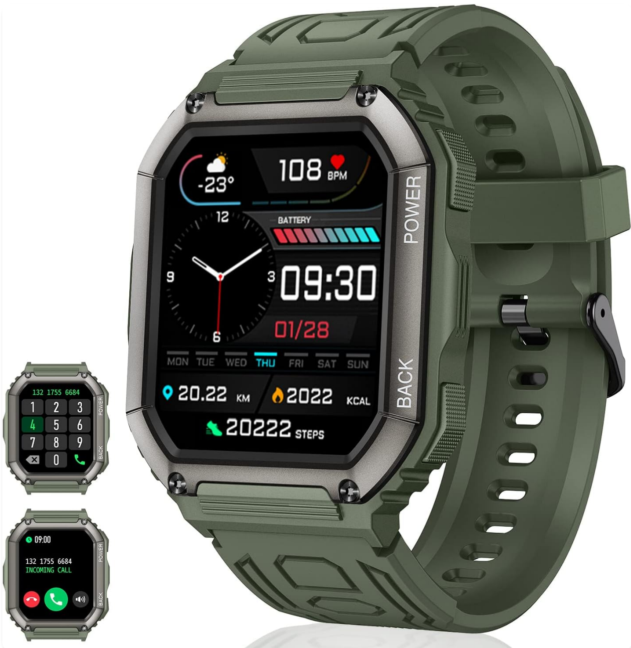
Image 1.1: Mofit Smartwatch, showcasing its rectangular display and green strap.