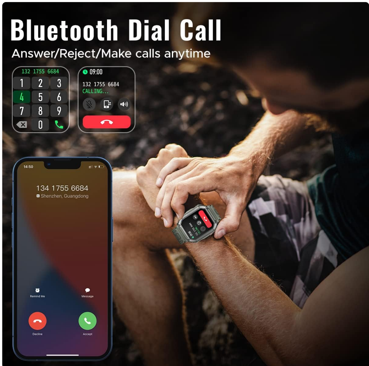
Image 5.1: Illustration of the Bluetooth dial call feature, showing the watch displaying an incoming call and a dial pad.