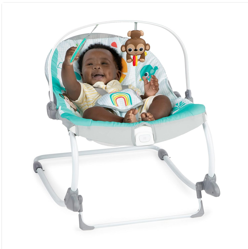
Figure 2: An infant seated comfortably in the rocker, demonstrating proper use of the harness system and interaction with the overhead toys.