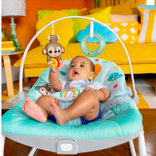
Figure 6: An infant engaging with the hanging toys on the toy bar, showcasing the interactive elements of the rocker.