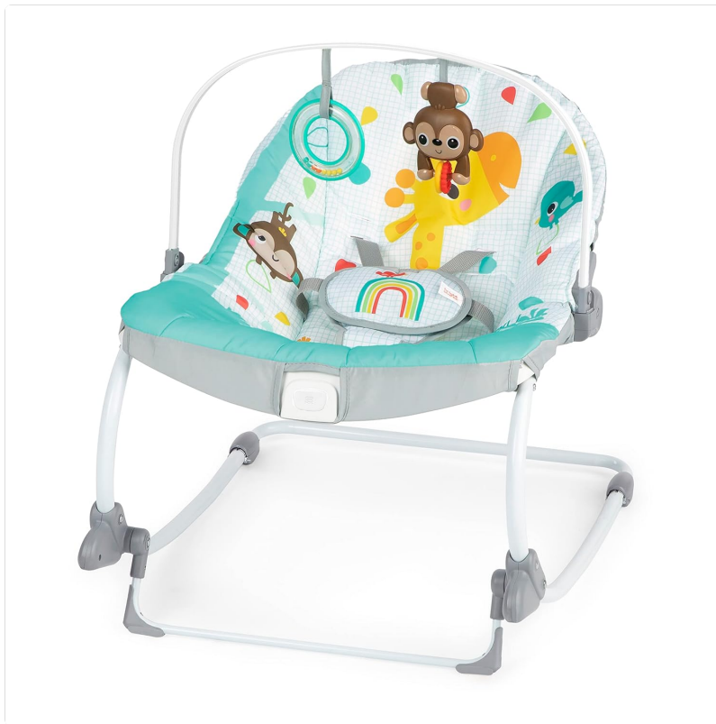
Figure 1: Fully assembled Bright Starts Wild Vibes Infant to Toddler Rocker. This image shows the complete product with the seat pad, toy bar, and toys attached to the frame.