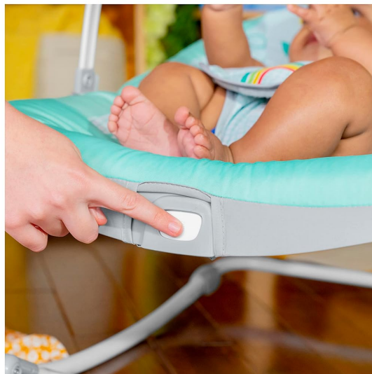
Figure 4: A close-up view of a finger pressing the one-button control for the vibration function, located on the side of the seat.

The vibration unit is integrated into the seat. To activate the soothing vibrations, locate the button on the side of the seat (as shown in Figure 4) and press it. Press the button again to turn the vibration off.