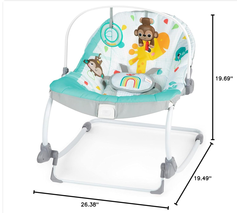
Figure 7: Diagram illustrating the key dimensions (height, width, depth) of the Bright Starts Wild Vibes Infant to Toddler Rocker.