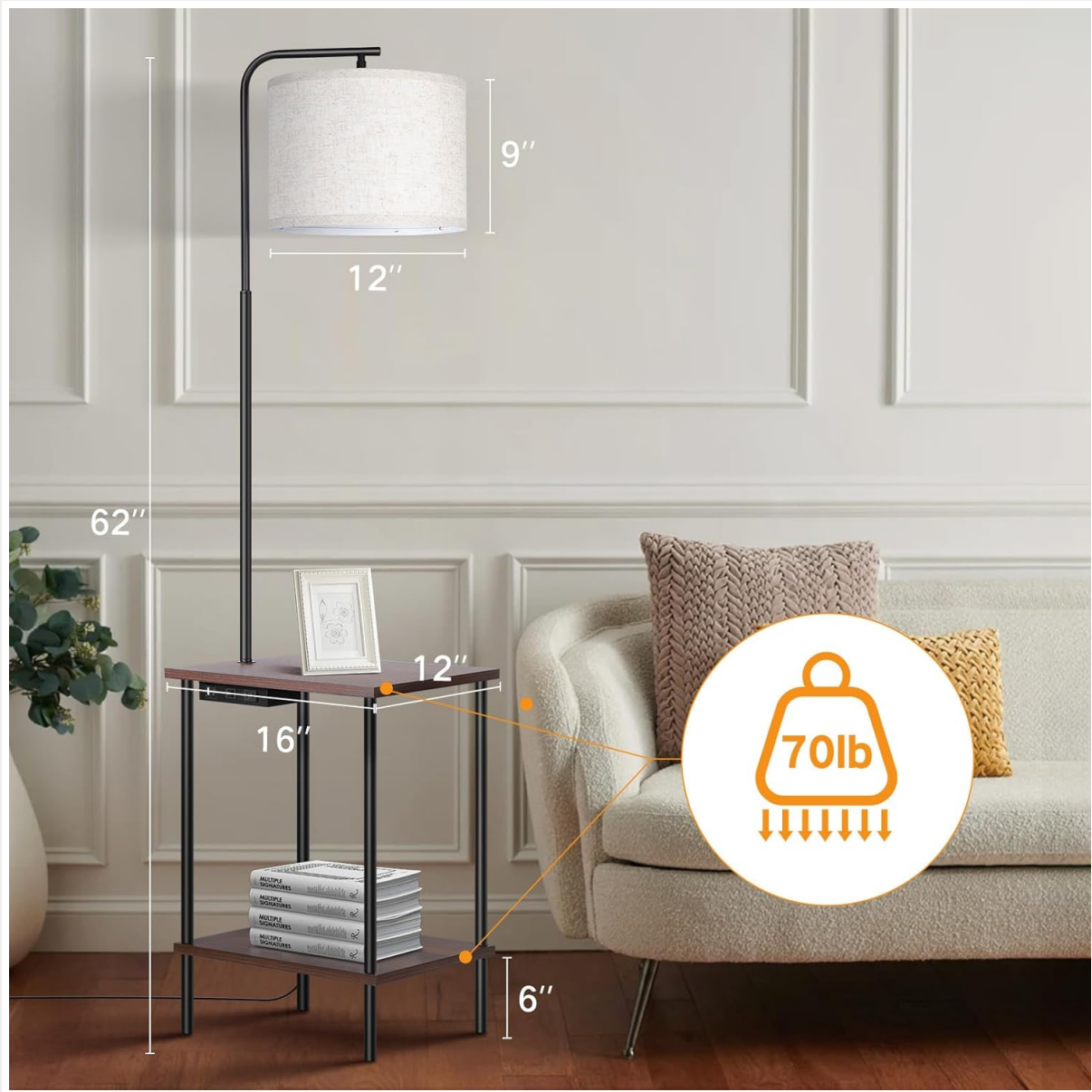
Image: Product dimensions for the OUTON Floor Lamp with Table.