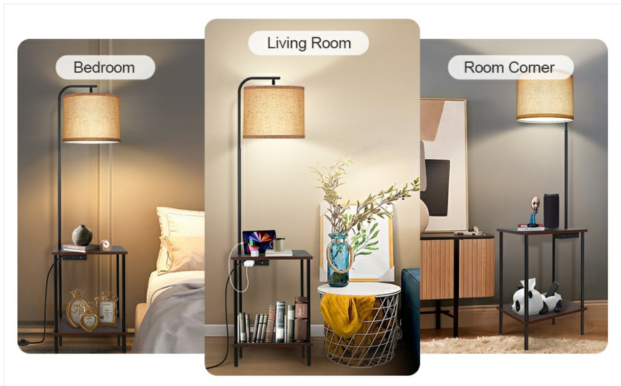
Image: Examples of different lighting modes for various activities.