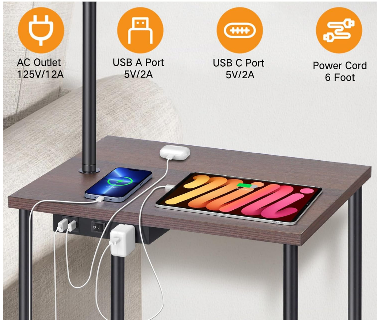
Image: Close-up of the 3-in-1 charging station on the side table.

Quickly charge your 3 devices simultaneously whether the lamp is on or off.