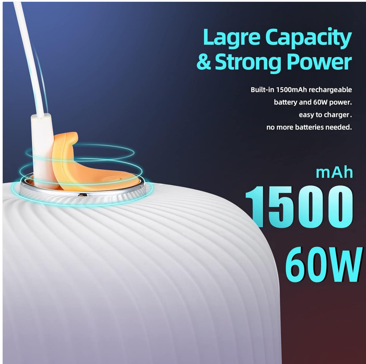
Figure 4.1: USB Charging Port

This image highlights the USB charging port located on the top of the motor unit, indicating where to connect the charging cable.