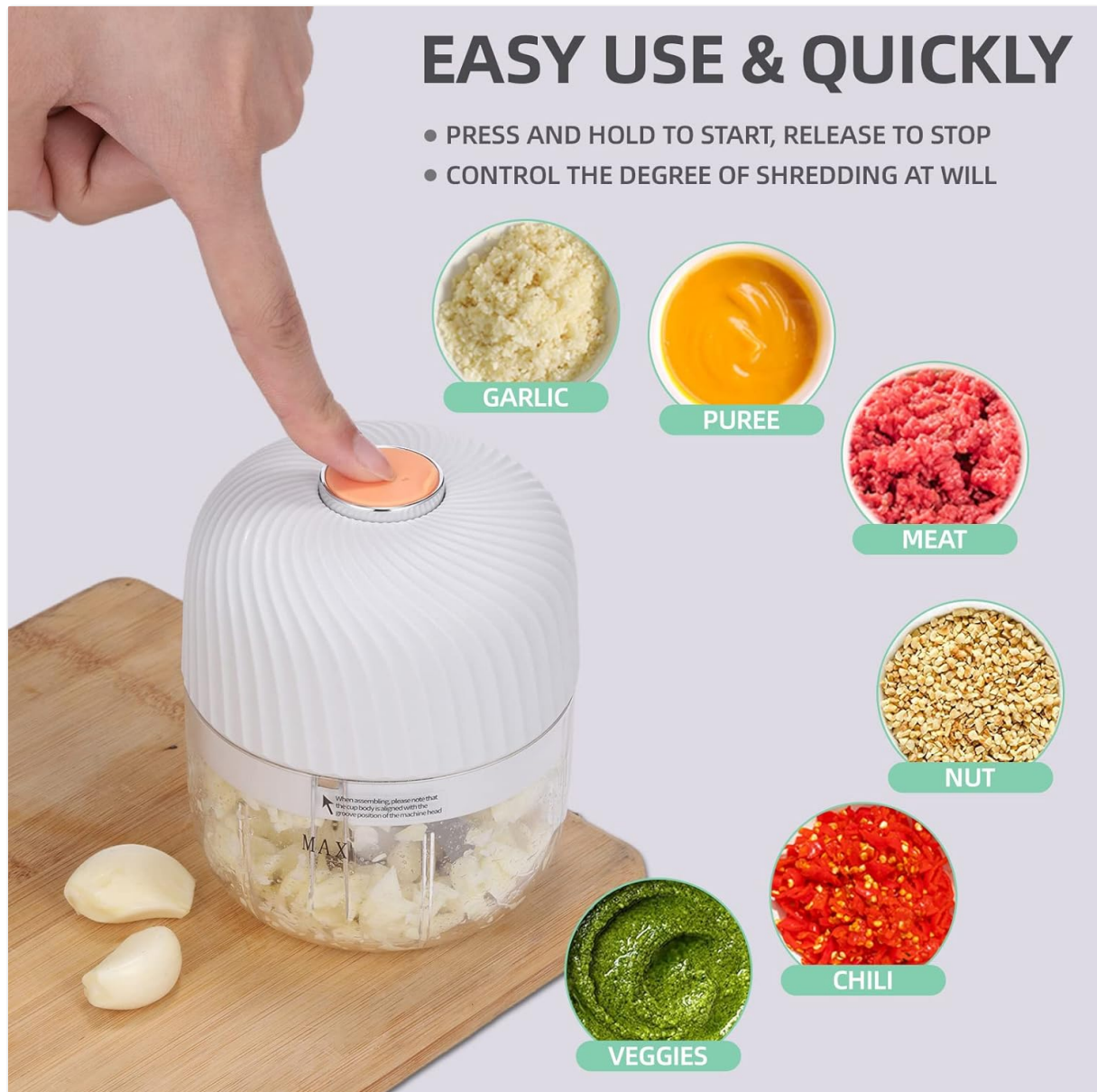
Figure 5.1: Easy Operation

This image demonstrates the simple press-and-hold operation of the chopper. It also shows examples of ingredients that can be processed, such as garlic, purees, meat, nuts, chili, and other vegetables.