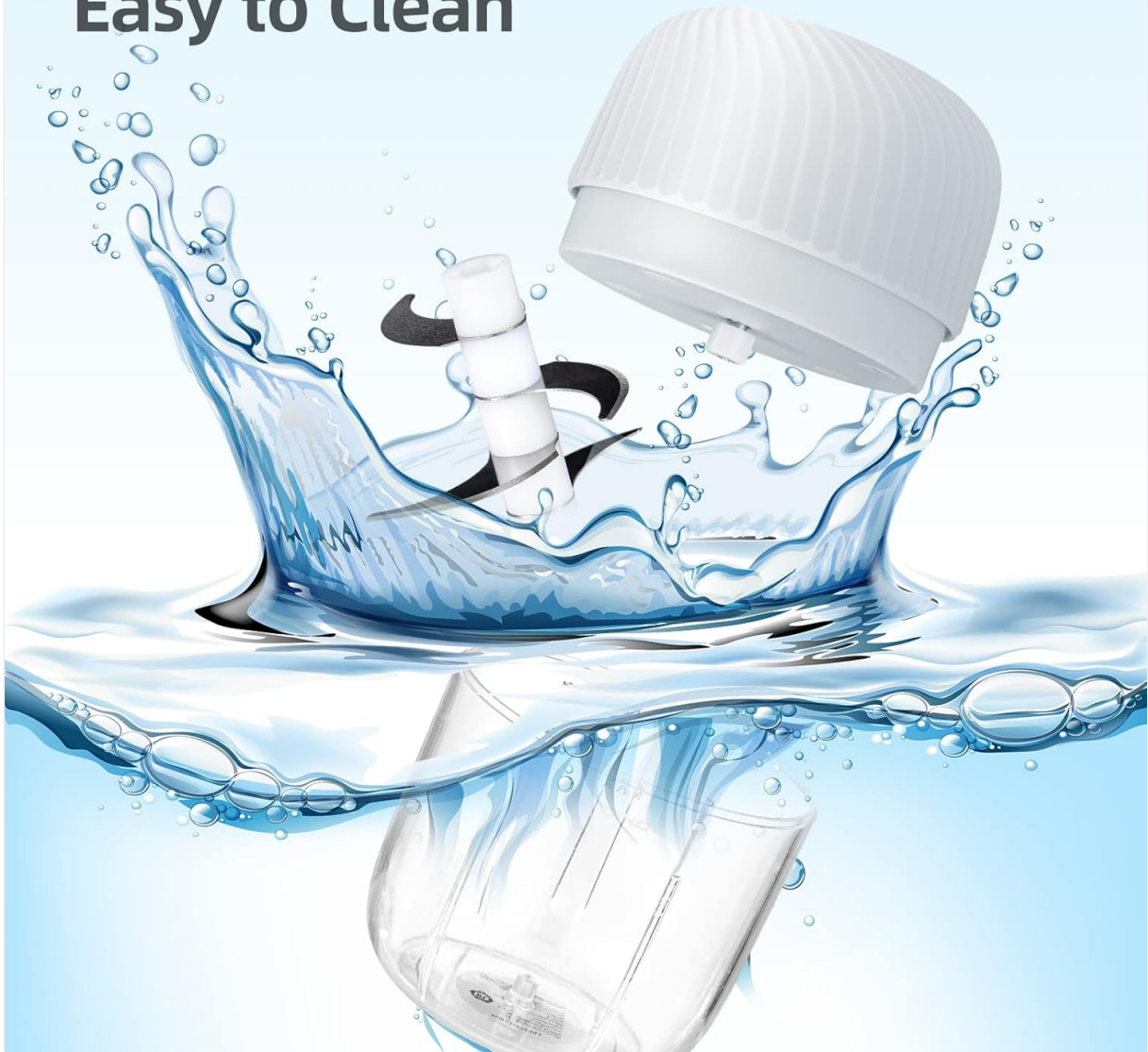
Figure 6.1: Easy Cleaning Process

This image demonstrates how the detachable blender cup and blade assembly can be easily rinsed under water for quick and thorough cleaning.