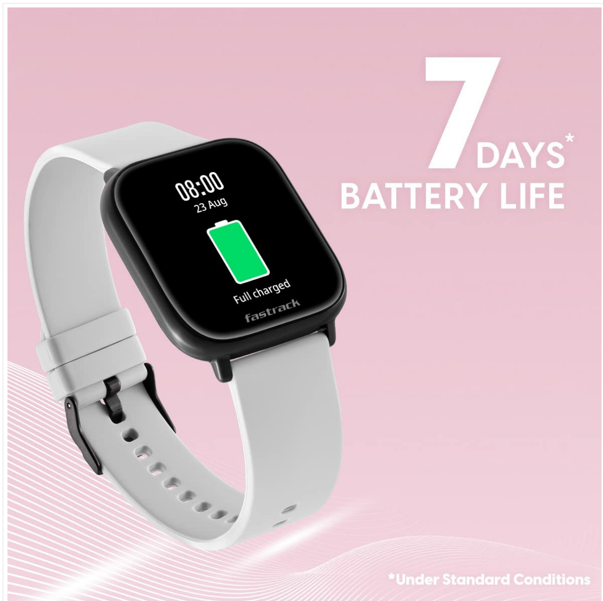
Image: The Fastrack Reflex Vybe Smartwatch screen showing a "Full charged" message and a battery icon, indicating the device is ready for use.

provides up to 5 days of battery life under average usage conditions.