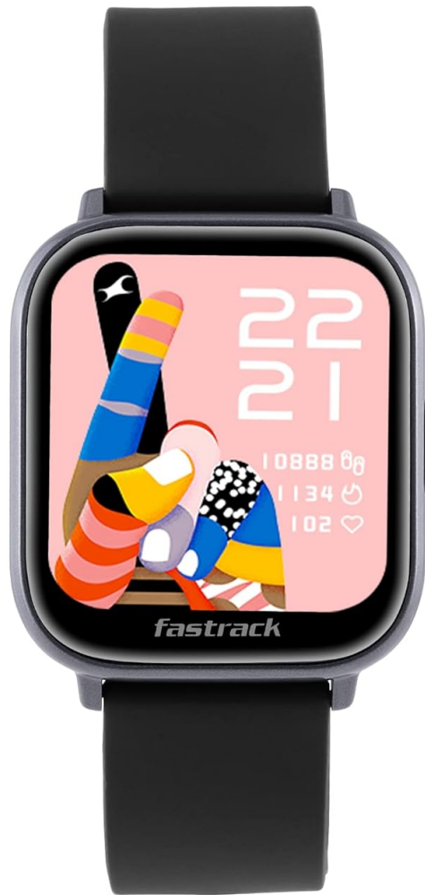
Image: Front view of the Fastrack Reflex Vybe Smartwatch, showcasing its square display and black strap.