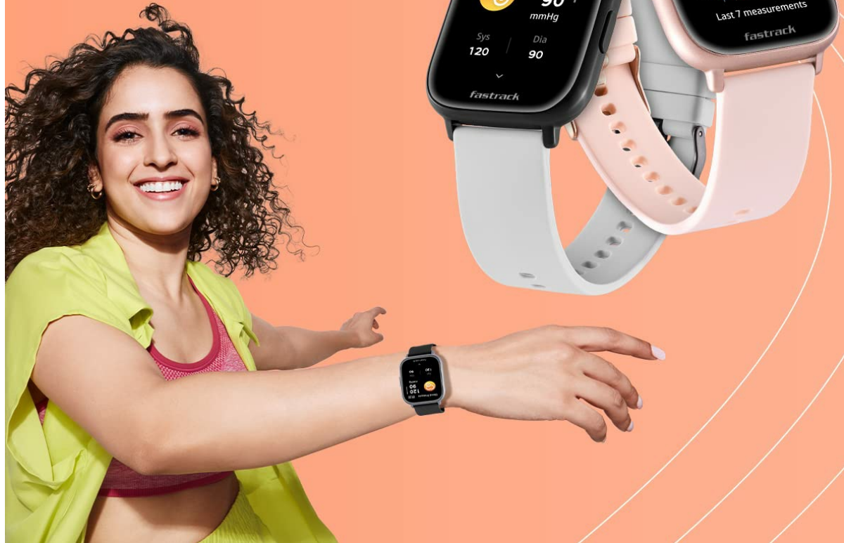
Image: The Fastrack Reflex Vybe Smartwatch screen showing a blood pressure reading of 120/90 mmHg, with a graph of recent measurements.