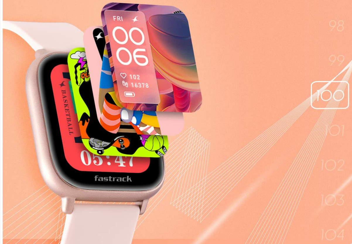
Image: A visual representation of the Fastrack Reflex Vybe Smartwatch with several watchface designs layered, illustrating the variety of customization options available.