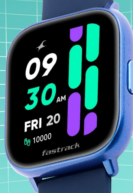
Image: Close-up of the Fastrack Reflex Vybe Smartwatch display, highlighting its 1.5-inch HD screen with time and date information.