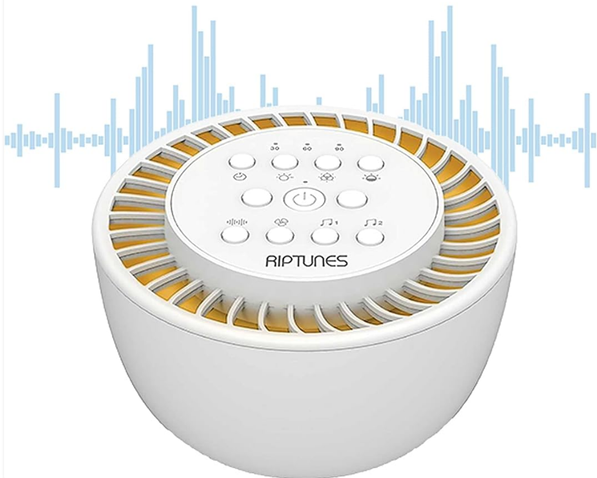
Image: Visual representation of the 36 high-fidelity soothing sounds, categorized into 7 white noises, 7 fan sounds, and 22 nature relaxing sounds, with icons for examples like Birds, Ocean Waves, Lullaby, Stream, Crickets, and Thunder.