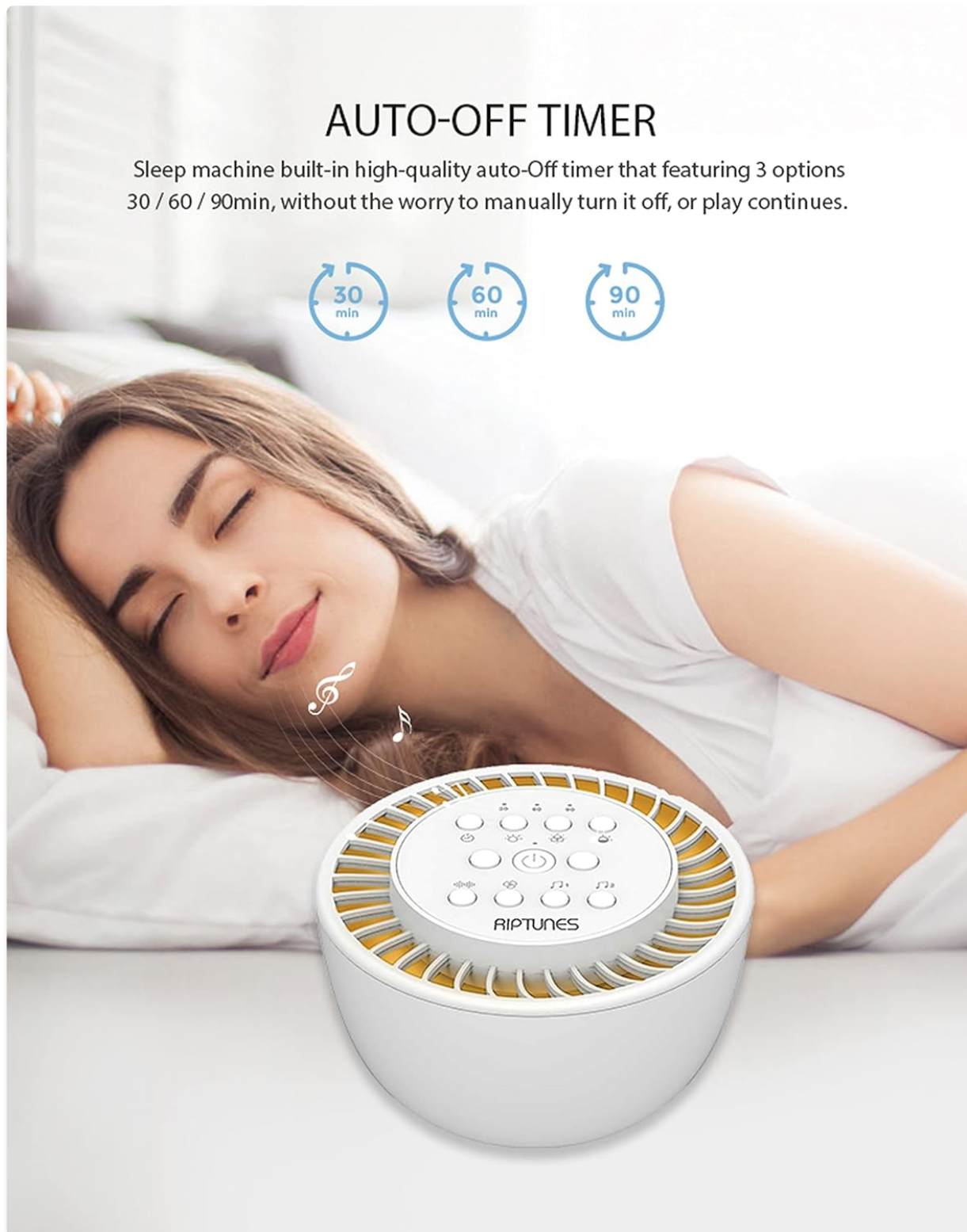
Image: The Riptunes White Noise Sound Machine next to a sleeping woman, with visual cues for 30, 60, and 90-minute auto-off timer options, emphasizing its convenience for timed use.

Set an auto-off timer to conserve battery or for specific sleep cycles.