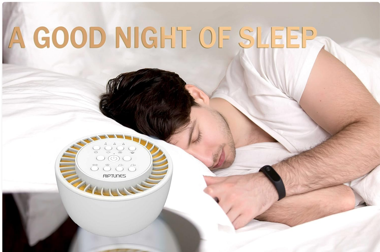
Image: The Riptunes White Noise Sound Machine positioned next to a sleeping individual, illustrating its use for promoting restful sleep.

The Riptunes White Noise Sound Machine (Model SM136) is designed to provide a soothing audio environment for sleep, relaxation, or concentration. It features 36 high-fidelity sounds, a 7-color night light, and an auto-off timer function. This manual provides instructions for the proper setup, operation, and maintenance of your device.