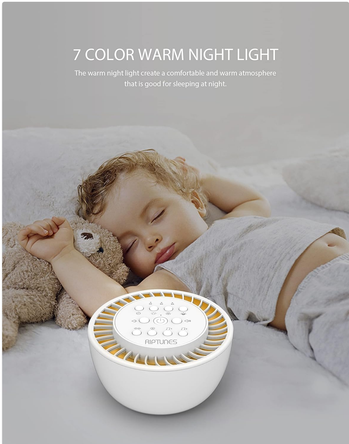
Image: The Riptunes White Noise Sound Machine providing a warm night light in a nursery setting, with a baby sleeping peacefully nearby, highlighting its use for creating a comfortable atmosphere.

The device features a 7-color night light with adjustable brightness.