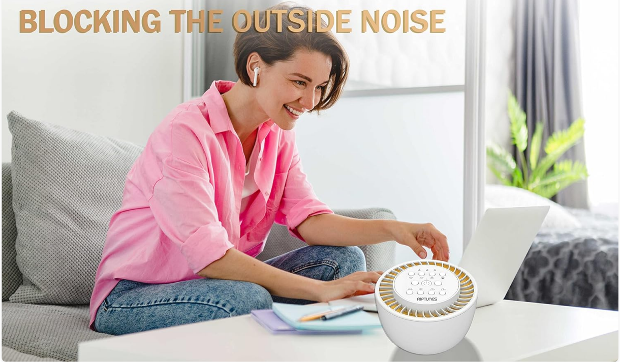
Image: The Riptunes White Noise Sound Machine placed near a person working on a laptop, demonstrating its ability to help block out distractions and enhance focus.