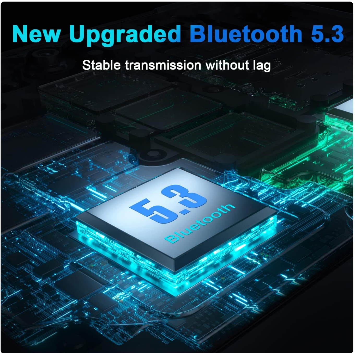
Image: Depiction of Bluetooth 5.3 technology, highlighting stable and lag-free transmission.