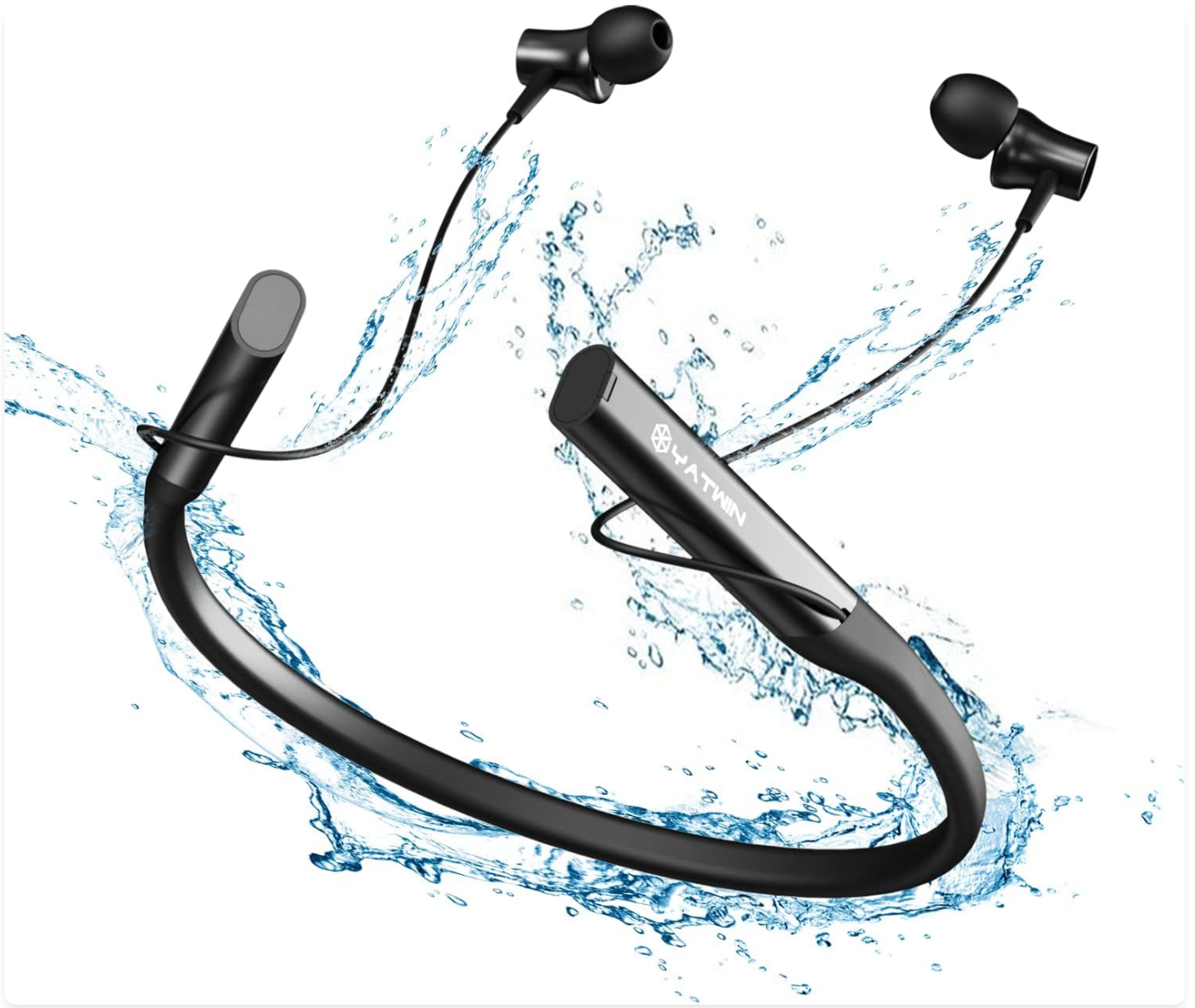
Image: YATWIN Bluetooth Headphones, showcasing their neckband design and water resistance.