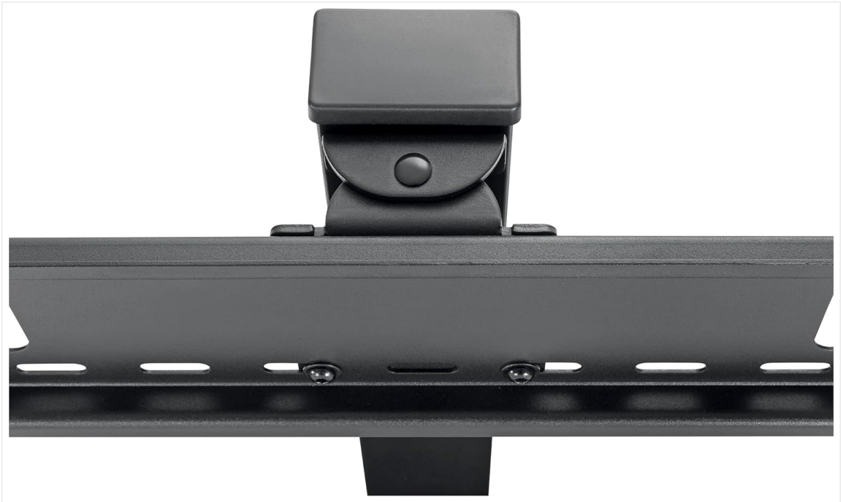
Image: Detail of the swivel mechanism.

gently grasp the sides of your TV and rotate it to the desired position. Avoid excessive force. The swivel range allows for optimal viewing from various points in a room.