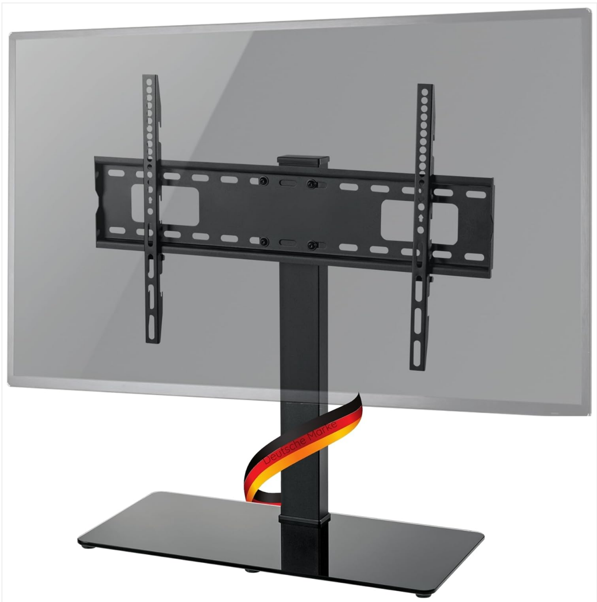
Image: Fully assembled stand with TV.