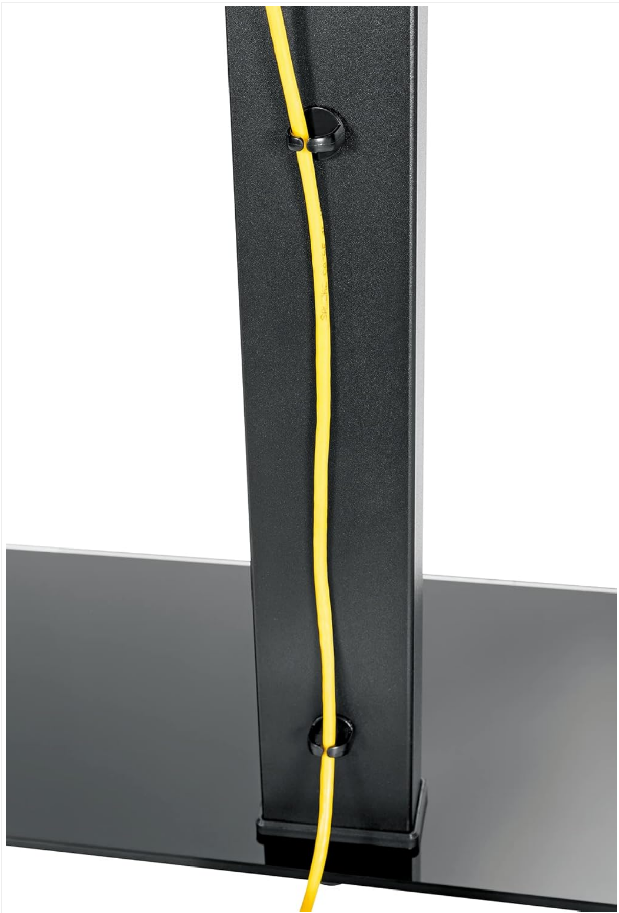
Image: Cable management feature.