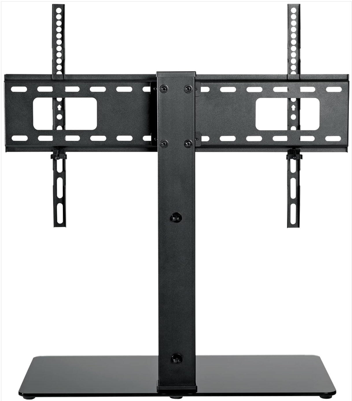
Image: Front view of the stand's column and base assembly.

Attach the support column to the tempered glass base using the provided screws and tools. Ensure the column is securely fastened and upright.