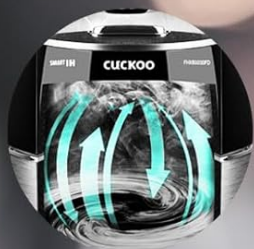
Auto Sterilization Cleaning