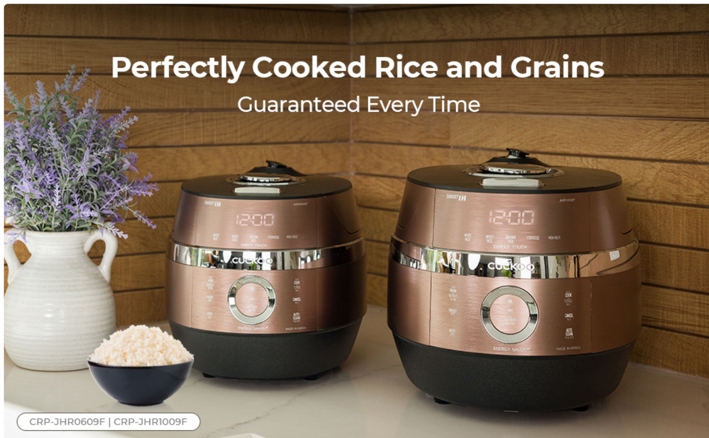
Image: The CUCKOO CRP-JHR0609F rice cooker displayed with various cooked rice and grain dishes, highlighting its versatility.

The CUCKOO CRP-JHR0609F is designed to prepare a variety of meals with its advanced induction heating technology and multiple cooking options. It features a 6-cup uncooked (12-cup cooked) capacity, a 3-language voice guide, and a durable stainless steel inner pot with a nonstick coating.