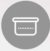
XWALL STAINLESS INNER POT