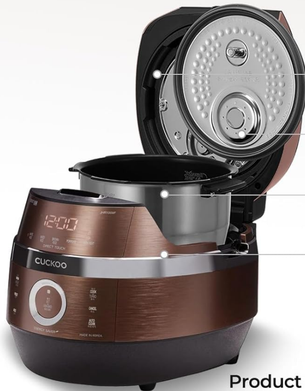
Dual Motion Packing