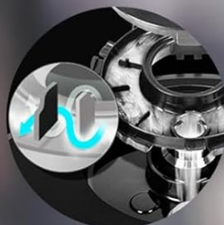
Dual Soft Steam Cap