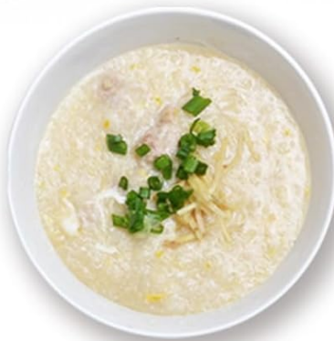
Porridge 83-96 Minutes