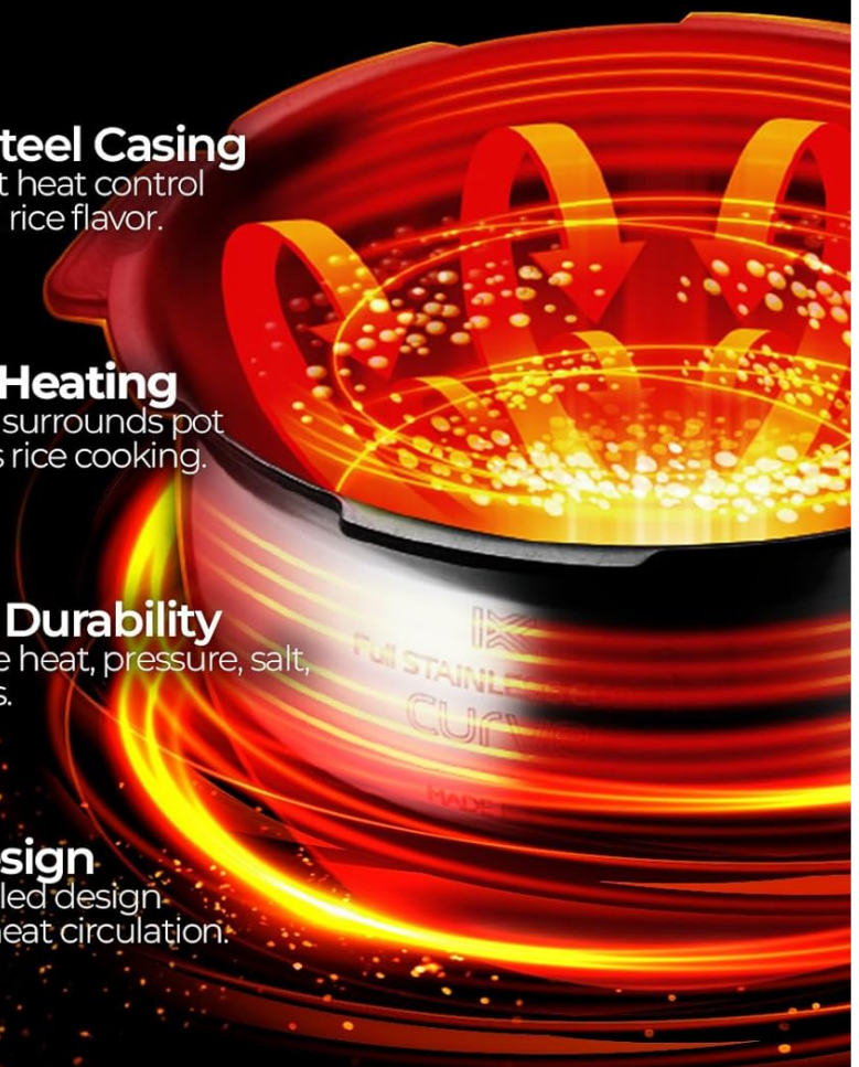
Image: Detailed view of the induction stainless pot, emphasizing its construction and heating technology for consistent rice flavor.