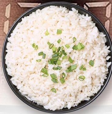
Regular White Rice 25-31 Minutes