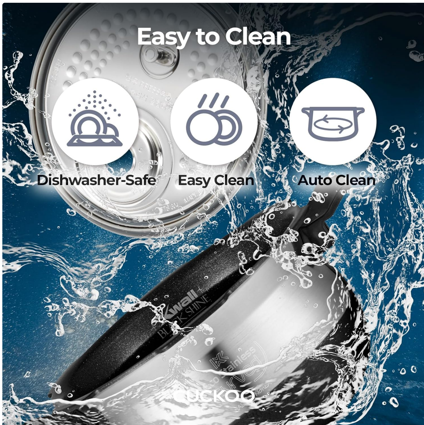
Image: A visual guide to the easy cleaning features of the CUCKOO rice cooker, including the detachable inner lid and the auto-clean function.