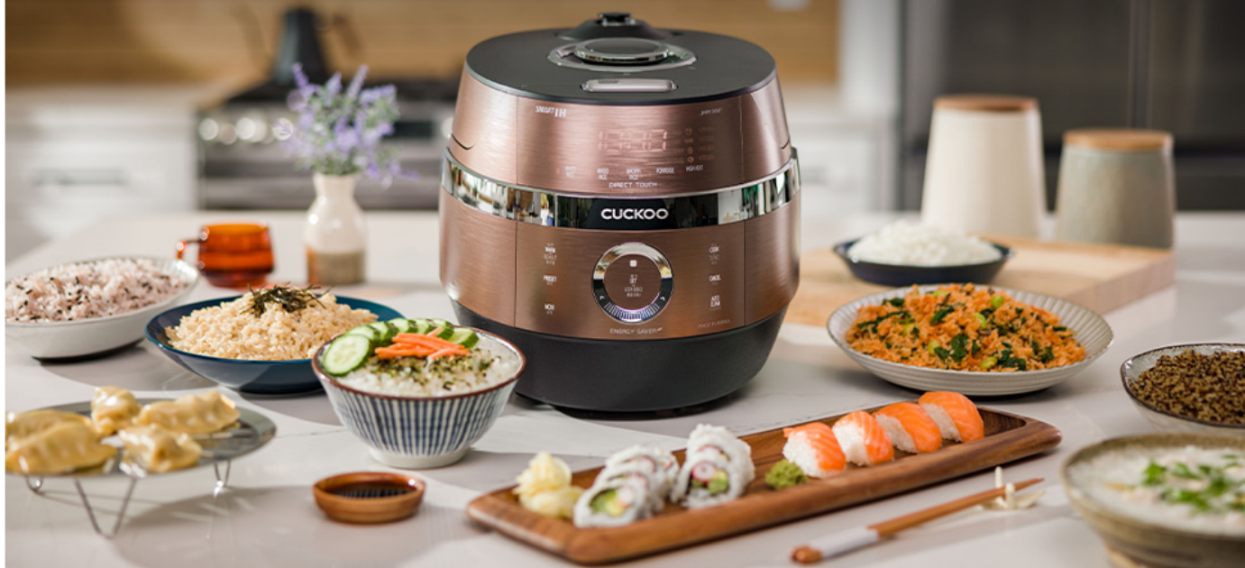
Image: The CUCKOO rice cooker in a kitchen setting, showcasing its ability to prepare a wide range of dishes beyond just plain rice, such as sushi, dumplings, and various grain-based meals.

Explore more than just rice with this cooker – experiemnt with oatmeal, porridge, and more!