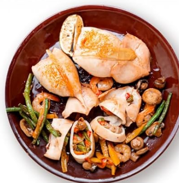
Steamed Seafood 10-40 Minutes