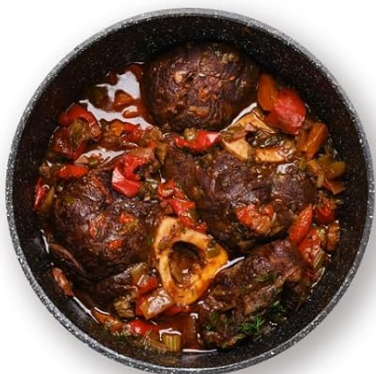
Slow Cook Dish 3-5 Hours