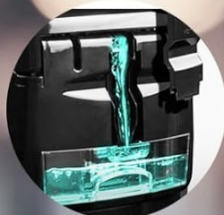
Anti-Stagnant Water Drainage