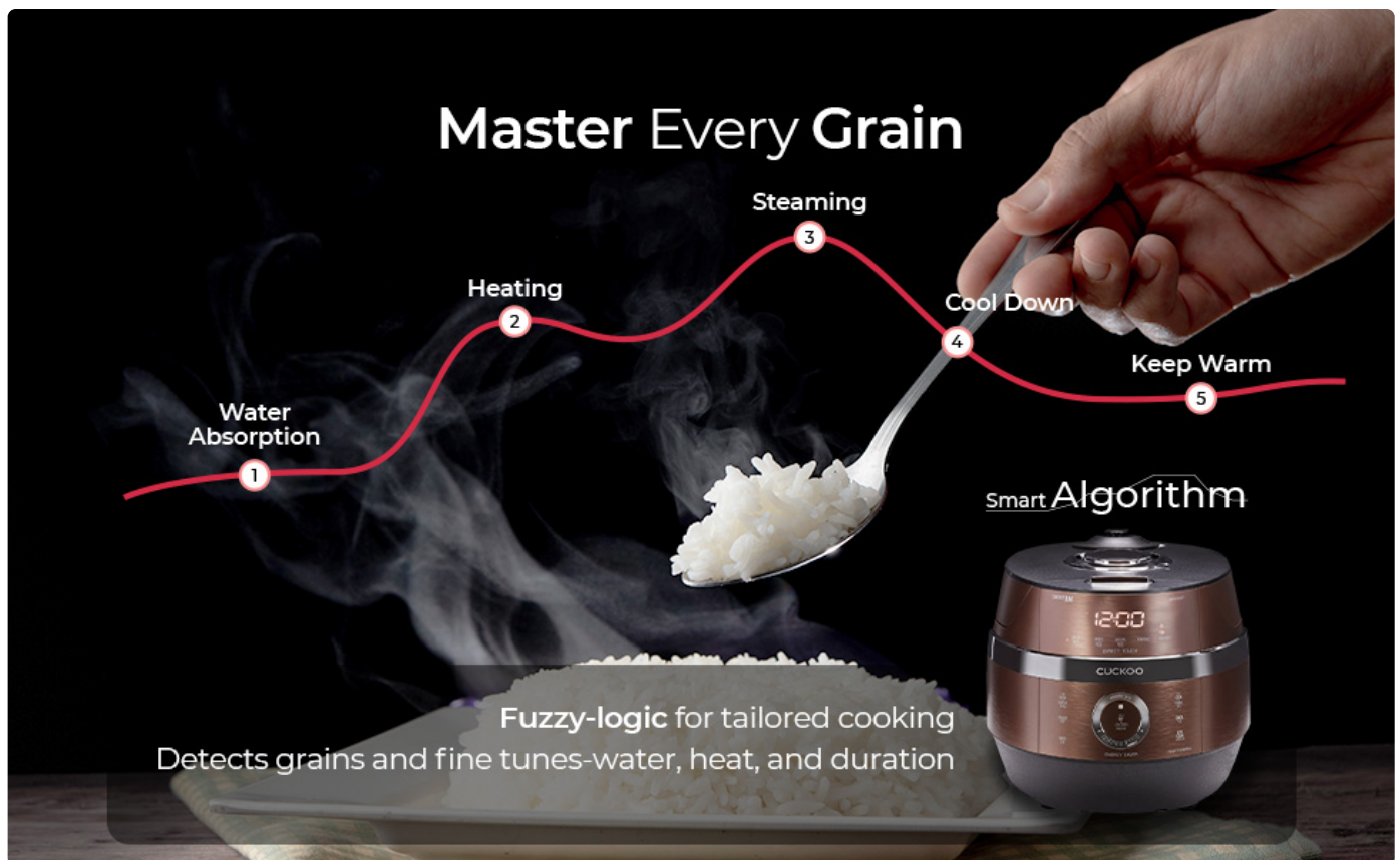
Image: An illustration demonstrating the rice cooker's smart algorithm, which uses Fuzzy Logic to tailor cooking based on grain type, water, heat, and duration.