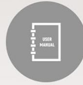
INSTRUCTION & COOKING GUIDE