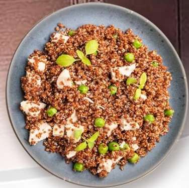
GABA Rice 44-63 Minutes