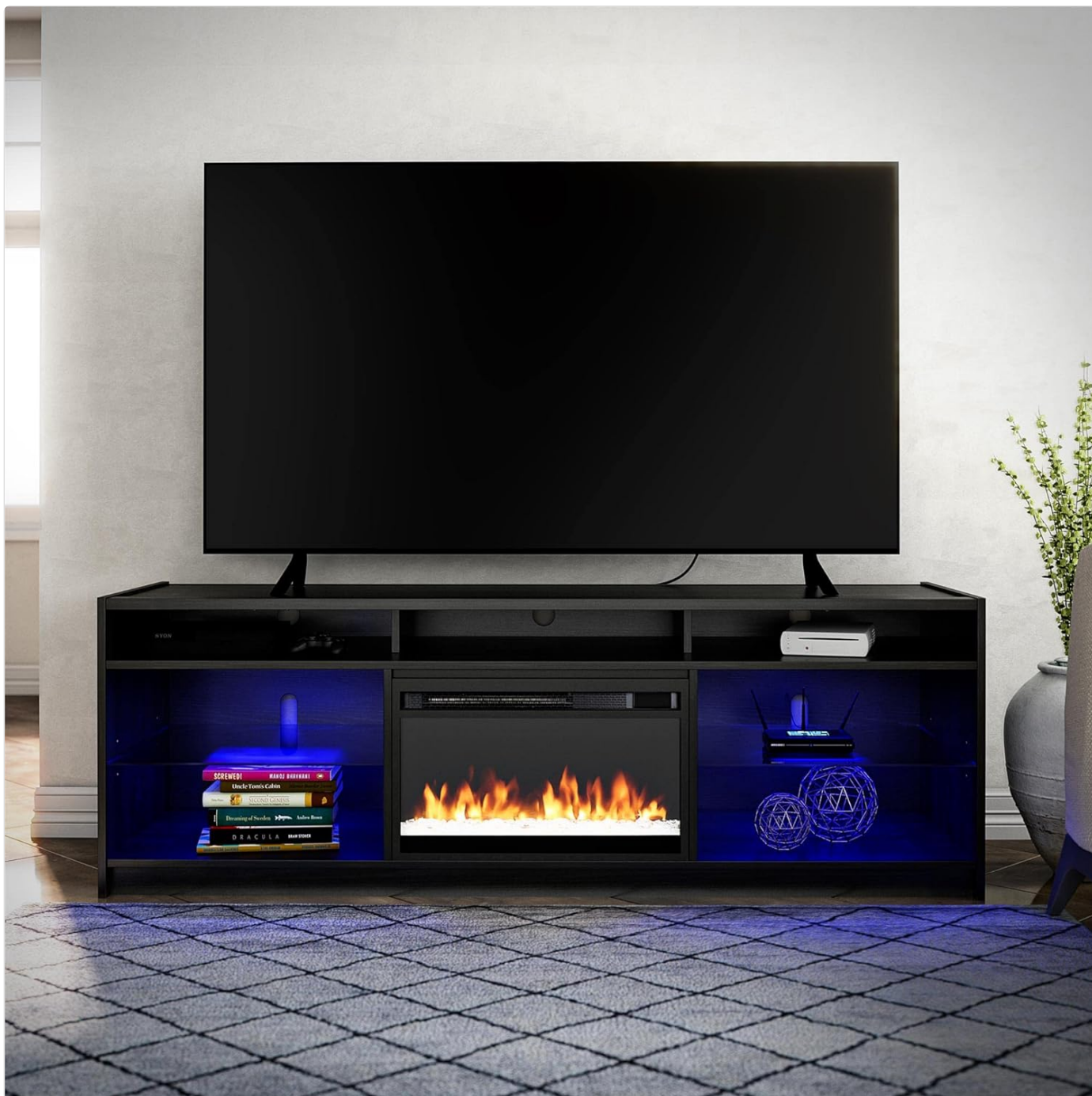
Image: The Ameriwood Home Luna Fireplace TV Stand in a living room setting, showcasing its design with a television mounted above and blue LED lighting on the shelves.