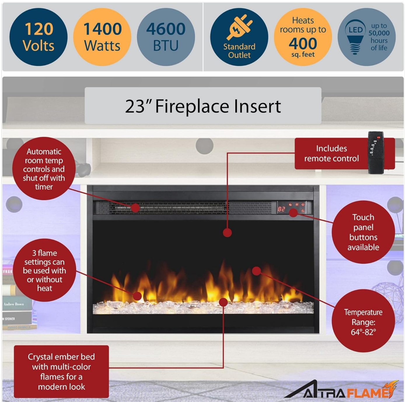
Image: A detailed diagram of the fireplace insert, showing the touch panel buttons, remote control, temperature range, flame settings, and crystal ember bed.