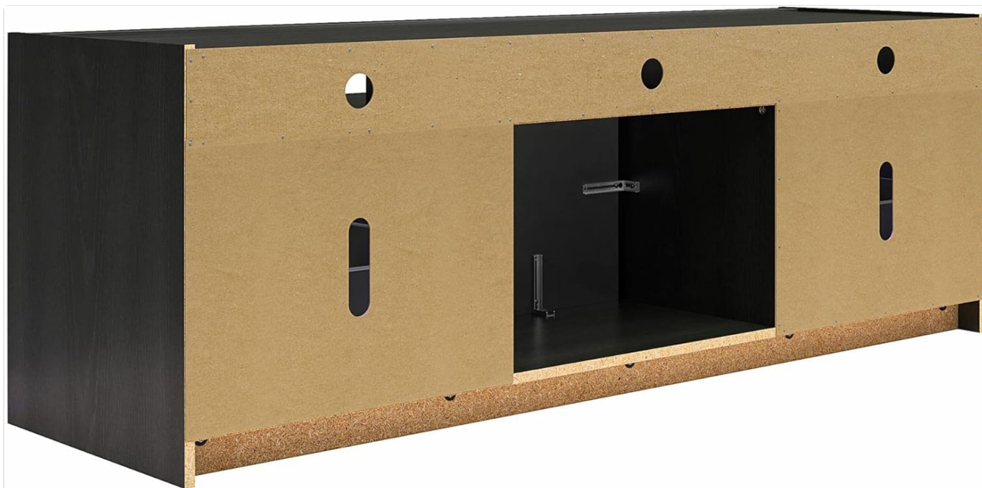
Image: The back of the TV stand, highlighting the wire pass-throughs and cutouts for cable management.