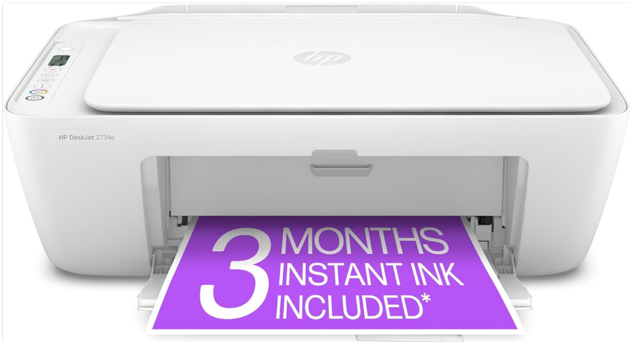
Figure 1: HP DeskJet 2734e Wireless Color All-in-One Printer.

The HP DeskJet 2734e is a versatile wireless color all-in-one printer designed for home use, offering print, copy, and scan functionalities. It supports mobile printing and features dual-band Wi-Fi for reliable connectivity. This manual provides essential information for setting up, operating, maintaining, and troubleshooting your printer.