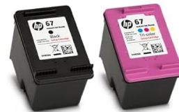
Original HP 67 Ink Cartridges Black, Tri-color