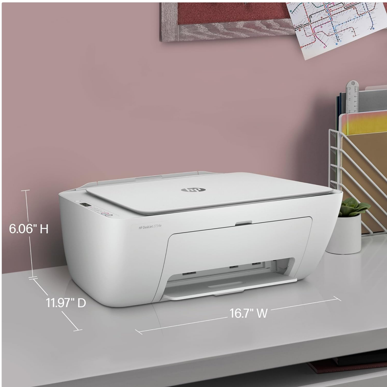
Figure 7: Physical dimensions of the HP DeskJet 2734e printer.