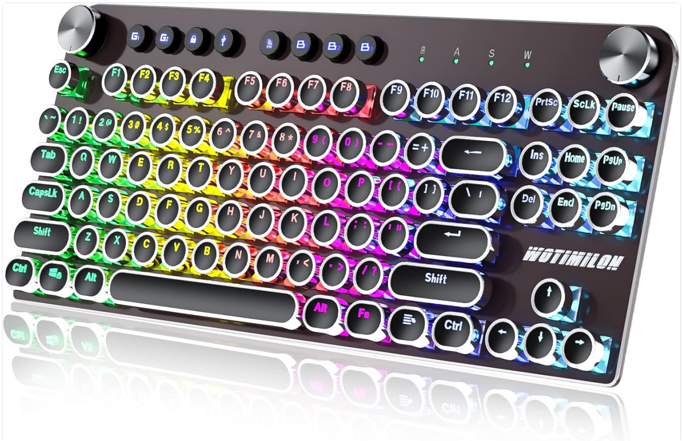
Figure 1.1: WOTIMILON WM87 Wireless Typewriter Mechanical Keyboard