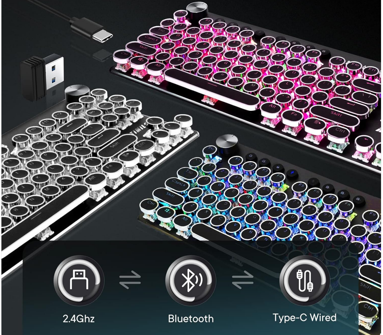
Figure 3.1: Triple-Mode Mechanical Keyboard Connectivity