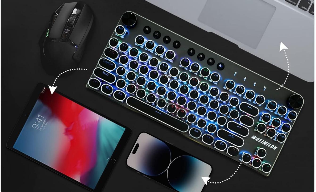
Figure 5.1: True Mechanical Blue Switches

Connects with up to 3 devices via Bluetooth. Compatible with Pad/Laptop/Phone (Win/Mac)