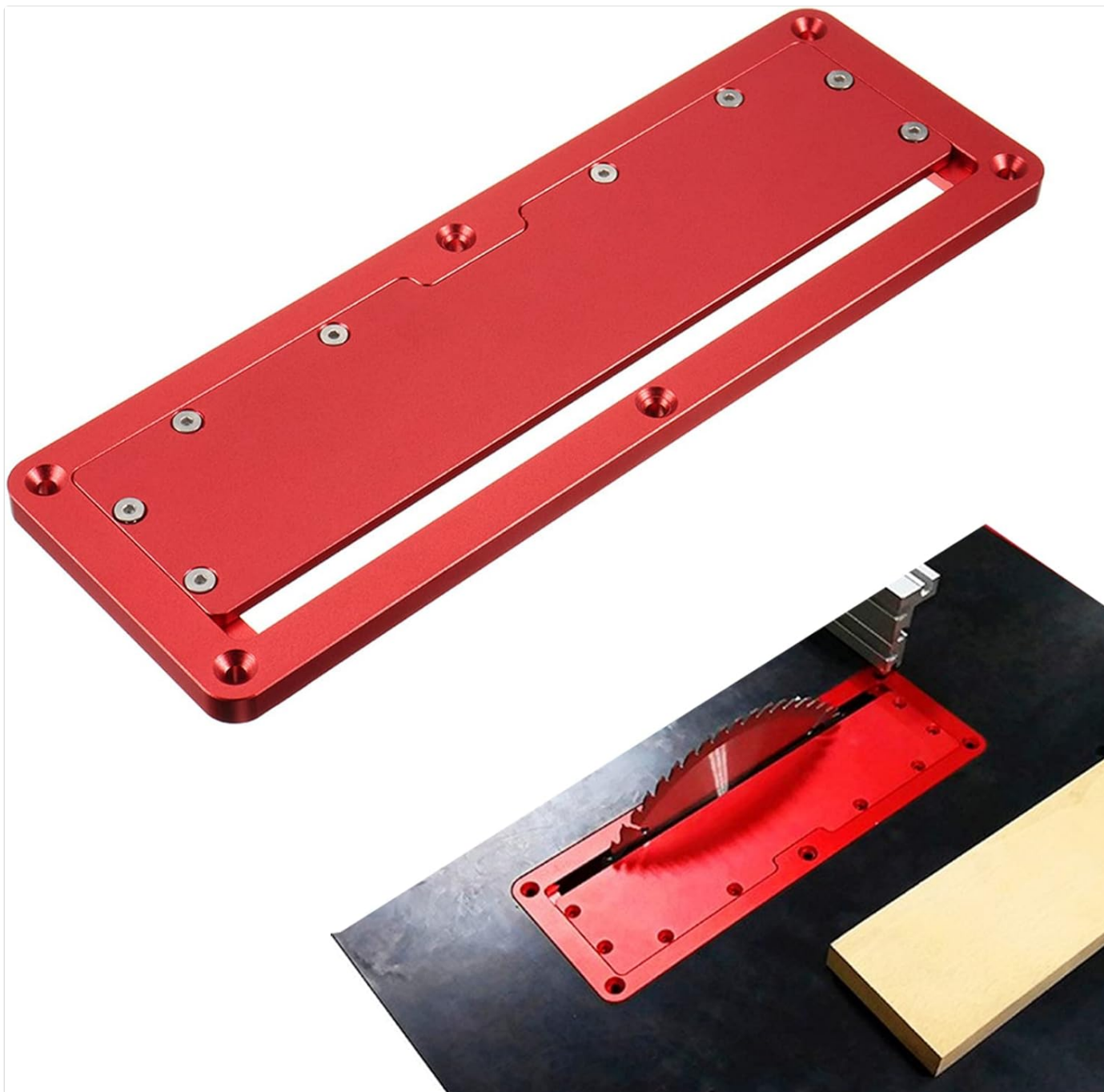
Figure 1: The Jeanoko Table Saw Throat Plate shown from a top-down perspective, alongside an illustration of it installed in a table saw setup with a circular saw blade protruding through it. This image highlights the product's primary function and appearance.