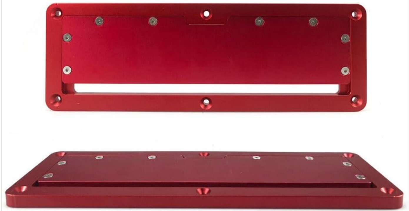
Figure 3: The Circular Saw Flip Cover Plate displayed with a text overlay, emphasizing its adjustable aluminum insert plate design for table saws. This image provides a clear view of the product's full form.

Adjustable Aluminium Insert Plate for Table Saw