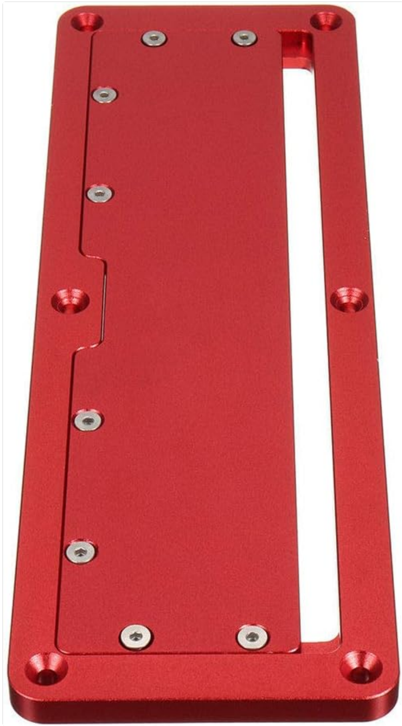
Figure 4: A detailed close-up of the throat plate, highlighting the precision-machined surface and the countersunk screw holes for secure mounting. This view emphasizes the quality of construction.