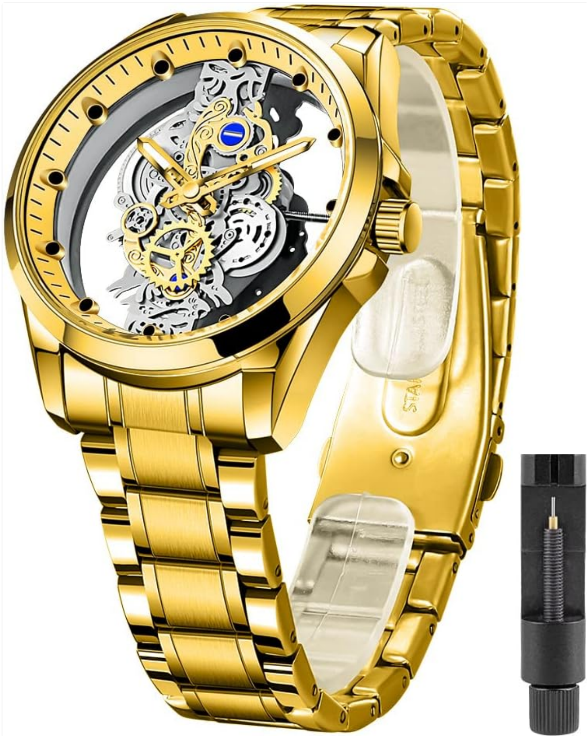
The Tiong A4281 watch shown with the included band adjustment tool.